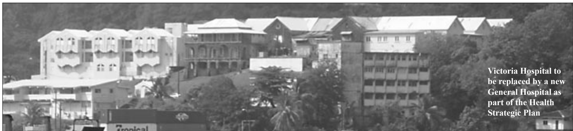
Victoria Hospital to be replaced by a new General Hospital as part of the Health Strategic Plan

According to the Ministe, "Part of the whole movement is to ensure that the Ministry of Health devolves authority to the program managers in the various institutions and therefore you will see a move towards the institutionalization of hospital boards. We have experimented already with St. Jude's hospital, lessons are being learnt from that experiment, we have to do certain tightening up of knots and bolts and iron out some of the chinks in the system and we are looking at Victoria hospital, Golden hope and of course the new general hospital."