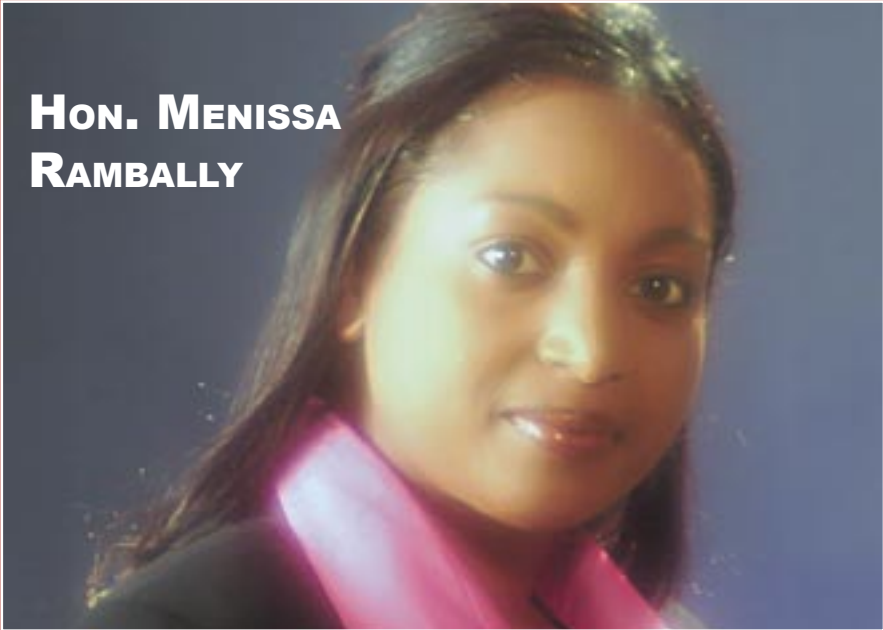
HON. MENISSA RAMBALLY