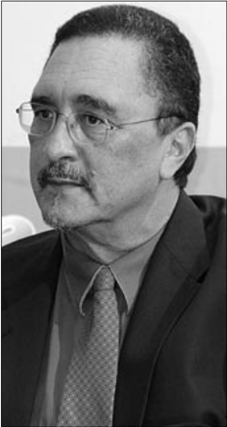
Prime Minister Dr Kenny D. Anthony

ing addressed.” Prime Minister Anthony reiterated that “our tourism industry is so important to our economy and to our national development that we all have to be as concerned about attacks on visitors as we are about crimes against citizens.” The Prime Minister said: “It is important for all Saint Lucians to understand that one single incident can have grave consequences for all of us.” He urged that “the objective of all of us, including the law enforcement agencies and related bodies, must be to create a safe environment in Saint Lucia for ourselves, that visitors can also enjoy.”