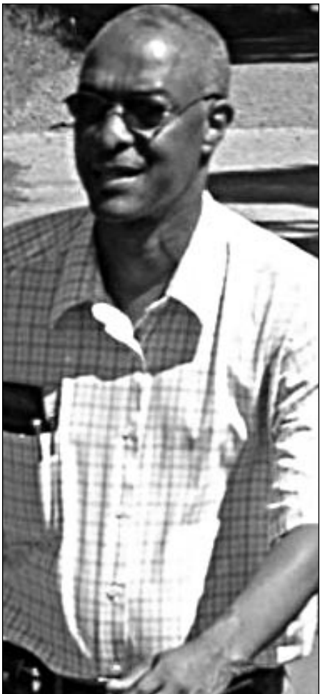
Hon. Felix Finisterre Minister for Communications, Works, Transport and Public Utilities

Minister for Communication, Works, Transport and Public Utilities Honourable Felix Finisterre says every effort is being spared to have road-works in the immediate vicinity of the Castries Comprehensive Secondary School completed by the re-opening of school. While on a tour of the works on the Castries/Gros-slet Highway Wednesday, Mr. Finisterre said the issue of noise and dust pollution were always factored in and are the main reasons why works in that area commenced upon the close of school. Mr. Finisterre is very confident the plans adopted to protect the school from negative impacts from the nearby road, will work. “The big wall which is going nearer to the school is in-fact to enhance the operation of the school and the safety of the road users, the school children, because that is only the foot foundation for a pedestrian bridge with a big bus lay-by on both sides of the road.”