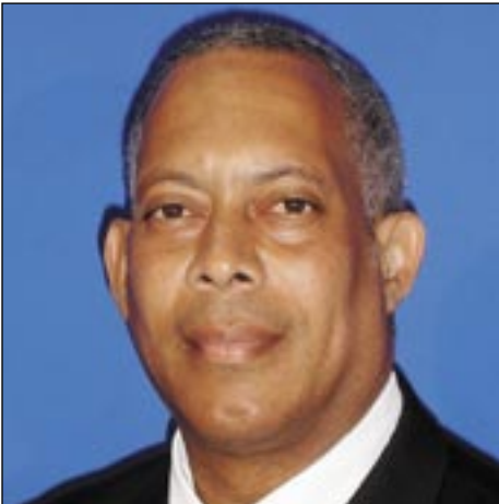
Night Court Imminent - Page 6