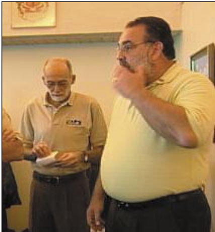
14th CMex Meeting for Saint Lucia – Page 6