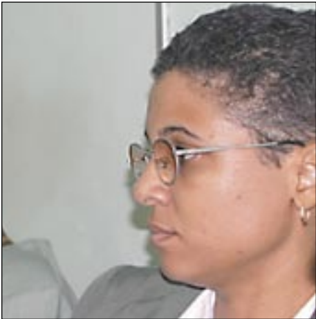
National Risk Register Launched - pages 4 & 5