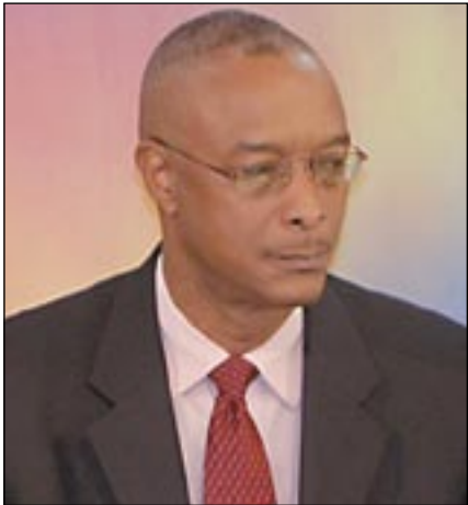
Highway works to end for school opening - page 2