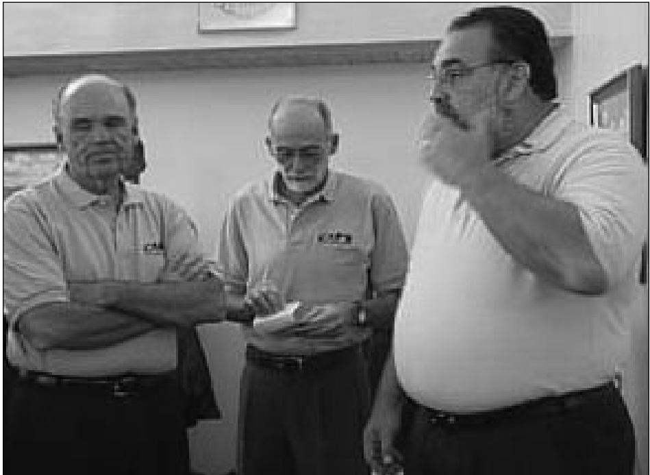
Air Jamaica officials at Hewanorra Airport on the resumption of Air Jamaica flights to Saint Lucia earlier this year