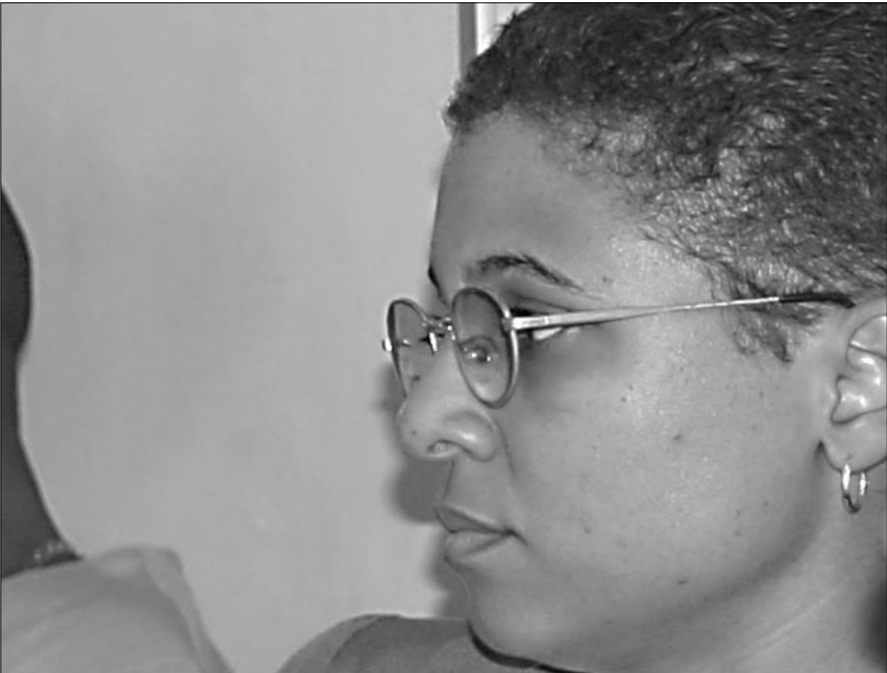
NEMO Director Dawn French

The information displayed in the document is valid only at the date of publication as risks are monitored on an ongoing basis.