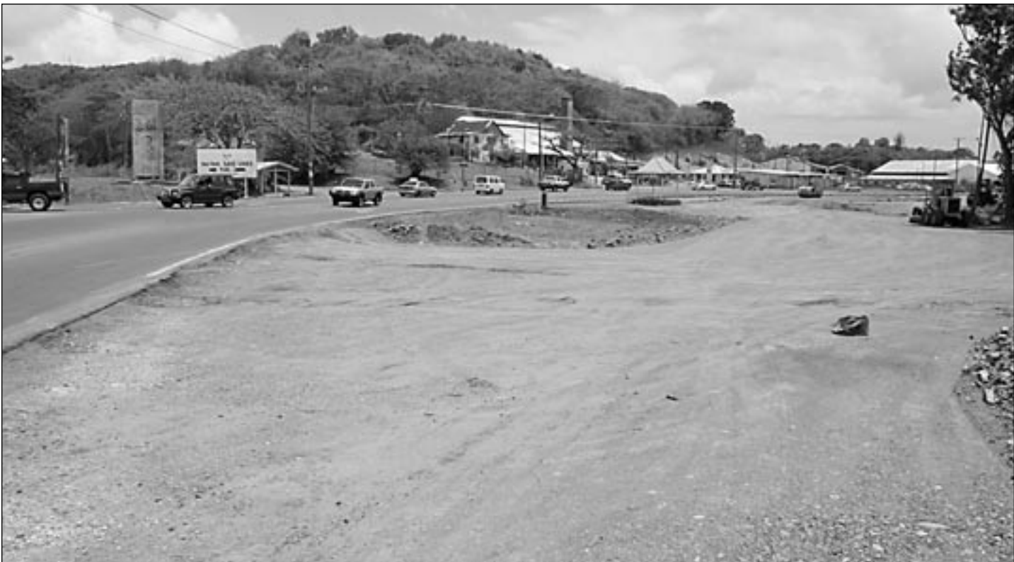
A section of the propose Choc Roundabout