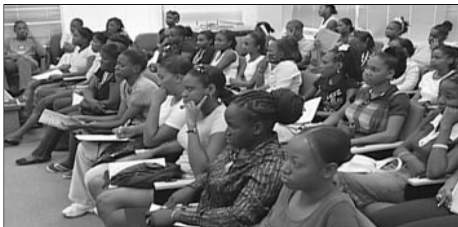
Some of the nursing students at a briefing prior to their departure from St. Lucia

expressed by the body of Saint Lucian nursing students that a local Kweyol talk-show host, monitored on the Internet, had been misinforming the nation about their living conditions in Cuba.