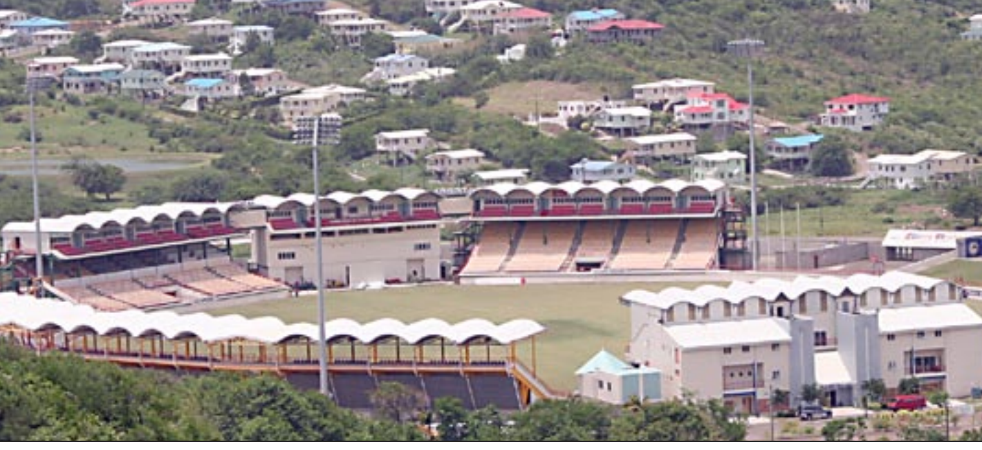
The Beausejour Cricket Ground