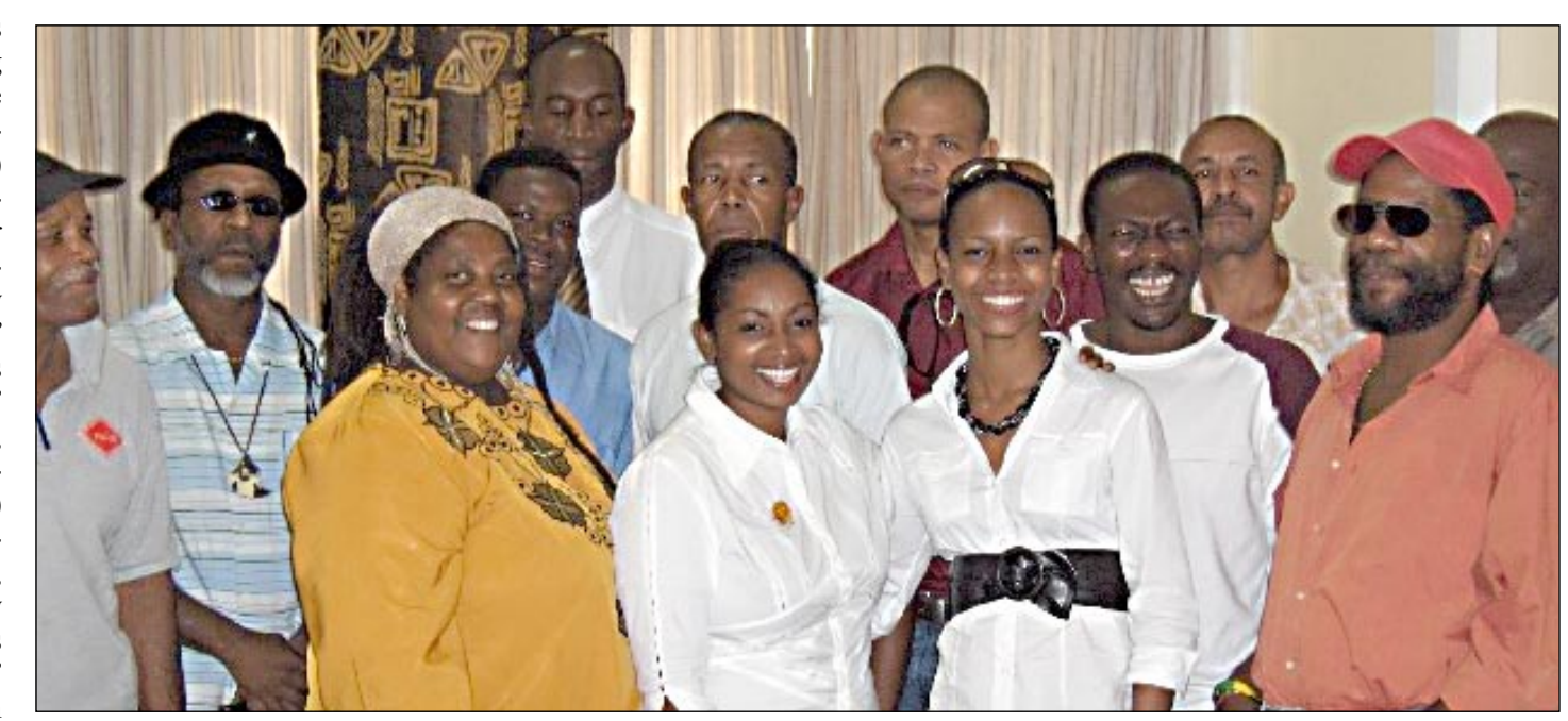
Some of the Artistes/Entertainers