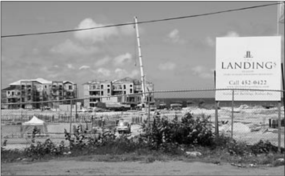
The Landings Construction Site

some of the 60 units for the first phase of the project will also be open in time for CWC 2007. By their estimates, the Landings officials say the impressive and elaborate lagoon being constructed as part of the billion-dollar project will also be completed in time for Cricket World Cup. The other yachting and marine-related property also taking shape at Rodney Bay is The Harbour, which employs 85 workers. Tropical Homes, the company behind The Harbour, says that project too is quickly taking shape. The Landings and The Harbour are both major investments in the tourism and yachting industry sector by local hoteliers and entrepreneurs.