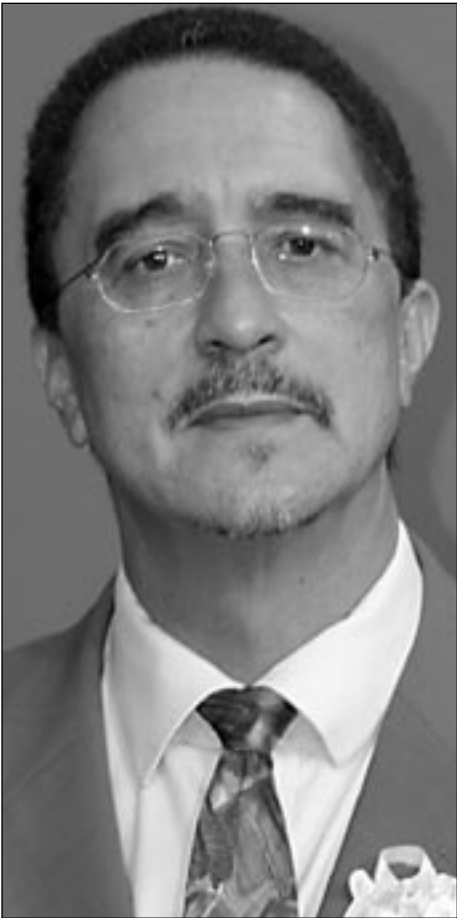
Prime Minister Dr. Kenny Anthony

I recall the official launch of the MIASL last year, at which Government was represented by the Minister of Tourism, Honourable Phillip J. Pierre. Shortly thereafter, you may recall that Her Excellency Dame Pearlette Louisy, in the Throne speech, promised Government's intervention to address the legislative regime for yachting and the sea. We are pleased that the MIASL has conducted a lot of research into the existing legislative regime, and submitted it's findings to the Attorney General's office, in order that together we may begin to consider the enactment of yachting specific legislation to enable the sustainable growth of this important segment of our tourism product. I realize that the contribution of the yachting sector is perhaps not as well known as it ought to be, and that it may actually be greater than is reported. The latest figure that we have, EC$139.2 for 2004, is based on incomplete data. I expect that the MIASL will take the necessary steps to correct this, working assiduously with other agencies such as SLASPA and Customs. I also look