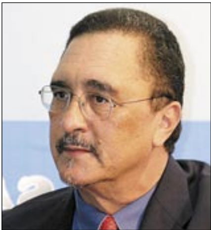
Labour Code One Step Closer - page 2