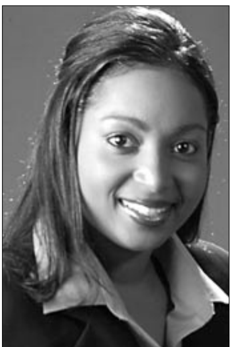
Hon. Menissa Rambally

Minister of Social Transformation of St Lucia, the Honourable Ms Menissa Rambally, has urged delegates of the Commonwealth Caribbean Youth Exchange (CYEX) to be responsible youth leaders. The thirty-year-old Minister, who was elected to parliament at the age of 21, addressed the young people on issues related to youth and politics at the Lambert Beach Resort in Tortola, BVI, last Wednesday August 16th. "Do not let society define what your needs are...your needs are the same as every other citizen in your country, hence leadership should be about integrating people and not stereotyping as some have the custom of doing," she said. Delegates were advised that it was alright to be evolving as young people. "It is okay to move from one interest to another. Your minds are active and you are exploring possibilities...if those possibilities take you to politics, then it calls for development, integration and sharing your knowledge...politics is a people-driven career so you must have the interest of others at heart." "Today, possibilities are immense and limitless and this generation is doing things that were not traditionally done," Minister Rambally observed. Delegates were told that the real world today sug-