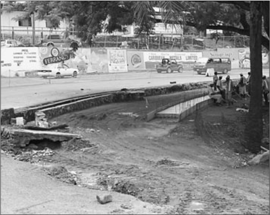
Work on the Castries Gros Islet Highway- the proposed Union Roundabout (top left ), the Vigie Roundabout (top right) and the near the Castries Comprehensive School ( bottom)

T he Government of St. Lucia continues its thrust towards drastically improving the road networks in St. Lucia. With the completion of the West Coast Road project and the ongoing road works on the East coast, the Castries/Gros-Islet Highway is also in for major transformation. The Castries-Gros Islet Highway Improvement Project when it is complete is expected to greatly ease the pressures associated with the flow of traffic between the city and Gros Islet. Now it its first phase, this project, is being undertaken by the Government of Saint Lucia and implemented by the Ministry of Communications, Works, Transport and Public Utilities through a loan from the Kuwait Fund for Arab Economic Development.