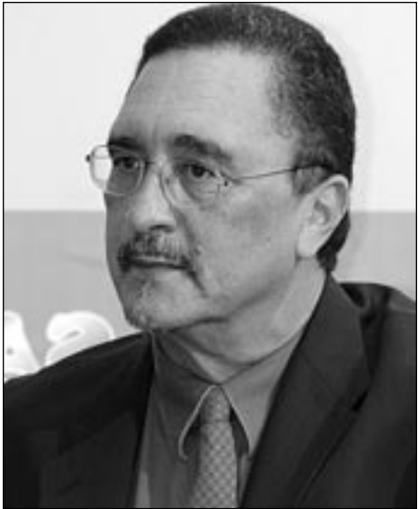
Prime Minister Dr. Kenny Anthony

ing that term because I think we have to think about the country and the future of the country. We have to think about what the country requires and how to progress. The economy is doing exceedingly well and we must not engage in decision making that can compromise in any way what is taking place. But at the same time we have to give both sides their due and that is why it is important that we arrive at a shared consensus in this undertaking."