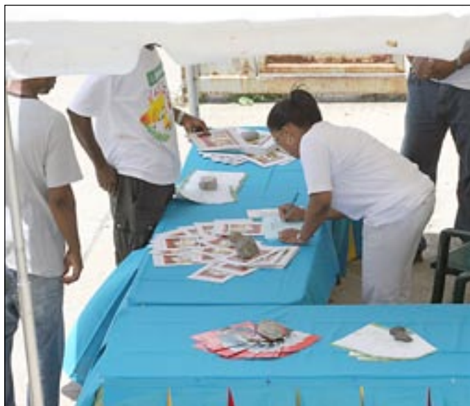
An Information Booth