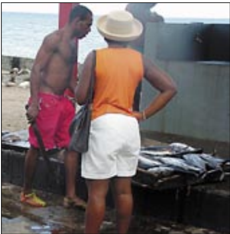
First Ever Fisheries Census – Page 6