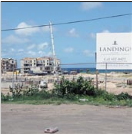
200 Employed on Rodney Bay Marine projects – Page 3