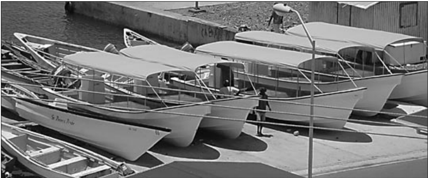
Selling fish at a local fisheries complex (top) and fishing boats berthed at the Complex

the significant changes which have occurred in the agricultural sector over the last ten years, particularly in the banana industry.