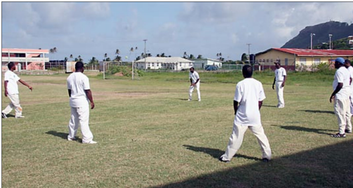
Action in one of the cricket matches

are slated for Micoud and Dennery with the ultimate aim of visiting all communities on the island before the World Cup comes around next year.