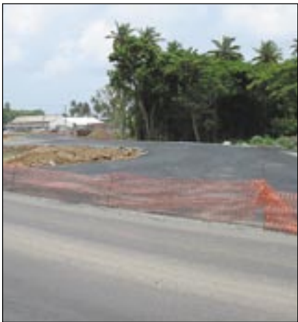
Understanding for Castries Gros Islet Highway Project – Page 7