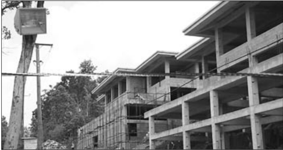
The new Mental Health Hospital Under Construction off the Millennium Highway