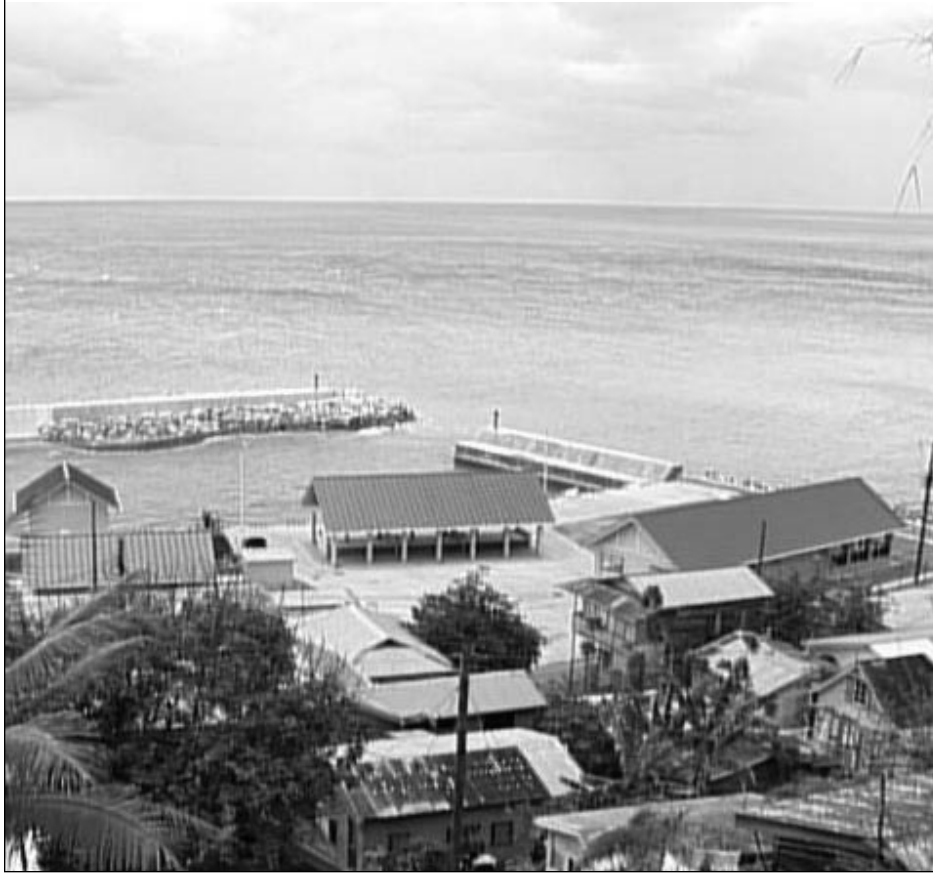
Another Fisheries Complex

As they plodded ahead with their agenda, it was also clear that they were not about to pay any attention whatsoever to either what the Reverend Father said on the opening day, or what the day means to most Ca-