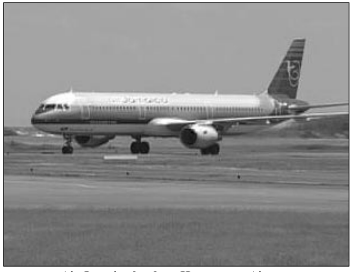
Air Jamaica lands at Hewannora Airport