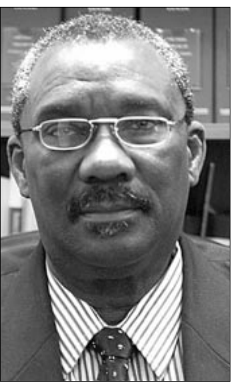
Hon. Senator Calixte George

The growing demand for EMS is reflected in the 8143 ambulance calls recorded for the year 2005. This data translates into approximately 22 calls per day. Most accidents, injuries and emergencies occur away from a hospital. The initial care at the scene as well as the continuation of that care during transportation to the hospital is crucial. Training as well as the acquisition and