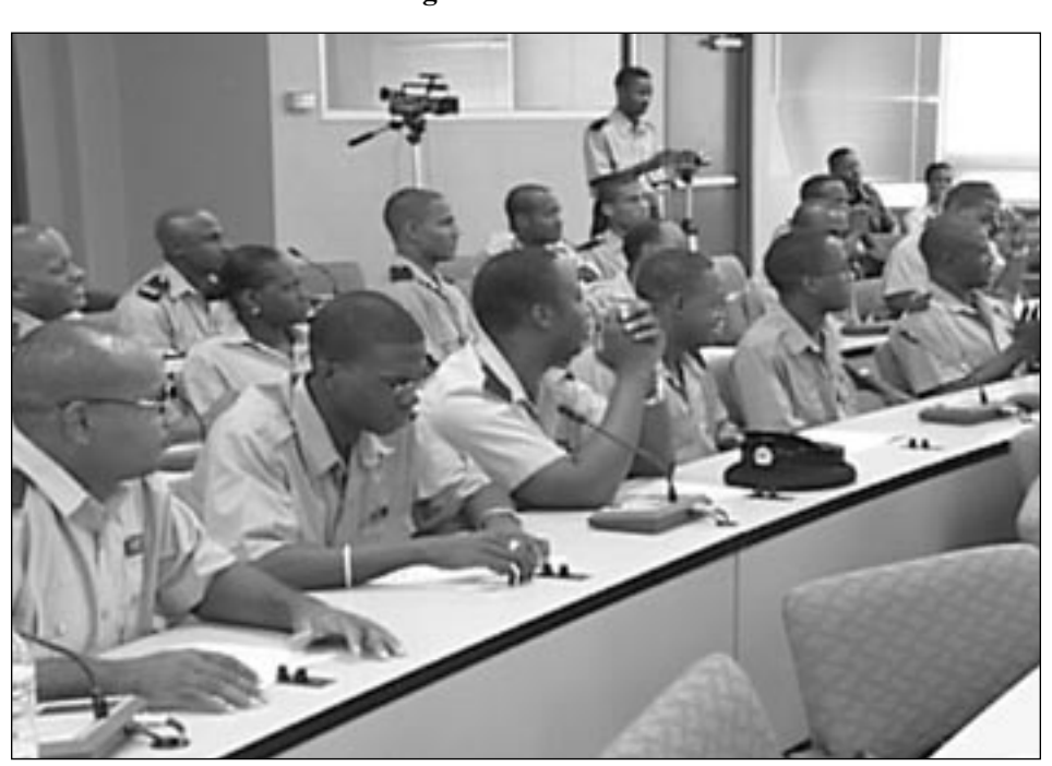
Some of the trained EMT's

maintainance of appliances and equipment are mandatory towards the quality care which is expected from EMT. I am therefore pleased to announce that the 2006/2007 budget makes provision for the replacement of five (5) ambulances as well as the acquisition of ambulance supplies.