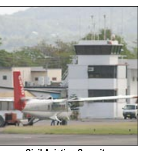
Civil Aviation Security - page 3