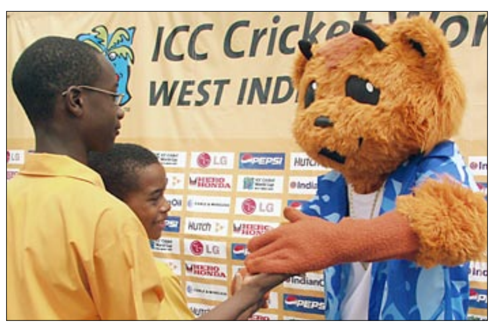
Mello meeting some students at the Vigie Airport

Committee s last week launched another aspect of its Public Education Programme, a schools' programme. The LOC has begun a series of visits to schools in order to sensitise children on the up coming ICC Cricket World Cup 2007 and to encourage their involvement in the sport of cricket. Each school visit is expected to last 45 minutes and children will be introduced to the Mascot Mello.