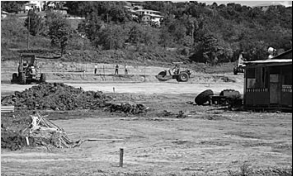
Ground works for new secondary school in Gros-Islet

Let us all work together during 2006 to build a harmonious, peaceful and orderly Saint Lucia. I know we can do it, if we try. I thank you, and wish you a 2006 rich in good health, blessings, joy and success.