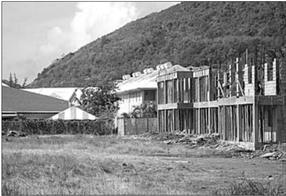
Tourism construction projects - reducing unemployment

What then are our priorities for 2006? For this year and until such time that the General Election is announced, the Government will focus on six (6) priorities. Priority number one is to secure further reductions in crime; Priority number two is to intensify efforts to reduce unemployment; Priority number three is to speed up implementation of the Universal Health Care System, the UHC; Priority number four is to complete preparations for the Cricket World Cup, 2007; Priority number five is to complete the drive to universal secondary education, to provide every child a place in a secondary school; Priority number six is to ensure that Saint Lucia conducts its electoral business without reproach and Saint Lucian participate in elections that are free, fair, and free from fear and intimidation.