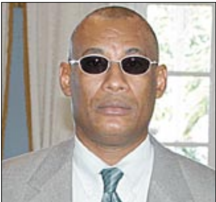
Dennery Hospital - Major review underway - page 7