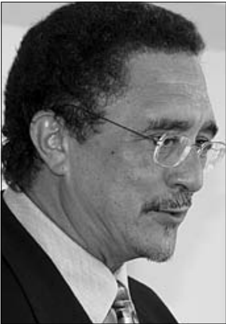
Prime Minister of Saint Lucia Hon. Dr. Kenny D. Anthony

Private sector construction activity was particularly buoyant in 2005, owing to increased confidence in the economy. This is evidenced by the following indicators drawn from the first half of the year. (a) Investment expenditure in tourism plant of $60 million; (b) Investment in telecommunications equipment and plant of $17.1 million; (c) A 7.1 per cent increase in the value of imported construction material to $43