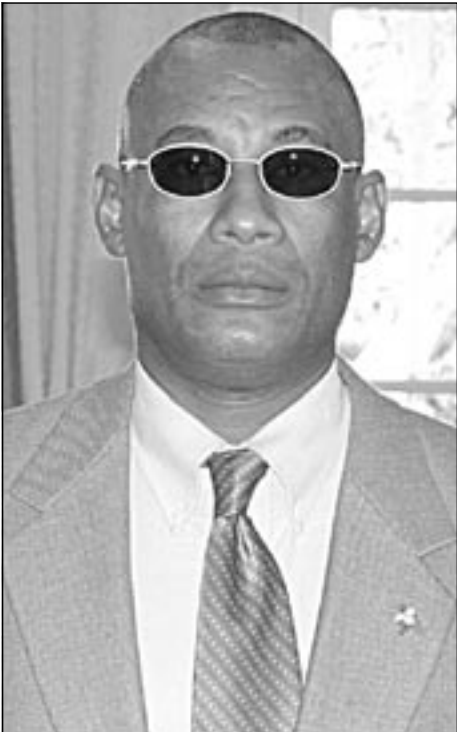
Hon. Damian Greaves Minister for Health, Human Services, Family Affairs and Gender Relations

has already mapped out a new vision for the Dennery Hospital. He says the plans were shaped in keeping with the national goal of providing superior health delivery at all health institutions island wide.