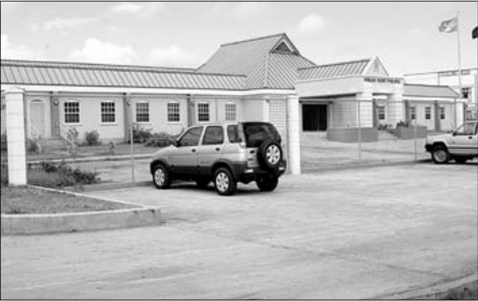
More resources for the police to combat crime

When I addressed you at this time last year, the emphasis was on the priorities for 2005. Indeed, I had set seven priorities for the Govern-