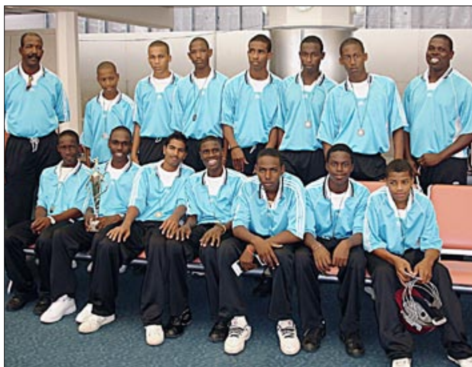
Jubilant Saint Lucians cricketers at the Grantley Adams Airport in Barbados on route to Saint Lucia