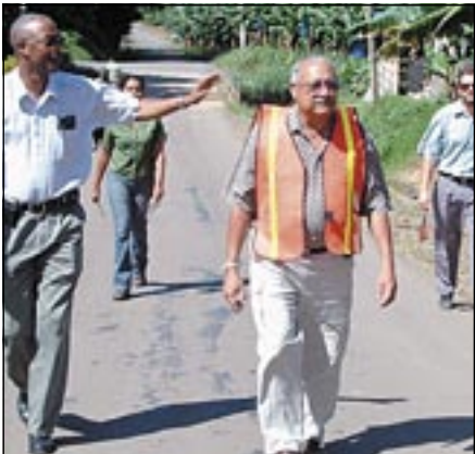
Better health care and employment for babonneau - page 2