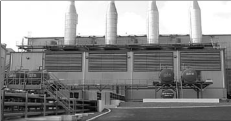
Fuel is the major input in energy production in Saint Lucia

says Sir John's statements regarding Venezuela and Cuba's relations with Caricom "not only reek of the Cold War, but are also inconsistent with