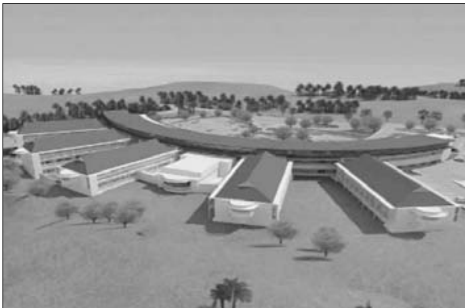
Expanding health care - Impressions of the new hospital

Additional measures introduced last year to intensify fight against crime in 2005 included the introduction of a new Criminal Code which came into effect; and later in the year the new