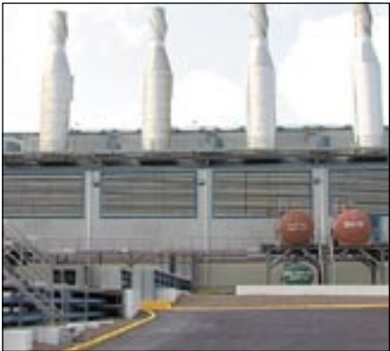
Energy Task Force discuss Petro-Caribe Agreement with Venezuelans - page 3