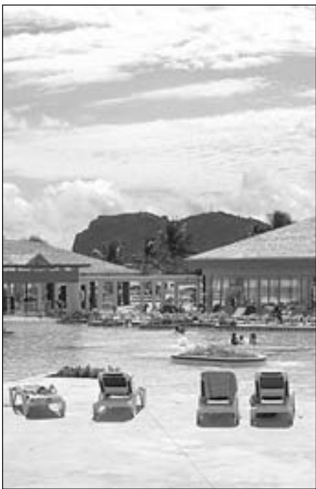
Tourism grew in 2005

In the course of this year, further reform will be effected to the court system. I propose to in-