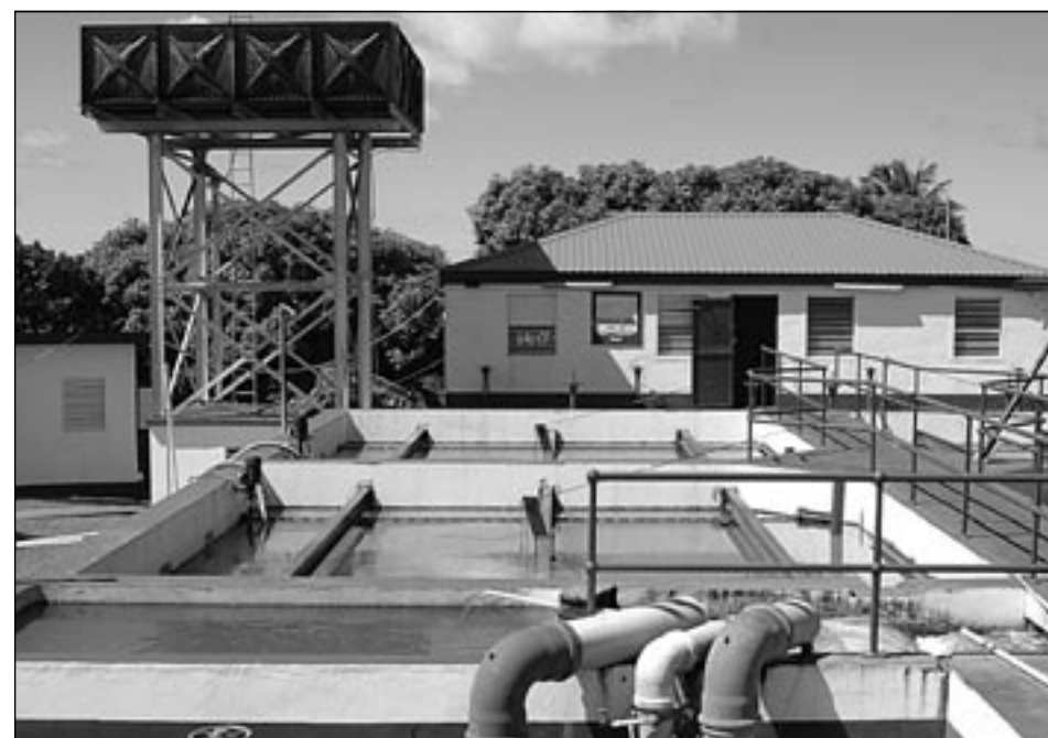
Improved water treatment and distribution

The full text of the Minister's address is available at the Government of Saint Lucia website www.stlucia.gov.lc