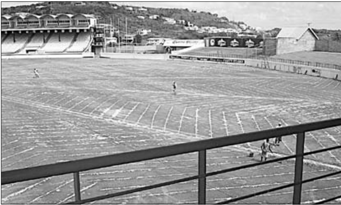
Improvement to the drainage at Beausejour for cricket in 2007

St. Lucia will be present at the official ceremony launching the CSME in Jamaica on January 30th, 2006. Our presence there will be to reaffirm our commitment to the new regional