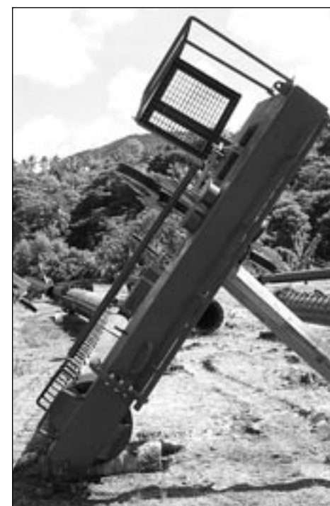
Aerial Tram under construction

Residents of Chassin and indeed all of Fond Assau and its surrounding areas have reason to look toward 2006 with renewed optimism. The scheduled opening of the Aerial Tram project early in the new year will result in employment for over 75 persons; especially youth, with the majority naturally coming from the immediate