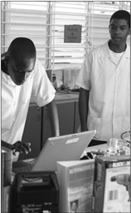
Secondary education for the future

There can be no doubt that the attainment of universal secondary education by the next academic year will be a monumental milestone