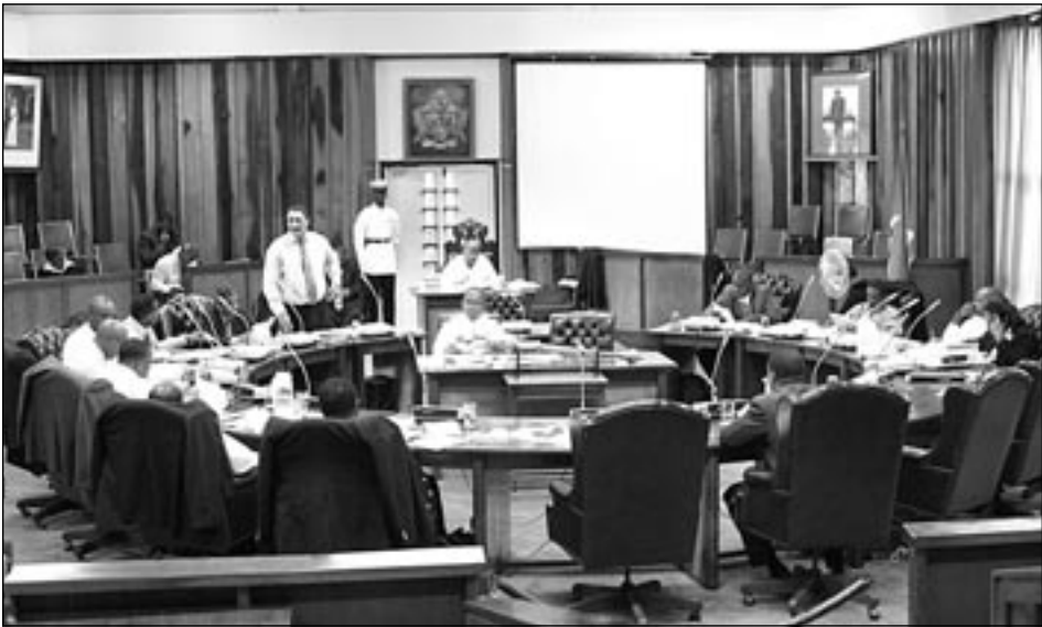
Preparing citizens for a new Parliament - a priority for 2006

Much of the permanent improvement works at the Beausejour Cricket Ground will also be completed within the first half of this year. Persons attending matches at Beausejour this year will notice an even faster draining outfield, due to comprehensive drainage works, improved concession stands, a new President's Box, and a permanent Venue Operations Centre, among other features. However, the feature that will bring even more pride to Saint Lucians will be