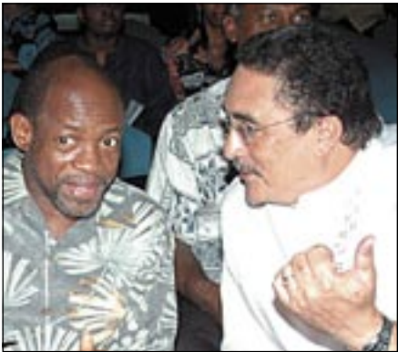
OECS celebrates 25 years of unity - page 7