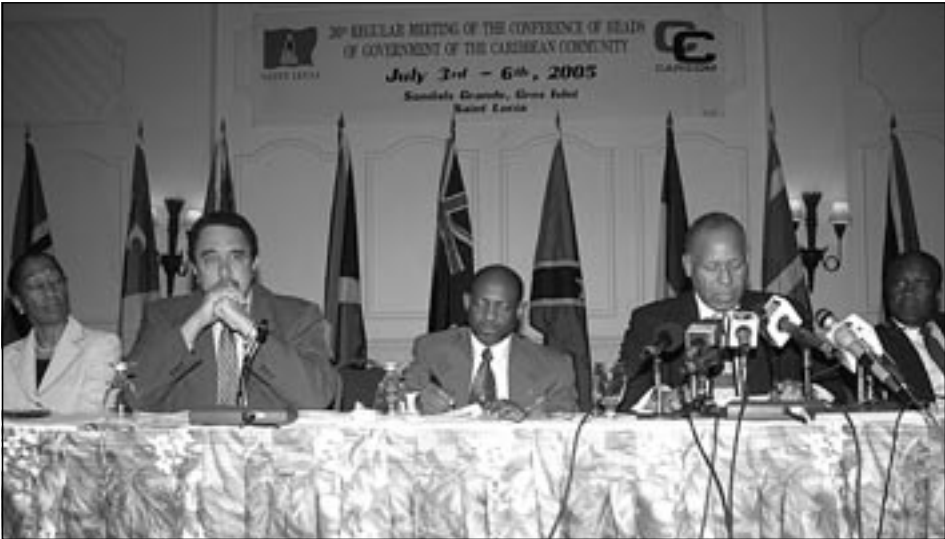
Major decisions ahead for CARICOM leaders

According to the St. Lucia Prime Minister: "It is not easy to understand why the average driver in the Eastern Caribbean must pay between $10 and $11 per gallon of gas, when it only costs about $5 or $6 in Trinidad & Tobago – especially in the context of a Single Market and Economy, where there is a general expectation of equality of treatment across the region." Dr Anthony was of the view that "Trinidad & Tobago must do some very serious thinking." He said: "They cannot have their cake and eat it. They cannot have a captive market and not reach out to help them in their hour of need. It simply will not do."