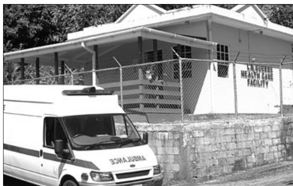
The La Guerre Health Post

Under the 2nd World Bank Disaster Mitigation project a number of small