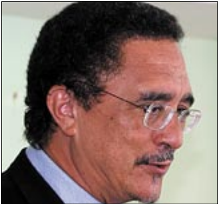
Exciting times and moments of decision - pages 4, 5 & 6