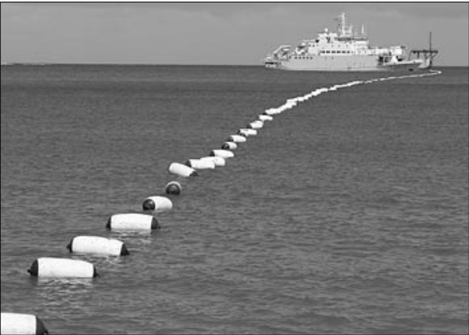
The boat used in the laying of the fibre cable to St. Lucia