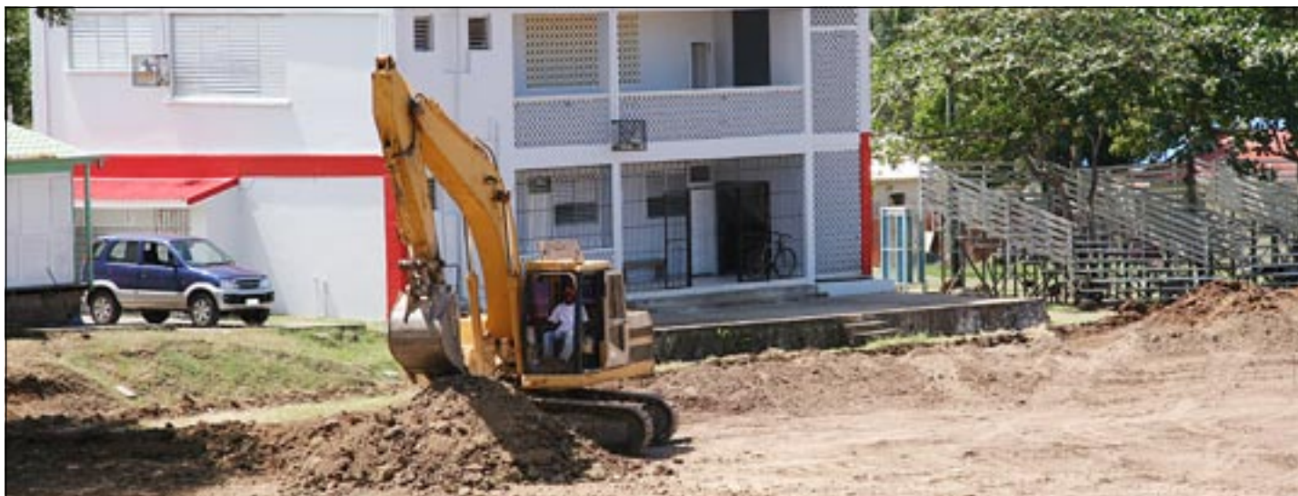
Work on the Gros Islet Playing field which is going to be a practice venue for CWC 2007

The Gros Islet LAT view their community as multi-faceted with its quaint country appeal while enjoying its reputation of the best "Friday Night Party" town. What is clear however, is the brand "Gros Islet" has been established and has a special and significant meaning to both locals and visitors alike. Today, Gros Islet is recommended as the "must visit" place for first time visitors to Saint Lucia, and, the Gros Islet LAT intends to continue this promotion as Saint Lucia prepares to host the "Best Cricket World Cup Ever!"