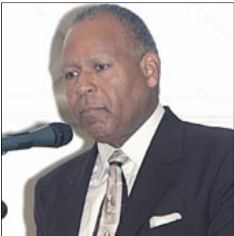
Caricom Condemns Radio Active Waste Shipment - page 6