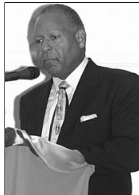
Chairman of Caricom, Prime Minister Manning of Trinidad & Tobago

On behalf of the Governments and people of the Caribbean Community, I strongly urge those countries which ship or transship high-level radioactive waste through the Caribbean Sea to desist from so doing in the interest of the environmental safety and integrity of an already fragile regional eco-system and ultimately the security of the Caribbean population.