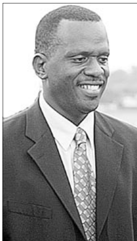
Hon Philip J. Pierre

S aint Lucia is indeed proud to be associated with World Consumer Rights Day. The transformation of the Price Control Division into a full-fledged Consumer Affairs Department in 1997 paved the way for becoming part of the Universal Family of the Consumer Movement spearheaded by Consumers International.