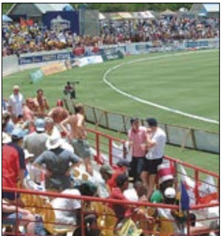
One Year Countdown to Cricket World Cup 2007 - page 7