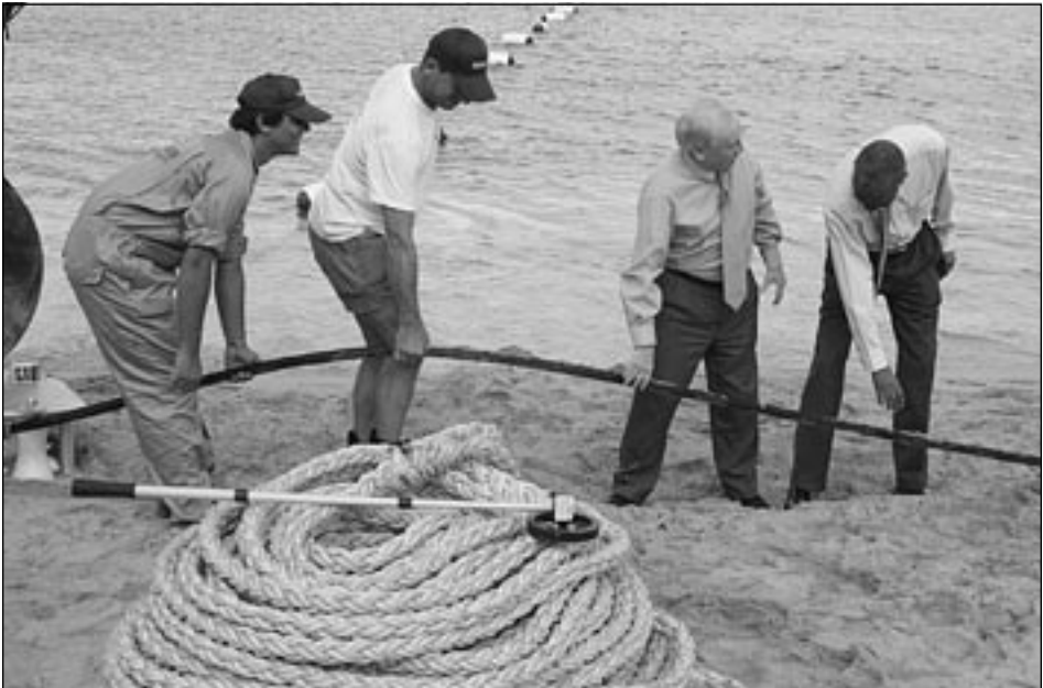
Officials of Antilles Crossing and Minister Finisterre pulling in the cable (left) and in discussion (right)

Now that Antilles Crossing has brought their new fibre cable to St. Lucian shores, their task now is to take it inland and connect St. Lucian consumers to the system either through installing their own domestic fibre network or reaching an agreement with the owners of an existing network in the country. Negotiations are presently underway with one local company in order to achieve the latter.