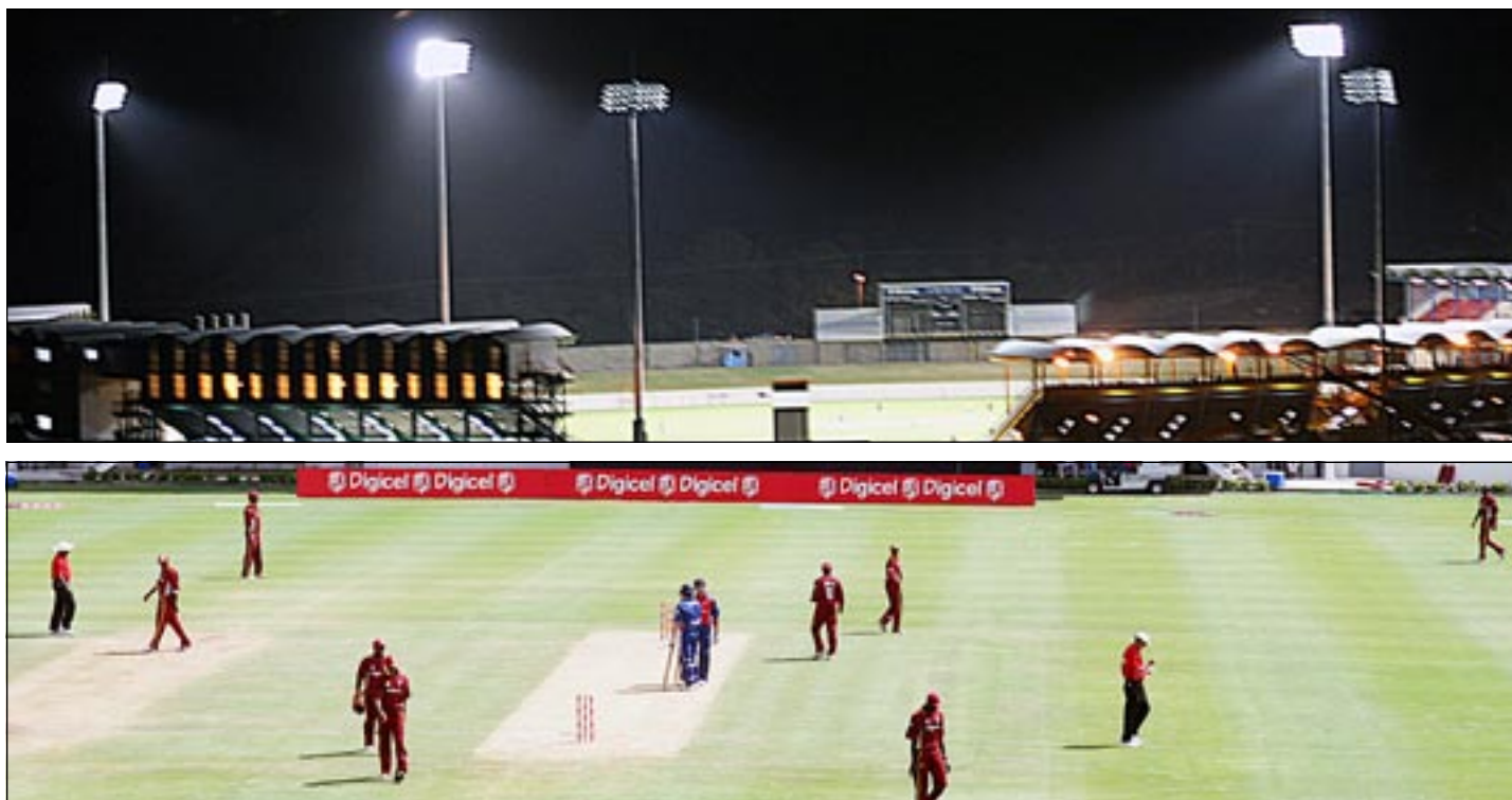
The floodlights at Beausejour (top) and West Indies A in the field against England A in one of the recent day/night matches at Beausejour

T he latest addition to the amenities at the Beausejour Cricket Ground - the lights for night cricket- has passed its initial test.