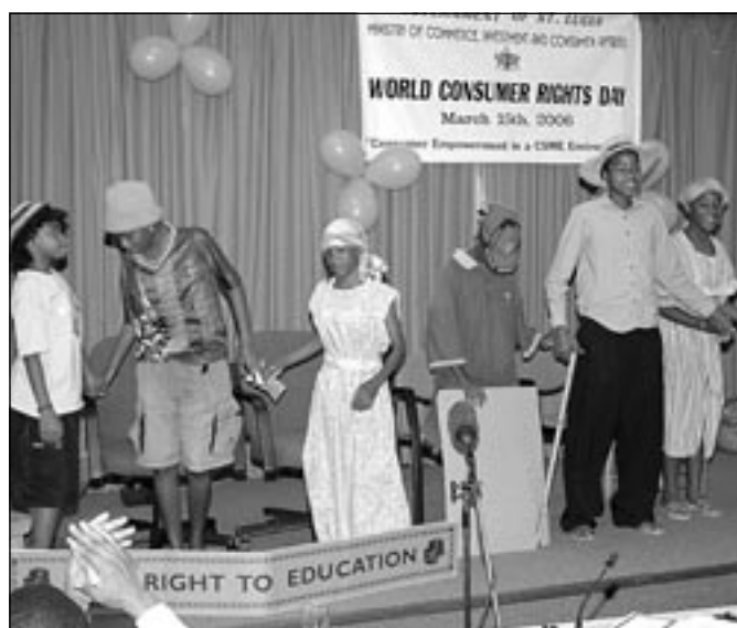
Students dramatising the eight Consumer Rights

be equipped to train others on consumer protection matters.