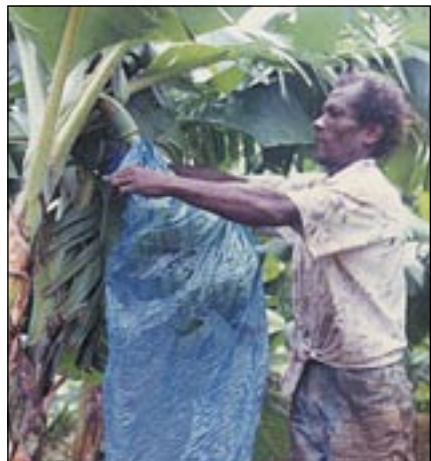
Social Recovery Programme for Banana Farmers - page 2