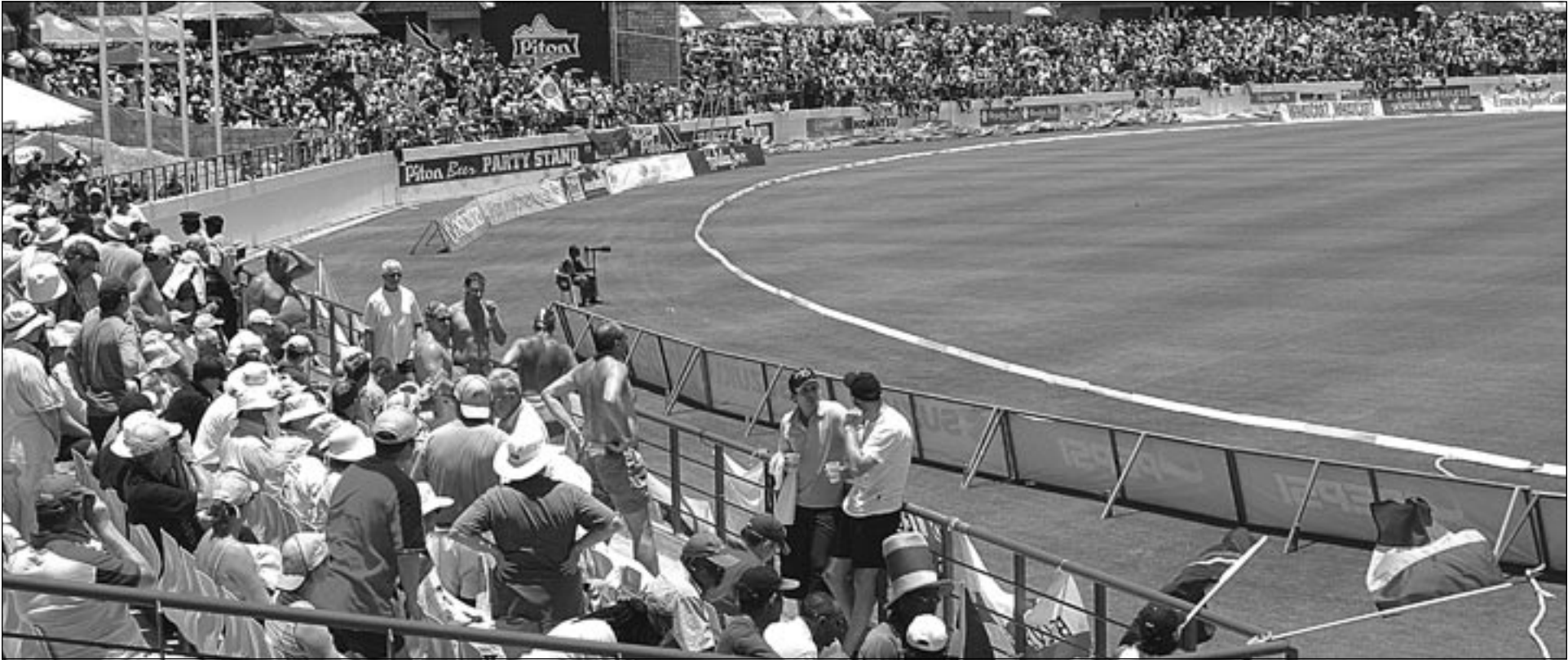
A section of the Beausejour Cricket Ground during a West Indies England one day match last year

T he one year countdown for the island’s hosting of matches in the 2007 ICC Cricket World Cup is on.