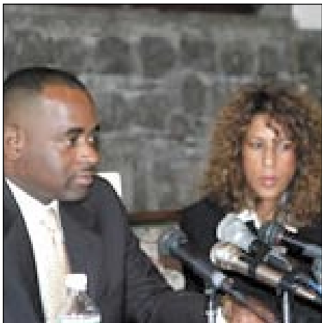
OECS 25th Anniversary Media Launch in Dominica - page 6