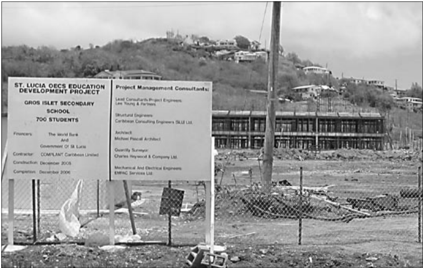
Construction of the Gros Islet Secondary School

HOMEWORK AND STUDY MAY NO LONGER MATTER BECAUSE IT IS BELIEVED THAT A PLACE WILL BE AVAILABLE IN A SECONDARY SCHOOL FOR EVERY CHILD. WE HAVE TO DISCOURAGE THIS THINKING BECAUSE UNIVERSAL SECONDARY EDUCATION CANNOT BE ABOUT UNDER-ACHIEVEMENT. PARENTS MUST CONTINUE TO INSPIRE THEIR CHILDREN TO HELP THEM REALISE THEIR GIFTS AND POTENTIAL.