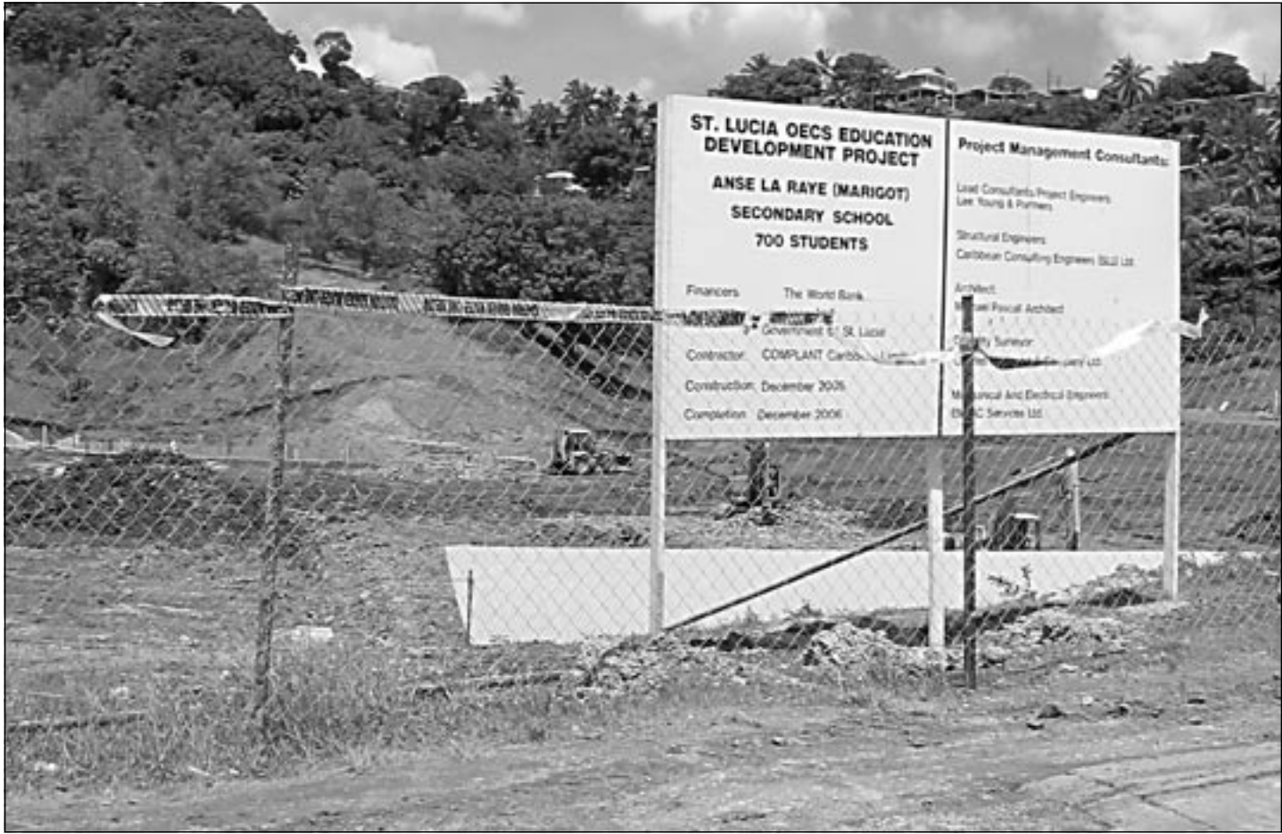
Construction work on the Marigot Secondary School

Until next week, may God bless our teachers and our students; and, of course, may the Good Lord bless and keep you, till we speak again.