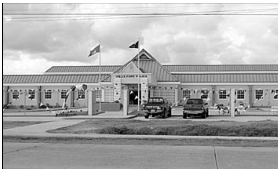
The new Vieux Fort Police station

Meanwhile, three brand new fire stations have already been constructed at Gros Islet, Vieux Fort and Dennery.