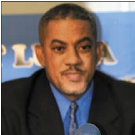
Acting AG Explains Withdrawal of Lawyer from Register - page 3