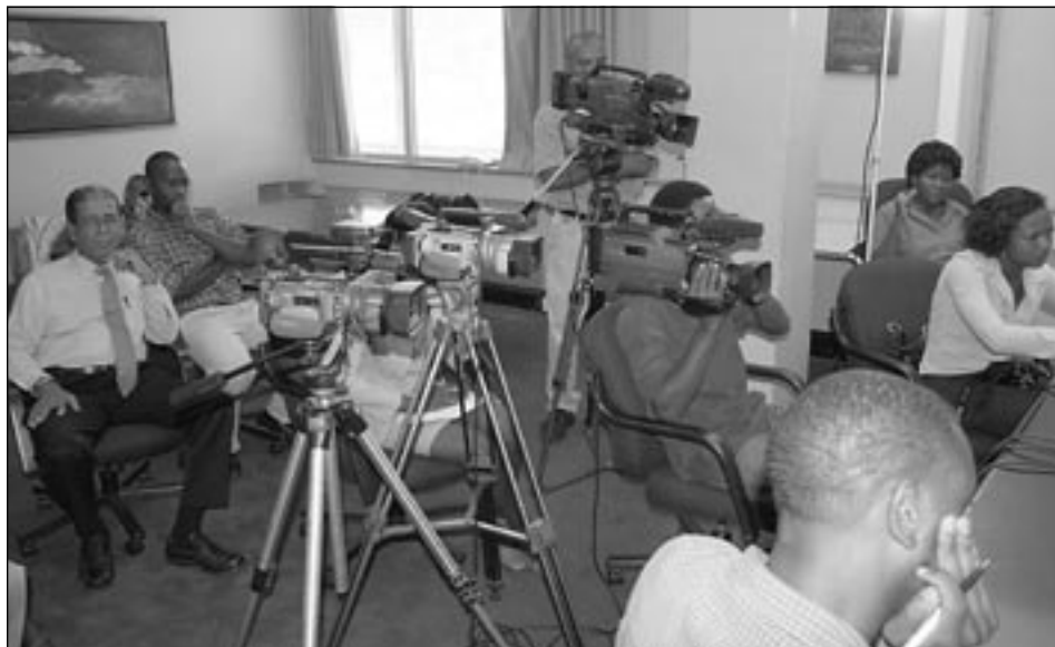
Media personnel at the Press Conference