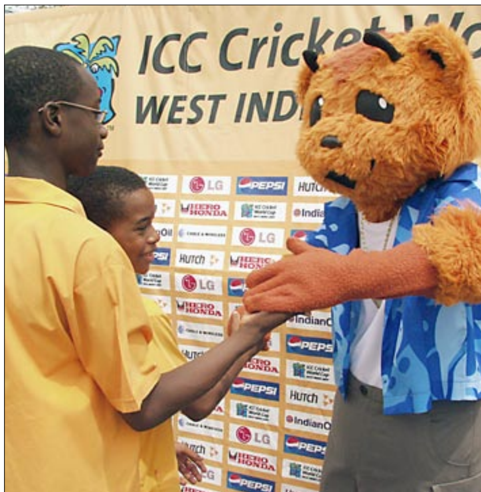
Mello meeting school children at the George Charles Airport, Vigie.

T he ICC Cricket World Cup 2007 mascot MELLO arrived in Saint Lucia to crowds of children at the George FL Charles airport on Friday 7th April.