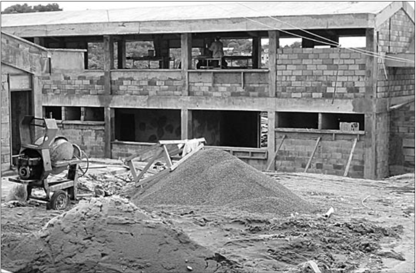
When the Ciceron Secondary school was under construction