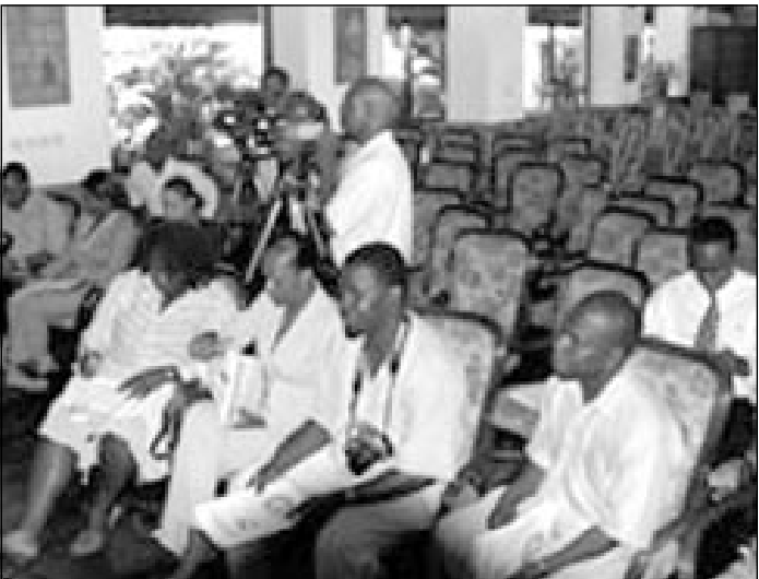
Section of the Dominica Media at the Media Launch

The journalists heard about plans to launch an OECS Economic Union Treaty to further deepen the integration of the region. They heard of plans for an OECS flag and new logo and the plans for a major development conference. They all left with one of the attractive media kits. The three Television Stations represented received