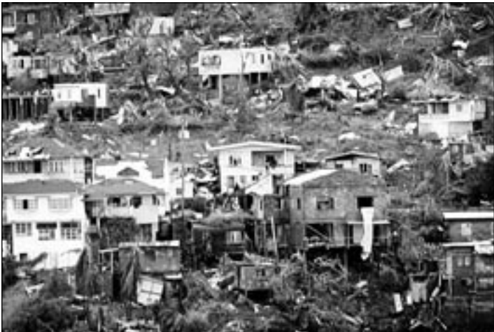
Scenes from natural disasters in the region: Above: St. Lucia: Flooding in Castries and collapsing earth at Tapion. Bottom: Grenada: Damaged houses after Hurricane Ivan