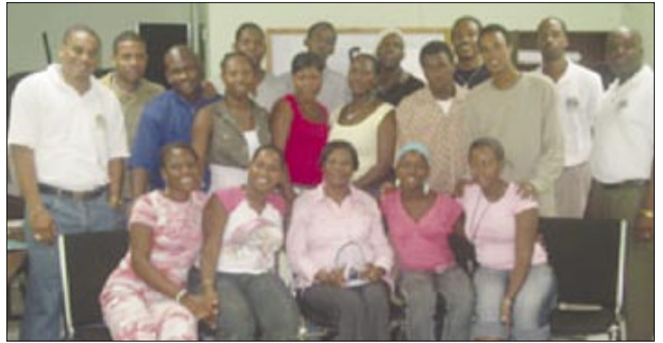
BELFund beneficiaries pose at the end of the first phase of their entrepreneurial training

participants are expected to produce a Business Plan for their enterprise to be submitted to the BELfund for approval, a topic which is covered in the training.