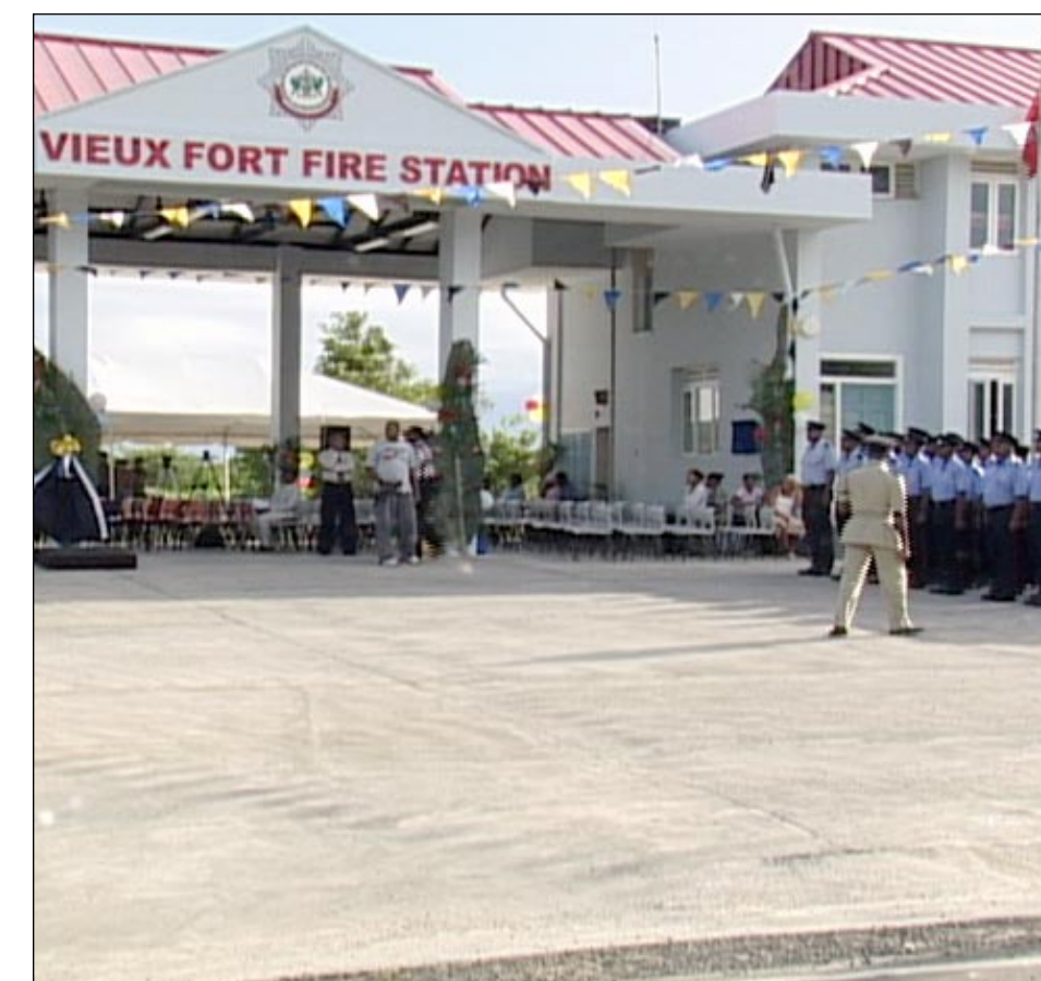
The recently built Gros Islet (left) and Vieux Fort Fire Stations