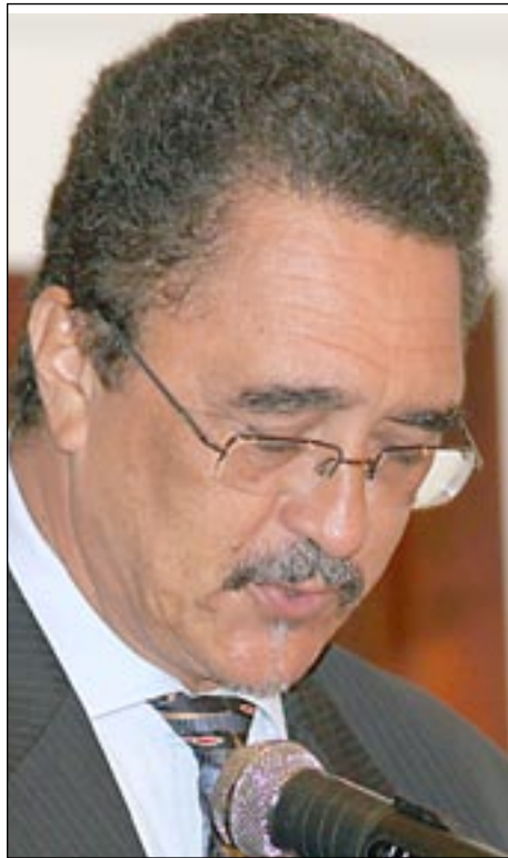
Prime Minister Anthony addressing the St. Lucia Employers' Federation

Addressing the forty-fifth annual general meeting of the Saint Lucia Employer Federation, at the Sandals Grande Monday 9th October, the Prime Minister said the Labour Code is coming on the heels of several government initiatives designed to strengthen rela-