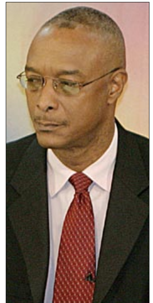
Hon. Felix Finisterre

The Minister went on to say that "it has not been easy to modernize that sector."