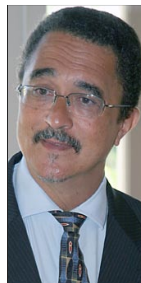
Prime Minister Anthony

The Prime Minister also advised the representatives of the fire officers that he had instructed the Ministry of Home Affairs to seek quotes from the Private Sector to replace the roof of the building housing the Central Fire Station on Jeremie Street in Castries. He advised, however, that the removal of the roof is