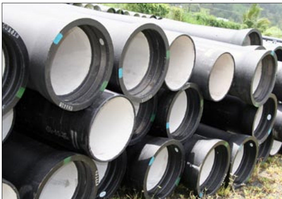
Some of the new 20 inch pipes being used in the water sector modernization programme

The Government's water sector reform projects are being financed through the World Bank.