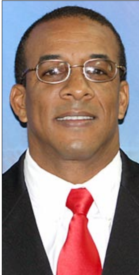
Hon. Ignatius Jean

Under the new law, it will also be unlawful for individuals to buy stolen agricultural produce and it will allow the police to pursue and search the premises of persons suspected of concealing or lodging stolen produce.