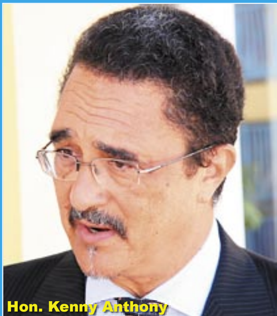
Hon. Kenny Anthony