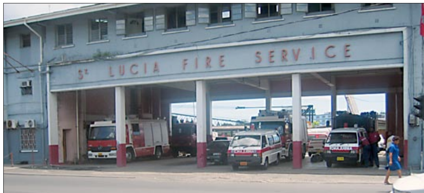
Castries Central Fire Station

O n Friday at 2.00 p.m. the Fire Services Welfare Association requested a meeting with the Ministry of Home Affairs and Internal Security.