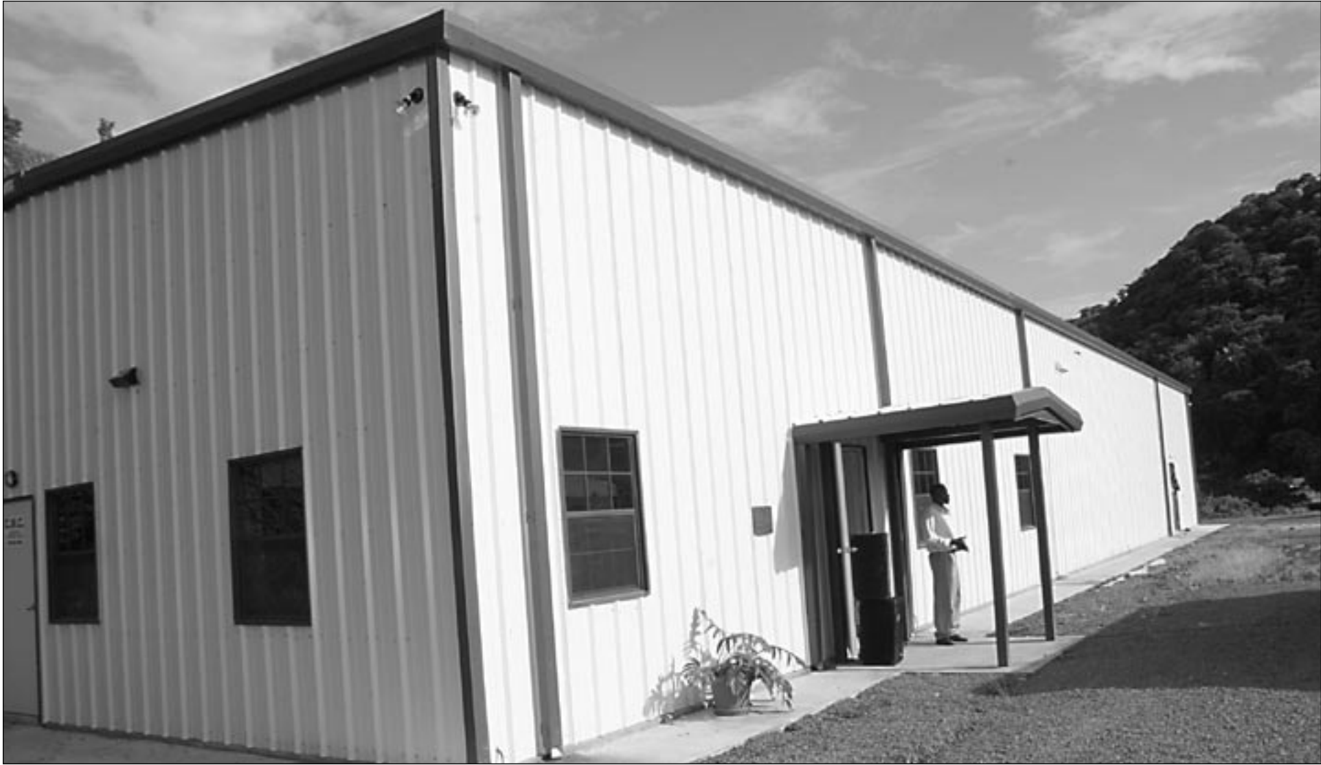
The new NEMO Headquarters