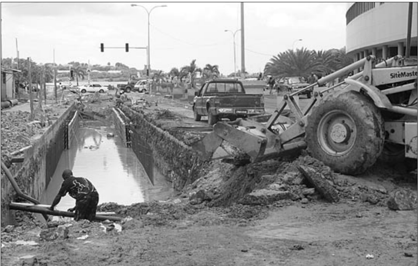
Work on Jn. Baptiste Street

“The original plan or the plan was to approach this in a manner that was just suggested, which was to take a part of the project do it, complete it and then move over. There are three main road arteries