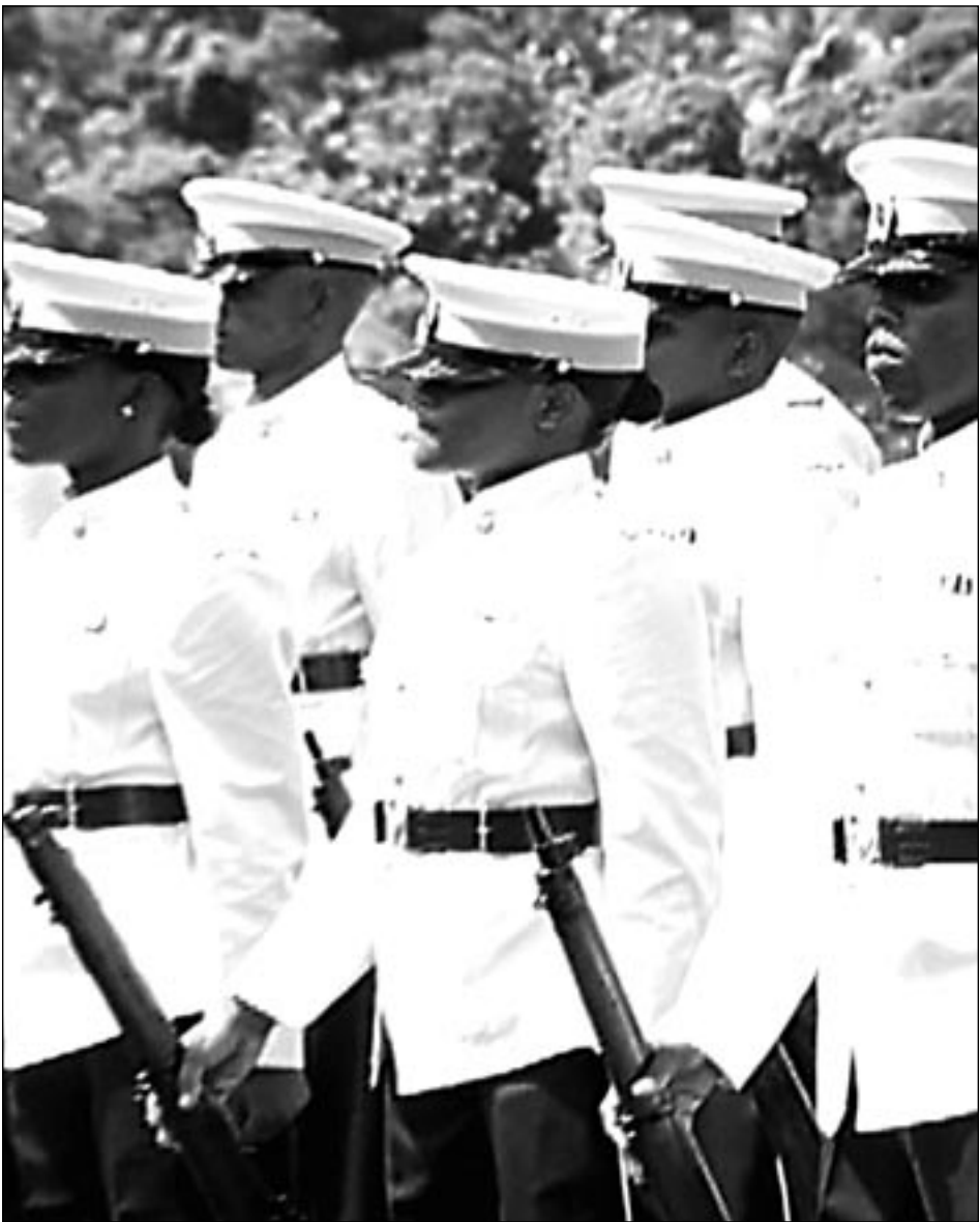
Some of the graduating officers