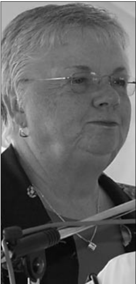
US Ambassdor Mary Kramer

New barracks for the Special Services Unit of the Royal Saint Lucia Police Force (SSU) in Vieux Fort was handed over Thursday morning by the Government of the United States of America to the Government of Saint Lucia. The construction of new barracks has been described as phase two of the development of the compound which also houses the Marine Police Unit. Top police officials say this physical integration of