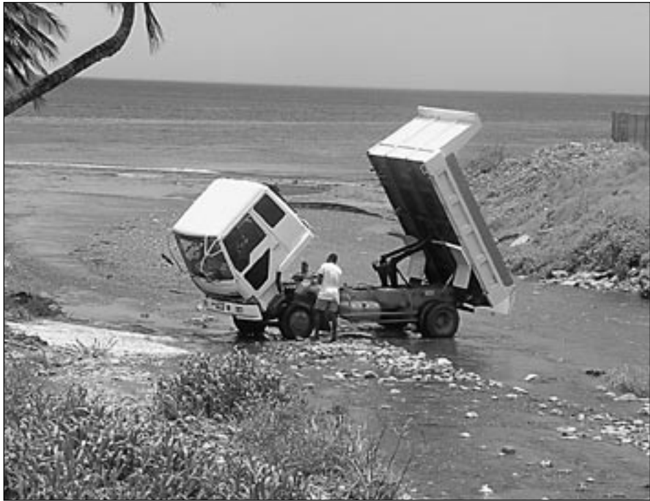
Truck being washed in a river