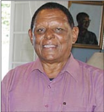
No Worries About Cuban Nursing Programme - page 2