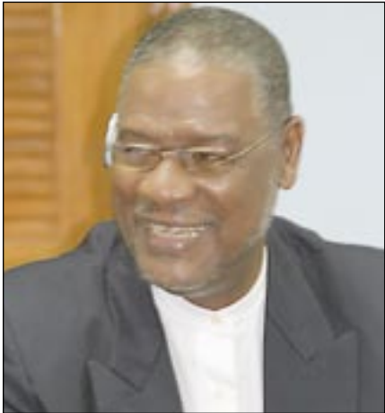
OECS Studies Impact of EPA – Page 7