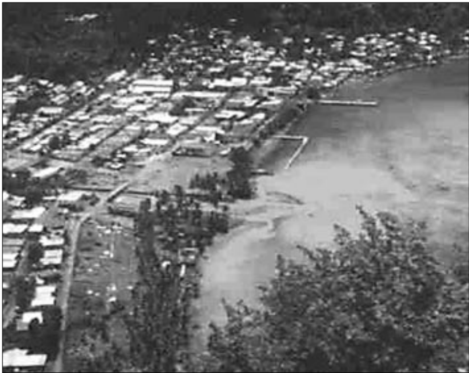
Sediment Plume in a Bay