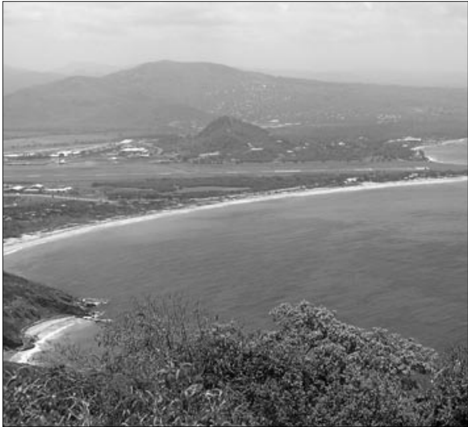
Vieux Fort Bay

A United Nations conference, hosted last week by the Government of St. Lucia, through its Ministry of Physical Development, Environment and Housing, has brought to the attention of decision makers in the member states of the OECS the importance of monitoring the marine water quality in the region. The Conference actually consisted of two workshops, one of which dealt with the issue of marine water quality and also highlighted the effects of poor water quality on human health, fisheries and tourism. The other workshop focused on the importance of the Protocol Concerning Pollution from land based sources and activities (LBS) and National Programmes of Action (NPAs) as tools for improving environmental management. The conference was organized by the Caribbean Environment Programme of UNEP (the United Nations Environment Programme) and ongoing projects in the region by UNEP and other partners which support the implementation of National Environment Management Strategies (NEMS) in OECS countries were also examined. The Conference aimed at generating high-level government commitment to address marine water quality issues, pollution reduction and prevention measures through ratification or accession and implementation of the LBS Protocol. The following are extracts of some of the discussions at the Conference and a summary of the conclusions of the Marine Water Quality Workshop.