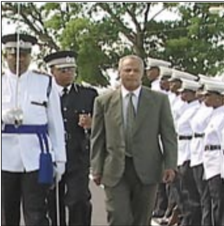
Police Force Gets New Barracks, New Officers – Page 3