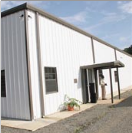
New Nemo Headquarters – Page 6