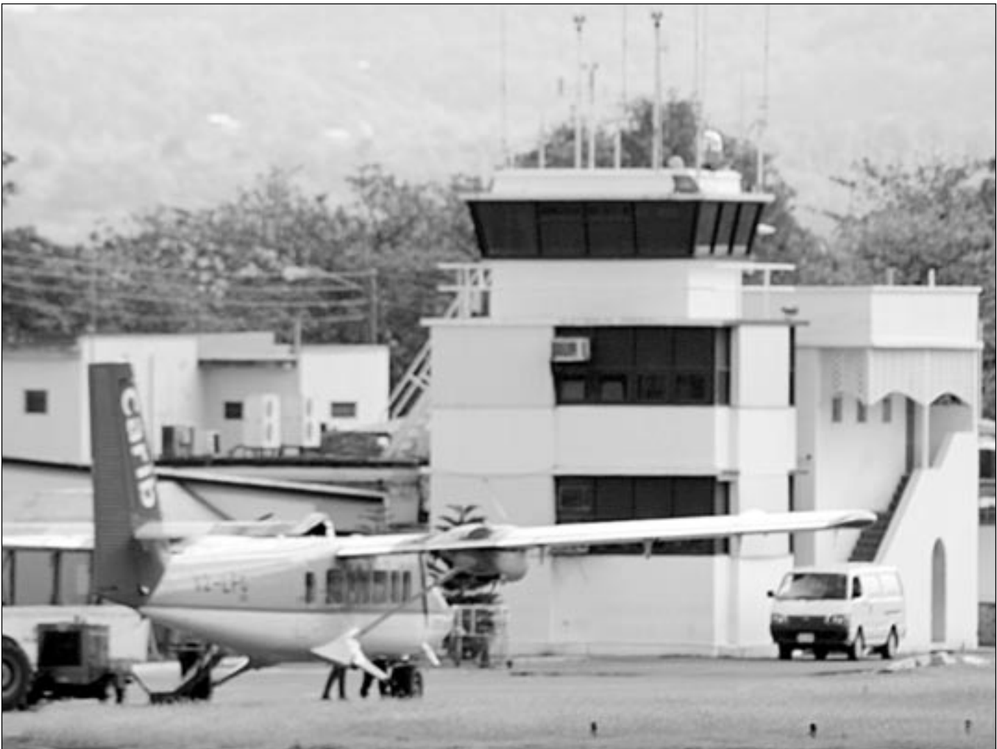
The control tower at George F L Charles Airport

“Without radar most times air traffic controllers have to rely on pilots giving their positions and often times it can be difficult for the air-traffic controller to fully understand where everyone is at one point in time. They try their best, but in this modern age, where there is technology like radar it should be a simple thing of looking at a screen and you can see where every aircraft is, know their speed, know their altitude, where they're heading without asking persons all the time, “please state your position !”