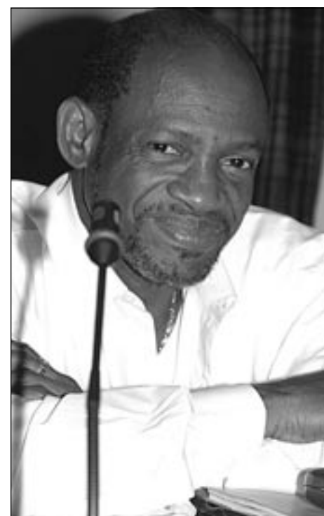
Hon. Dr. Denzil Douglas

During a press conference after his arrival in London on Sunday, Dr. Douglas used the opportunity to thank the British Government and specifically Prime Minister Tony Blair for the support that he has given and for especially using St. Kitts and Nevis as the country that has been singled out to have been most affected as a result of the changes in the sugar regime.