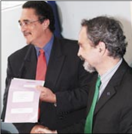
Financing Secured for New Hospital - pages 4 & 5