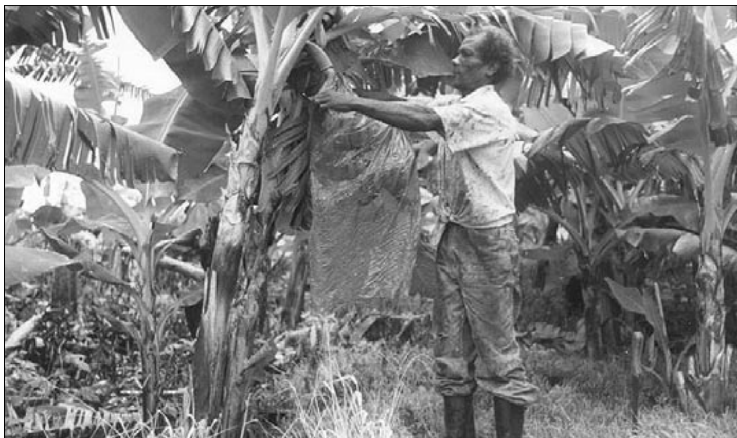
A Banana Farmer at work