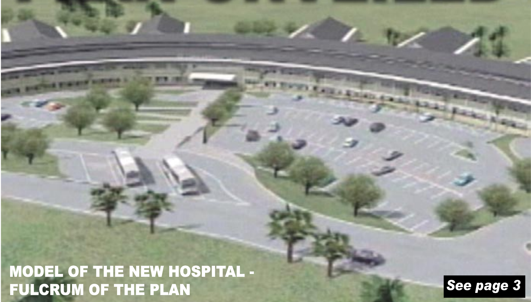
MODEL OF THE NEW HOSPITAL - FULCRUM OF THE PLAN