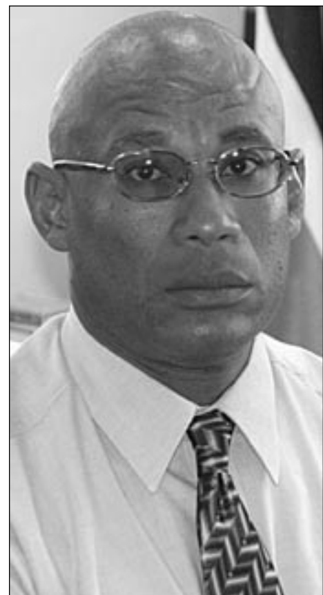
Hon. Damian Greaves Minister for Health, Human Services, Family Affairs and Gender Relations

Explaining that the Labour administration was "taking a comprehensive approach to the solution of the island's health problems," Mr Greaves says, "We aren't only talking, we are also doing."