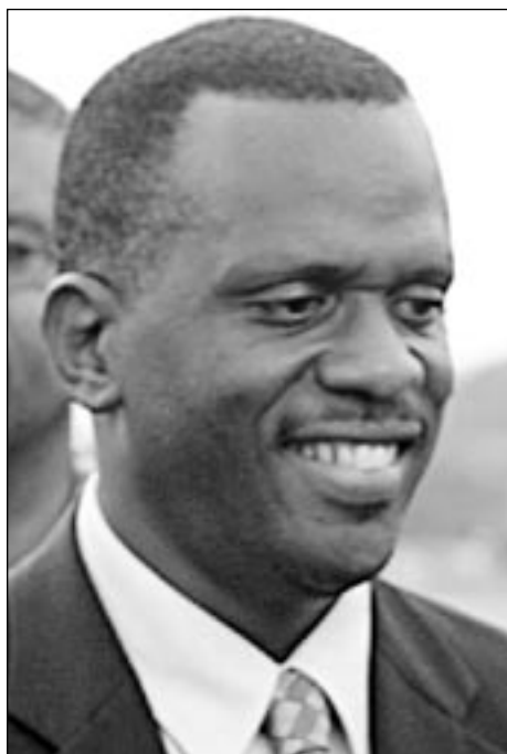
Minister of Tourism Phillip J Pierre

We are aware that Air Jamaica has re-focused and is well placed to continue its expansion to destinations in the Caribbean. We believe that this is a positive step since the Caribbean brand is in need of more airlift. A region operating as a single market must emphasize on the uniqueness of its product and the need for airlift is a prime condition for growth.