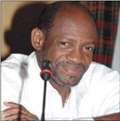
Caricom Mission to Europe for Sugar Talks - page 6