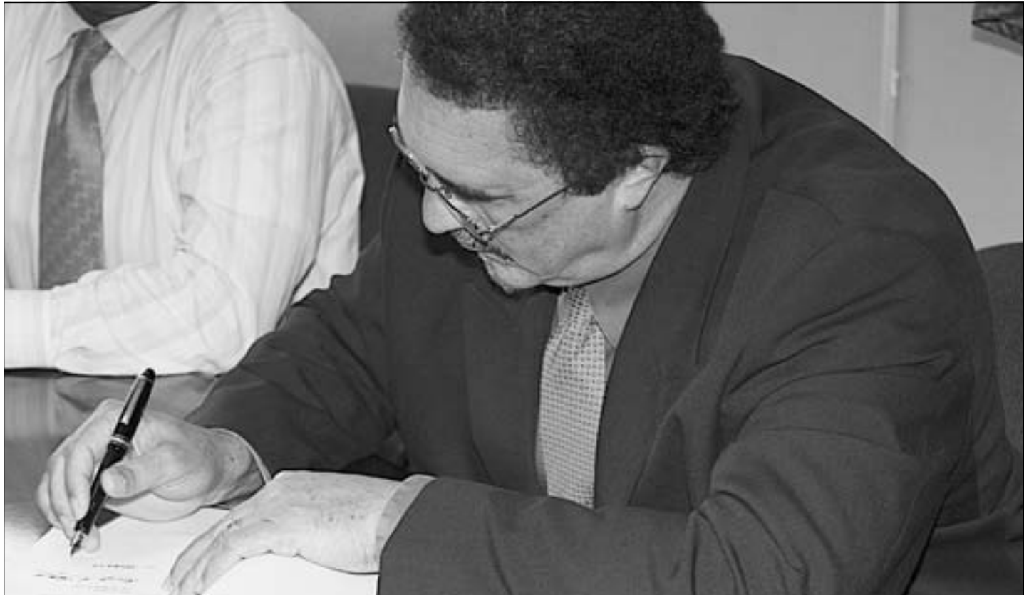
Prime Minister Dr. Kenny Anthony signing the Agreement on behalf of Saint Lucia

In conclusion, I take the opportunity to express the thanks and appreciation of the people of Saint Lucia to the European Union for their unstinting support over the years on this project of such developmental significance to us. This hospital will be an enduring monument of the support and friendship of the European union, and surely, the wisdom of the Government and people of St. Lucia.