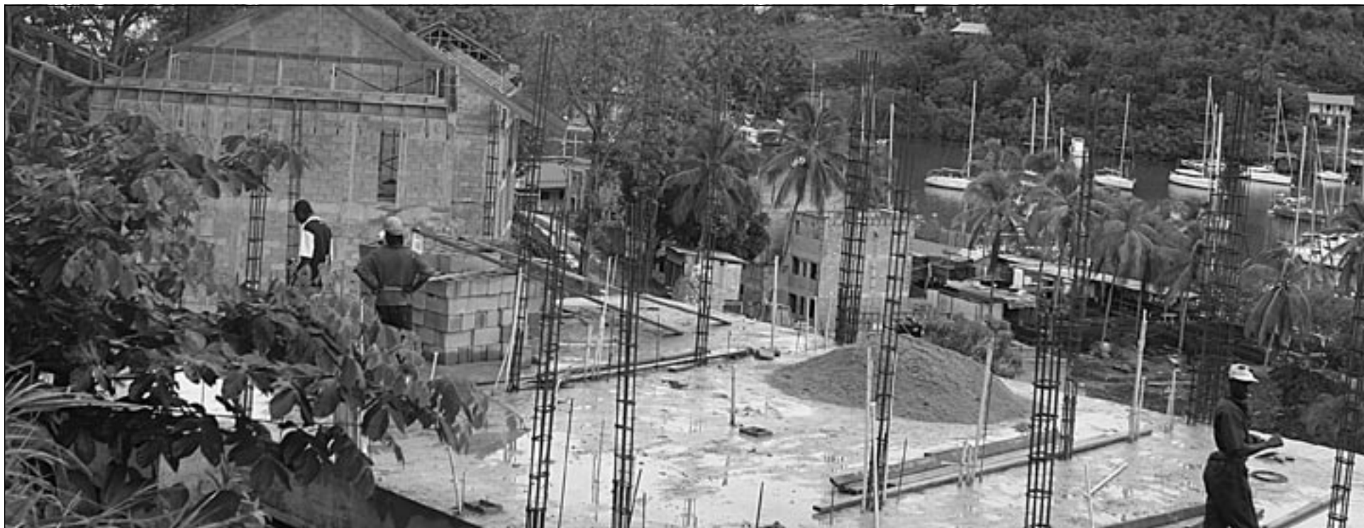
Construction Work at Discovery at Marigot Bay