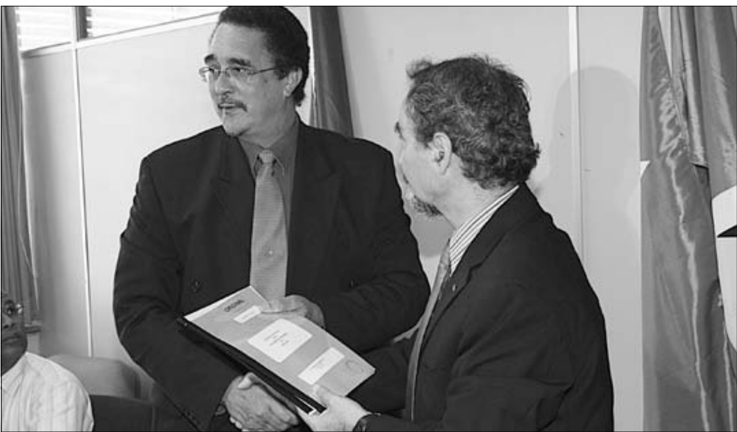
The Prime Minister and Ambassador Tincani exchange the signed documents

Project Objectives and Expected Results The long term objective of the project is to improve the overall quality and