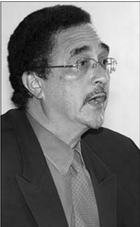
Prime Minister Dr. Kenny Anthony speaking at the Hospital Financing Agreement Signing ceremony

It has been a long, sometimes difficult journey since the Government of Saint Lucia opened the debate on the subject of the viability and prospects for sustainability and long term viability of the existing Victoria Hospital which is well in excess of one hundred years old. At least five 5 independent investigations were conducted on the prospects for the improvement of hos-