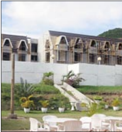
Exciting Times for Tourism - page 2