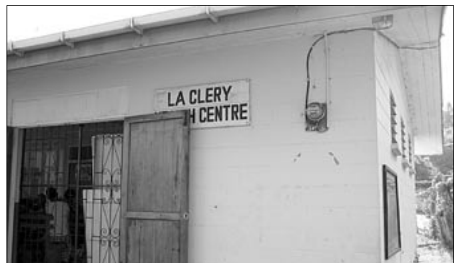
The La Clery Health Centre

T he Ministry of Health has allocated some $2.5 million towards the rehabilitation of 15 health centres around the island. This has been disclosed by Health Minister Damian Greaves.