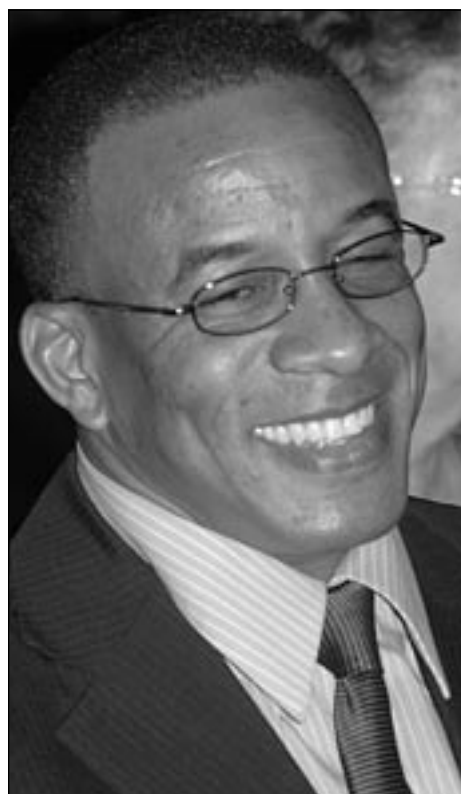
Hon. Ignatius Jean Minister for Agriculture, Forestry and Fisheries