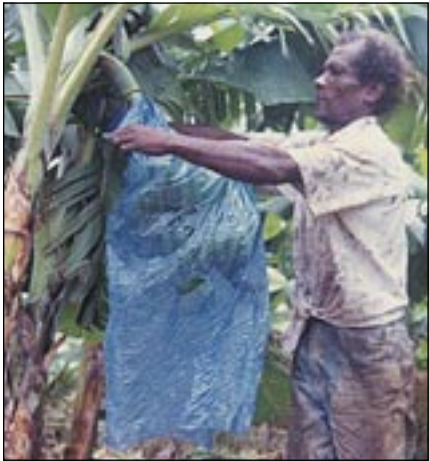
$20 Million for Banana Producers - page 7