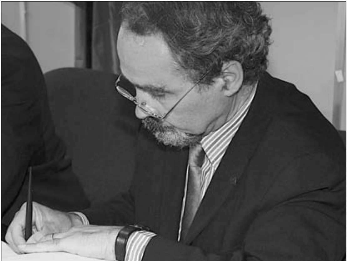
Ambassador Amos Tincani of the European Union signing for the EU