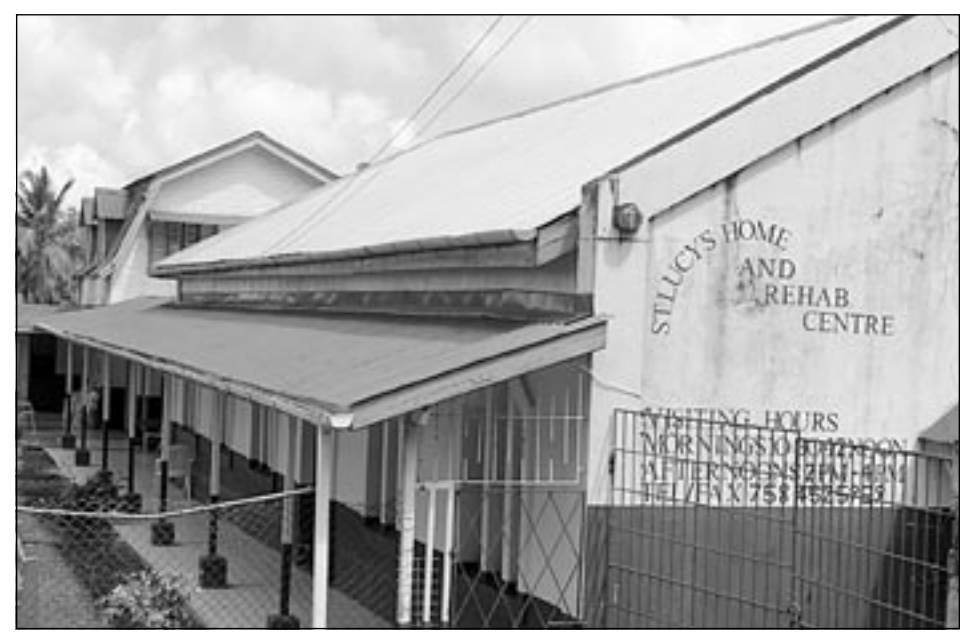
St. Lucy's Home

The cost of the new Senior Citizens' Home is estimated at approximately EC$ 13.5 million. In this financial year, a sum of $8.6 million is allocated for