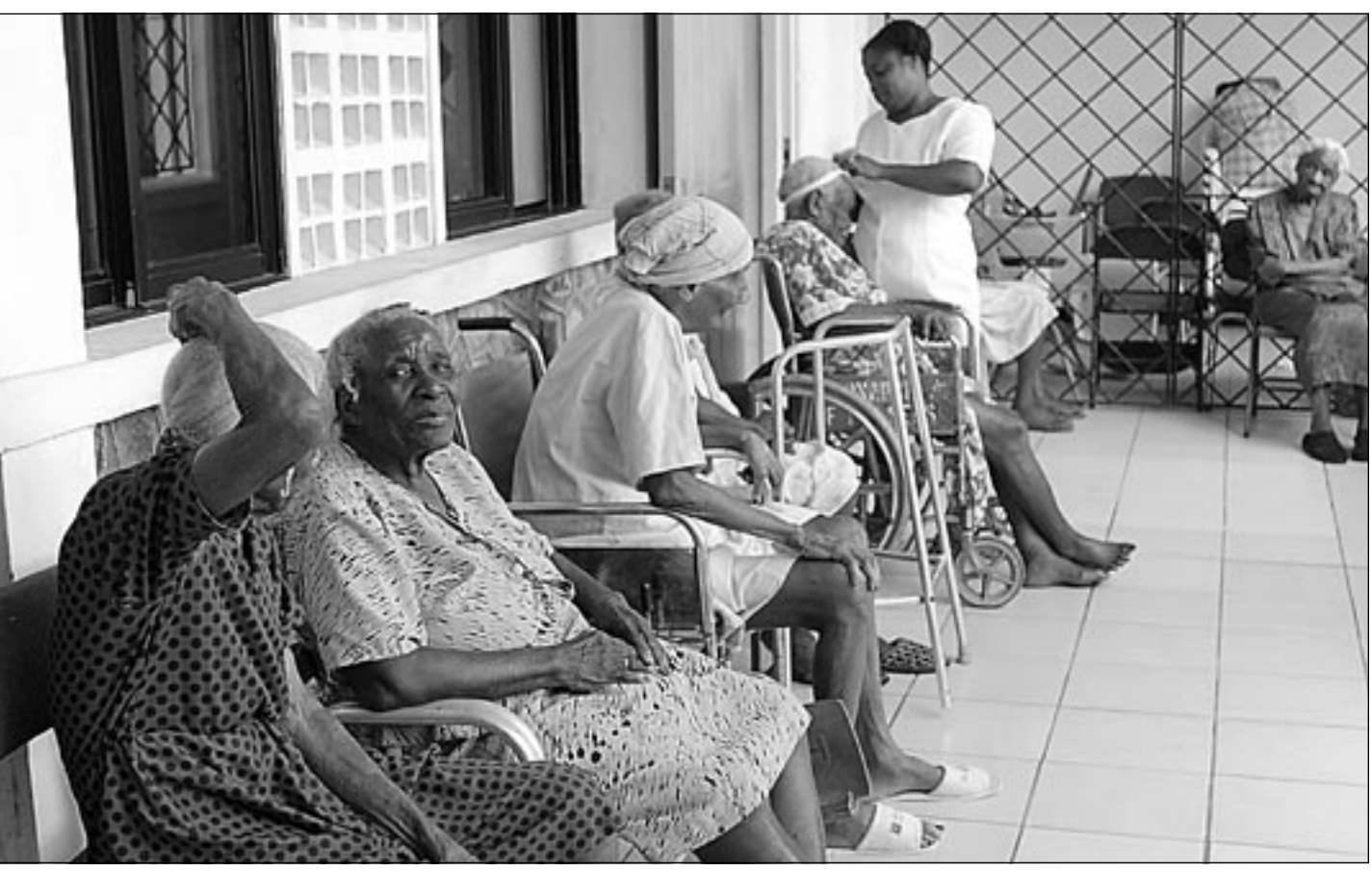
Senior citizens at one of the homes for the elderly

In order to satisfy itself that it obtained the best possible price for the land, the Government commissioned five valuations of the property, four of the commencement of construction. which came from the private sector. In The project is expected to be completthe end, the Government agreed to sell ed within two years.