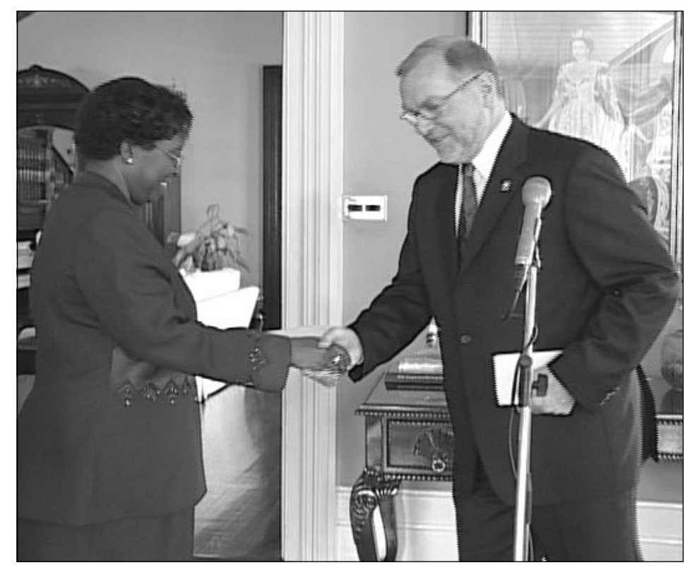
Dame Pearlette Louisy welcomes Ambassador Walter Suter

In establishing diplomatic relations with your country, we are mindful of your foreign policy objectives which embrace, among others, the peaceful co-existence of nations, respect for human rights, democracy and the rule