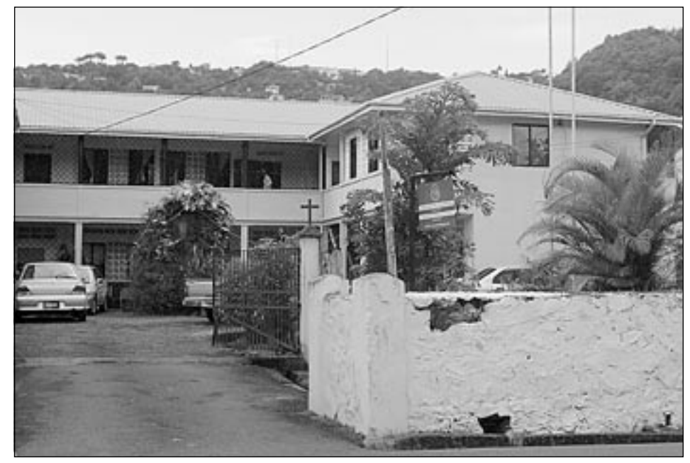
The privately run Marian Home

In this regard, I wish to commend the excellent work being undertaken by the Centre for Adolescent Renewal & Education or CARE as it is known. Mr. Speaker, on behalf of the Government of Saint Lucia, I wish to express