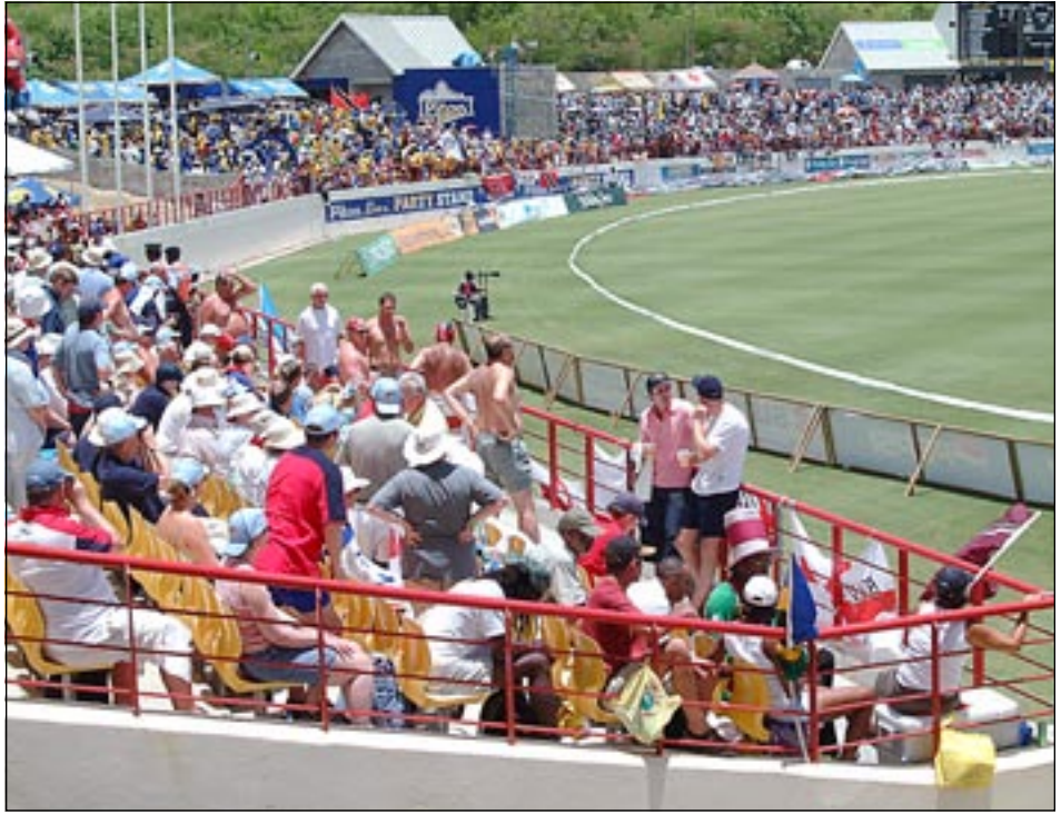
A section of the Beausejour Cricket Ground

Interestingly enough, the Test match comes at the end of the IX Venue Summit organised here by the Cricket World Cup West Indies to assess , with the International cricket Council, the state of readiness of the venues to be used for next year's World Cup as well as to evaluate the work being undertaken by the Local Organizing Committees in the territories hosting the games in CWC 2007. According to reports, St. Lucia's Beausejour Cricket Ground continues to receive high marks and so, it is on