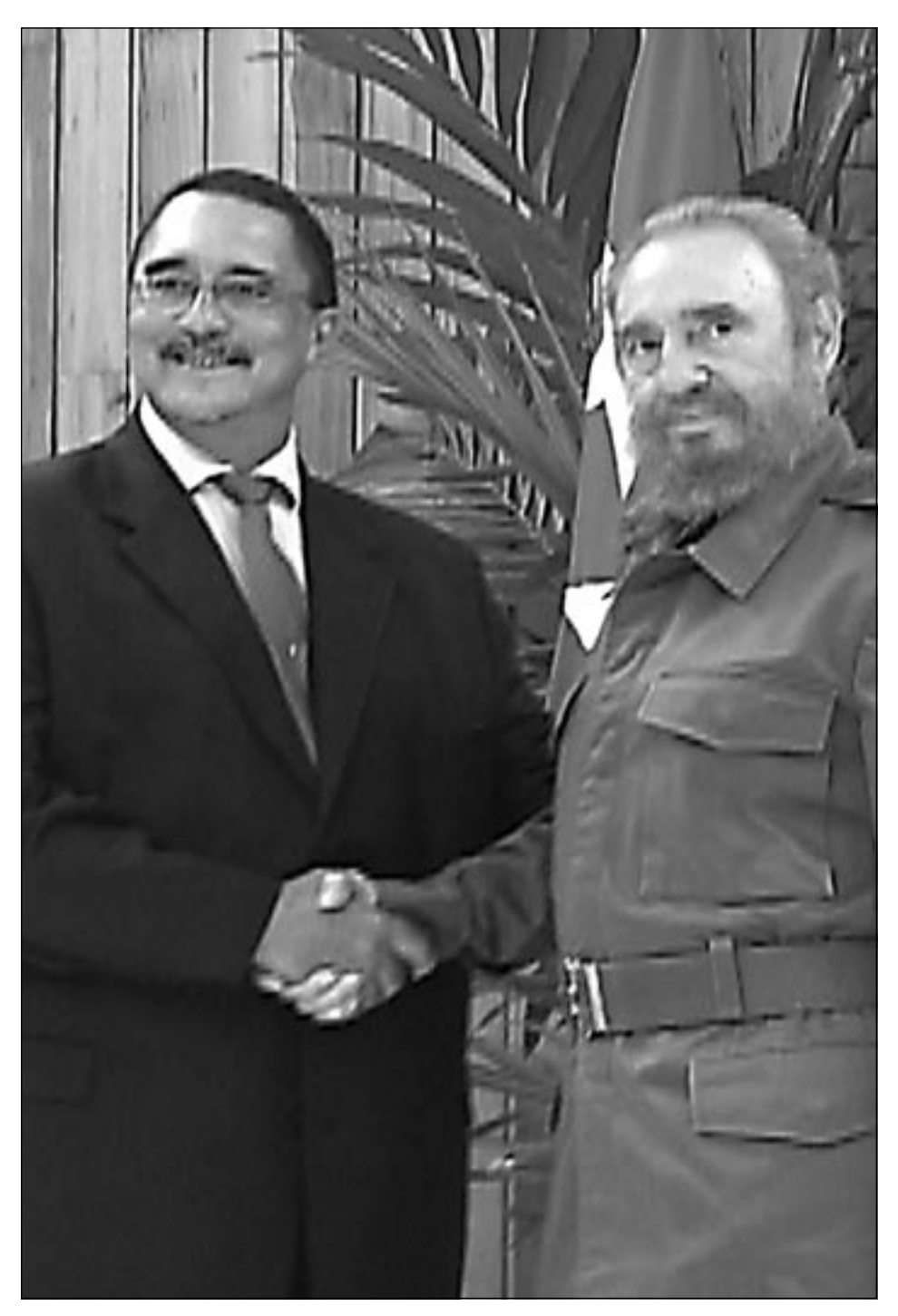
A PRESS BRIEFING