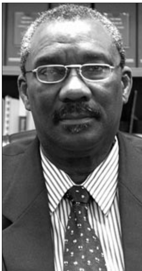
Senator Calixte George