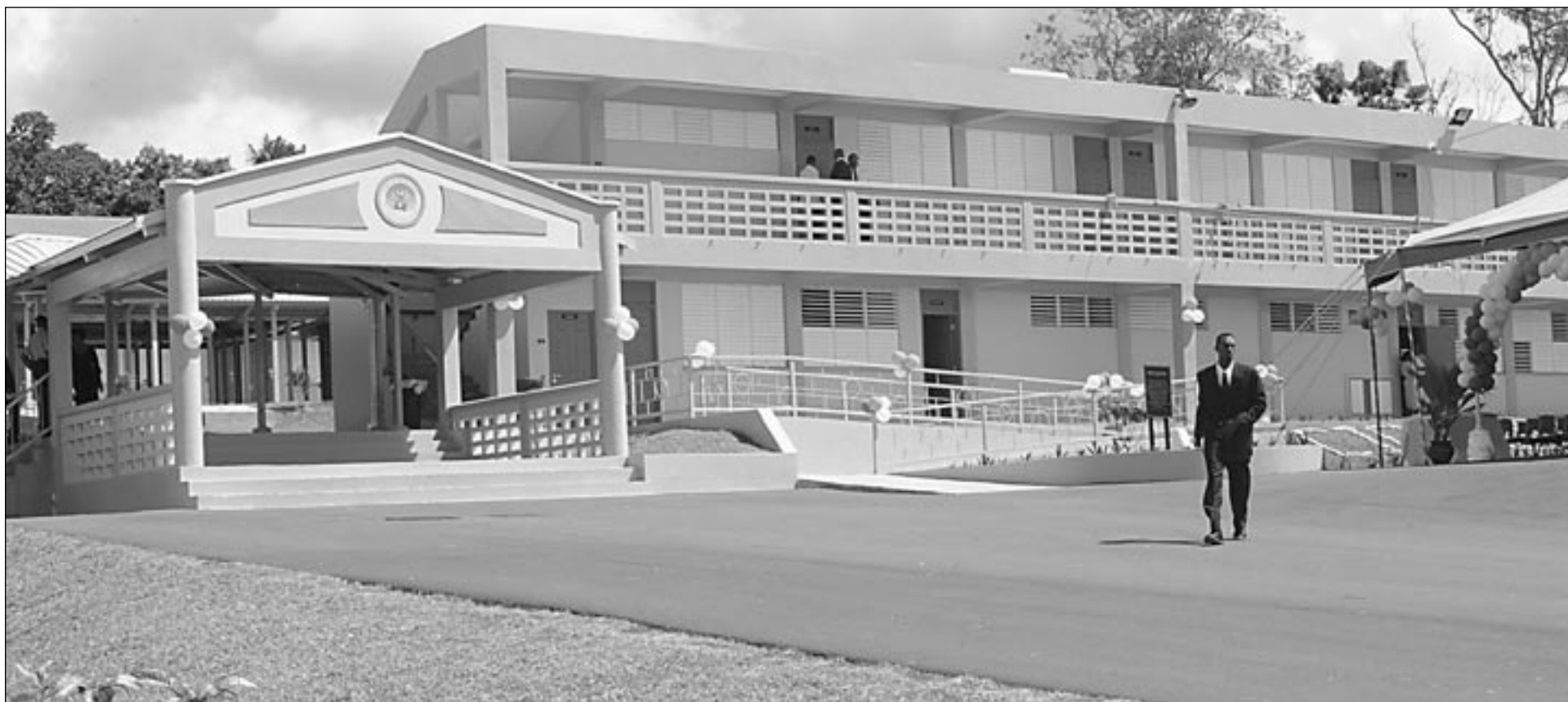
The Ciceron Secondary School one of the recently built Secondary Schools