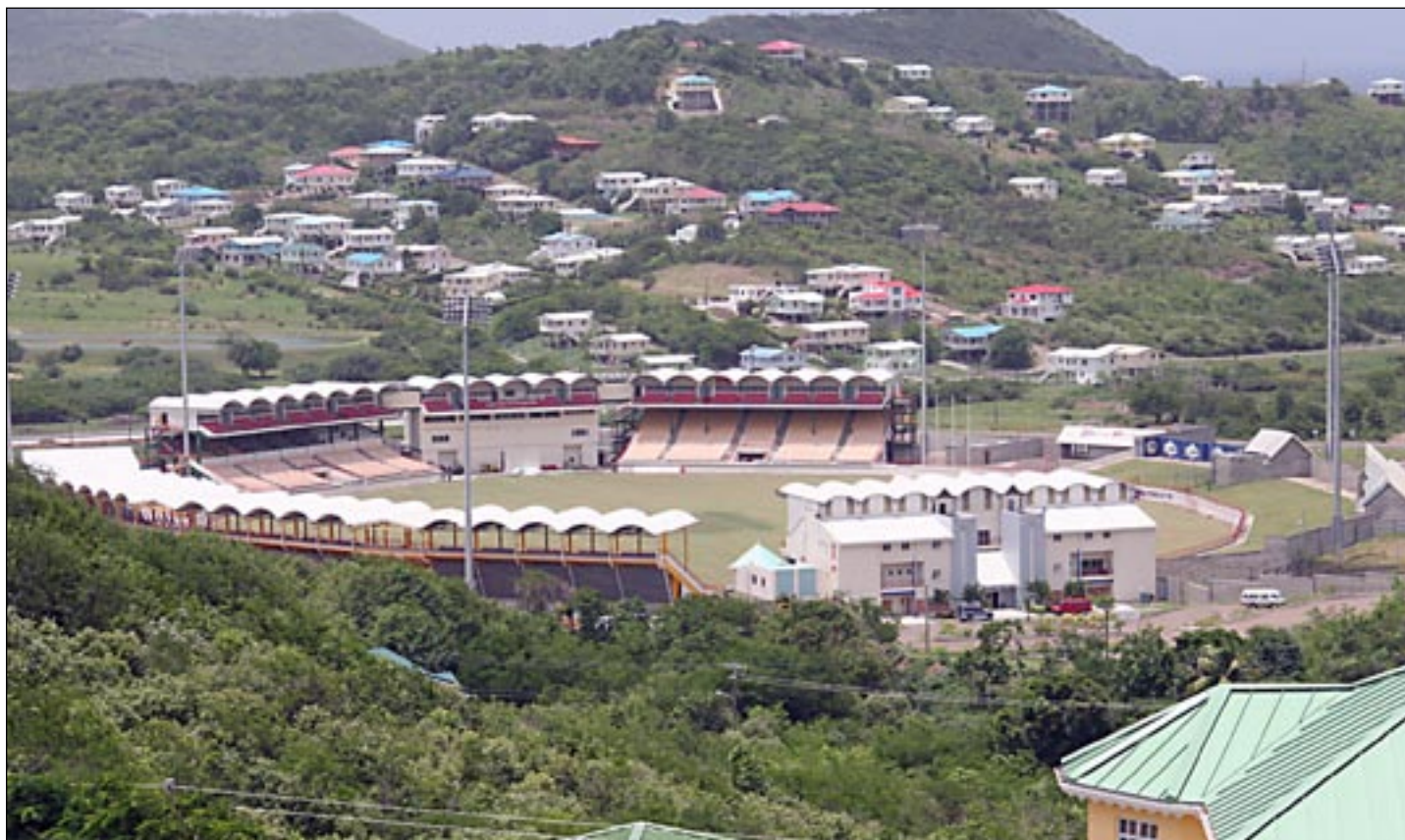
The Beausejour Cricket Ground

T ickets for the 2007 Cricket World Cup's second semi final match to be played at the Beausejour Cricket ground in St. Lucia are among the fastest sellers since the second Phase of Public Ticketing began last Friday. In fact, according to a statement from Cricket World Cup West Indies, "all Category 1 and 2 tickets – allocated for sale via Public Ticketing – for the second Semi-Final in Saint Lucia and Final in Barbados have been sold out. "These same categories have also been sold out for the "Super 8 match, A1 versus B1 in Grenada." These categories are the most expensive single match tickets, costing US $130 and US $90 respectively.