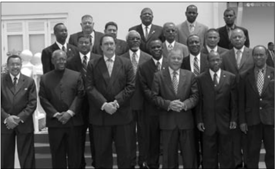
Heads of Government of CARICOM Countries