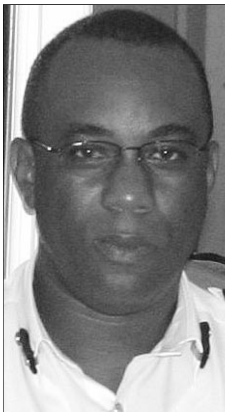
Commissioner of Police Ausbert Regis

M inister of Home Affairs and Internal Security, Senator Calixte George, announced last week that two new units are about to be established in the Royal Saint Lucia Police Force (RSLPF) to support ongoing efforts at fighting crime on the island.