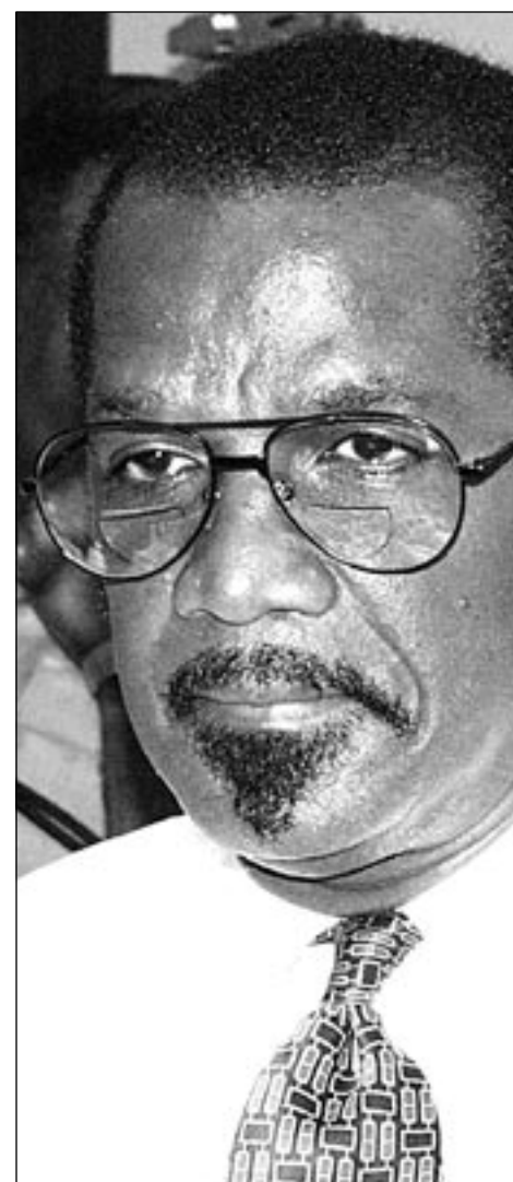
Hon. Velon John

The minister concluded: "We appeal once more for good faith and good sense to prevail, so that this historic process can be brought to its logical and final conclusion, within the parameters of the time frame dictated by the maximum degree of consensus that was sought and which has obviously been achieved through the aforementioned deliberations between the social partners and stakeholders."