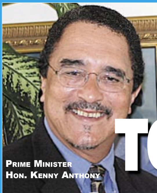
PRIME MINISTER HON. KENNY ANTHONY