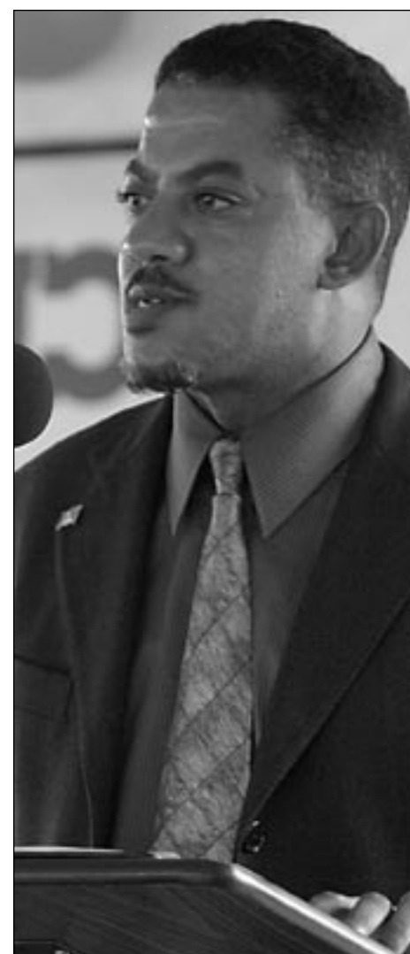
Hon. Mario Michel Minister for Education

It's now time for us to shift our focus to the development of a realistic agenda for the introduction of full Degree programmes as part of our local education offering. We look forward to sometime in the foreseeable future, when our children could also be afforded University Education as a right. Congratulations to Hon Mario Michel, members of staff of the Ministry of Education, Teachers and all others who have contributed to the achievement of this most enlightened vision."