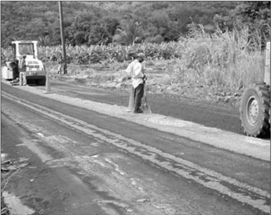
Work on the East Coast Road

there are certain areas that we think might be slightly problematic because there are soft areas caused by underground sources. That might take some more work than other areas along the route, but we are progressing on that.” The rehabilitation of the East Coast Road is part of a programme by Government to improve the the island’s road network . Since the completion of works under the Road Development Programme, ( RDP) road rehabilitation works have mainly been concentrated on the East Coast and the Castries/ Gros-Islet Highway with Communications Ministry officials ascribing equal importance to both.