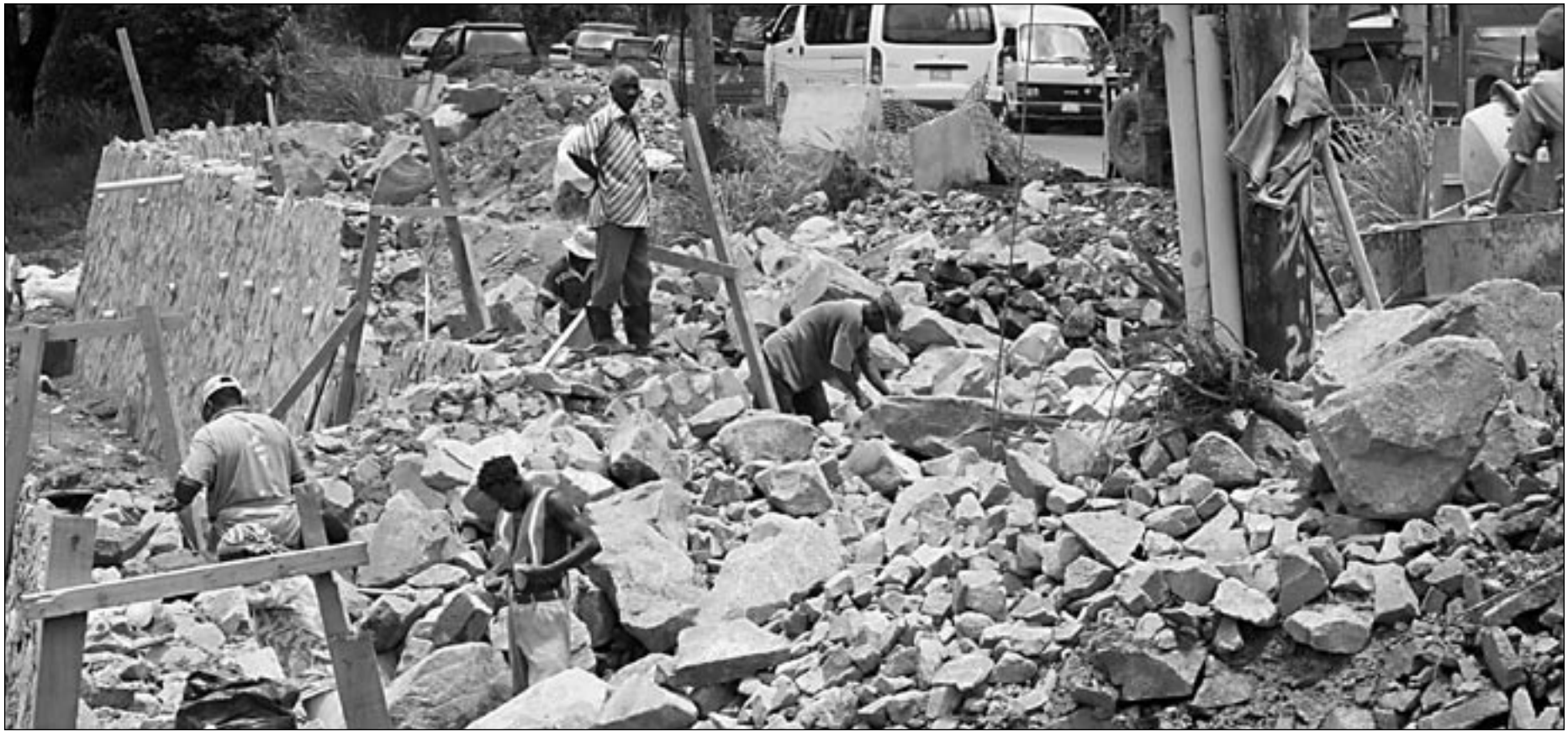
Work on a wall near the Castries Comprehensive School

For South-bound traffic from Gros-Islet, where there is no need to go into Castries, motorists are advised that they can divert through Corinth heading towards Balata or through Union heading to Balata, then on to Bocage, then to the Old Victoria Road and down the De Glos road which puts motorists on the East Coast Road at Bexon. Persons heading into Castries can also avoid the heavy traffic, by traveling through Balata then to Morne Du Don and into Castries or alternatively down Bocage into Marchand or the Water Works Road. The La Pansee road also provides an exit into the city. The Bisee/Carilee route heading into Morne Du Don or down through La Panse can also provide easy access to the city. When heading North, motorists can also use the Morne Du-don or La Pansee roads to avoid the traffic along the Castries Gros Islet Highway.