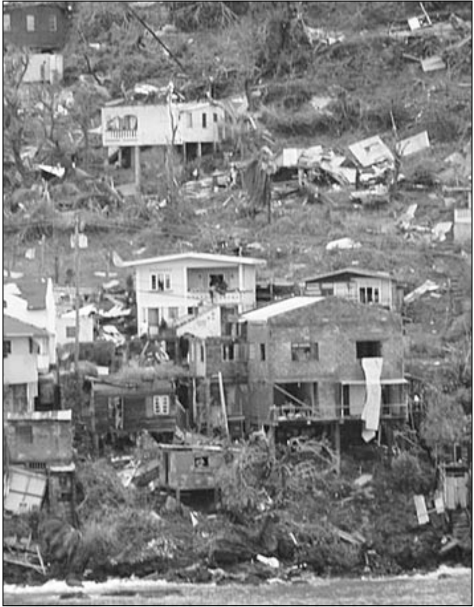
Insuring homes against natural disasters is important