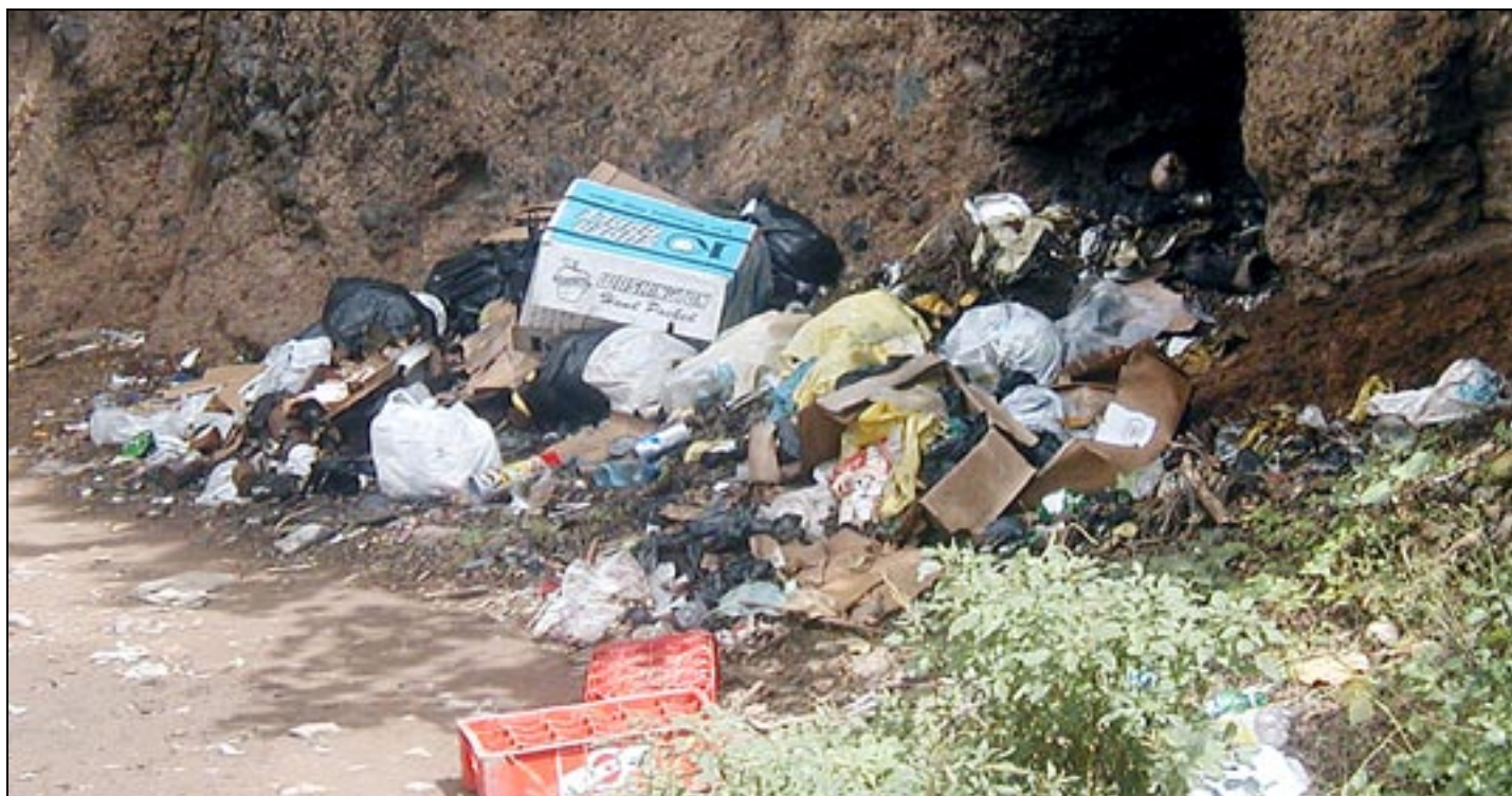
An ideal breeding ground for rodents

Baiting is currently being carried out in the following specific target sections of the pilot areas: two secondary schools and the Anglican school, where baiting