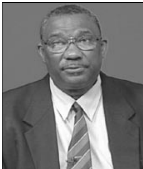
Hon. Senator Calixte George Minister for Home Affairs and Internal Security

A gainst the backdrop of Government's "Contract of Faith" with the people of St. Lucia, and on its resumption of office, the Ministry of Home Affairs and Internal Security, is playing its part in the delivery of Government's comprehensive Judicial Reform. The development and implementation of a number of new initiatives which were necessary to strengthen the criminal justice system and minimize the loss of life and property by fire were undertaken.