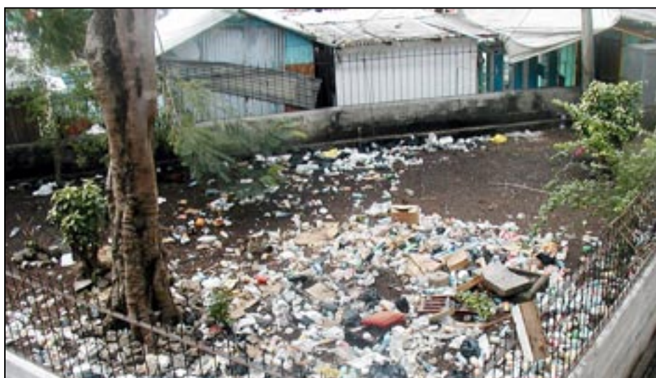
Poor garbage disposal practices will attract rats

is being done by the grounds men and supervised by the Vector Control Officers assigned to the RCCU. The CDC, the Darling Road Housing Estate, the Castries Market, Victoria Hospital and The Derek Walcott Square are also being baited.