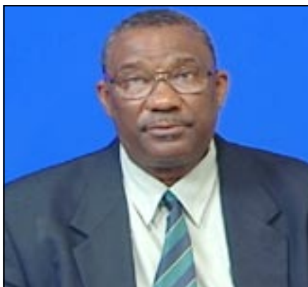
From Crisis to Hope - page 7