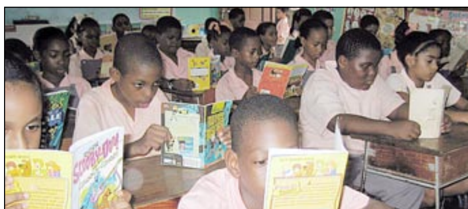
The challenge for primary school students is to gain a place at a secondary school