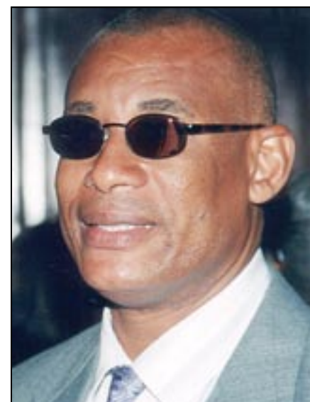
Hon. Damian Greaves Minister for Health

"If we need to modernize our health services and our hospital care, we would be compromised by the building at Victoria hospital. We have developed an alliance with the French authorities and with the Laminar Hospital. In fact the Laminar Hospital is about 80% complete and we are following closely on the heels of that hospital, which will in fact be the same size with the hospital we are building in St. Lucia," the