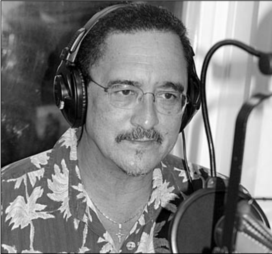
Hon. Dr. Kenny D. Anthony

and the 50th Anniversary of Hurricane Janet. How time flies!