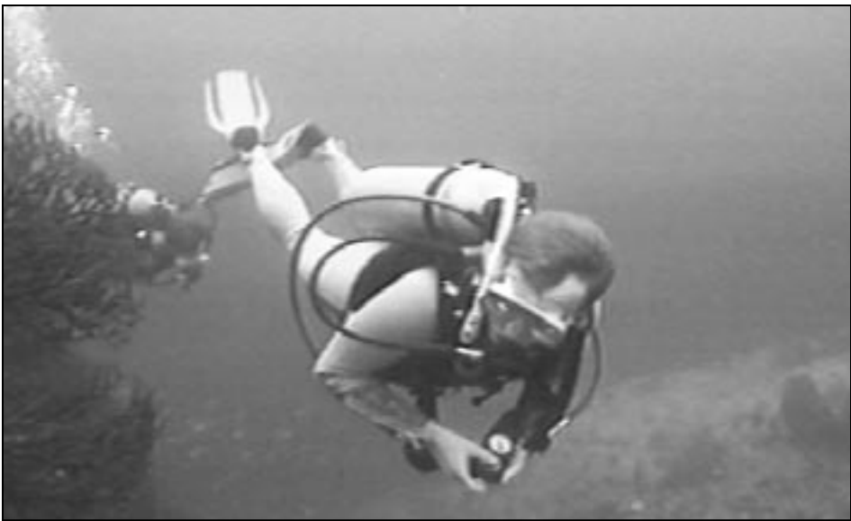
A diver enjoys a scenic moment in the SMMA

Since the SMMA was formed, through the combined efforts of resource users, management authorities, scientists, non-governmental groups,