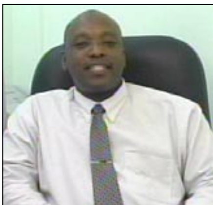
BELfund empowers the unemployed - page 2