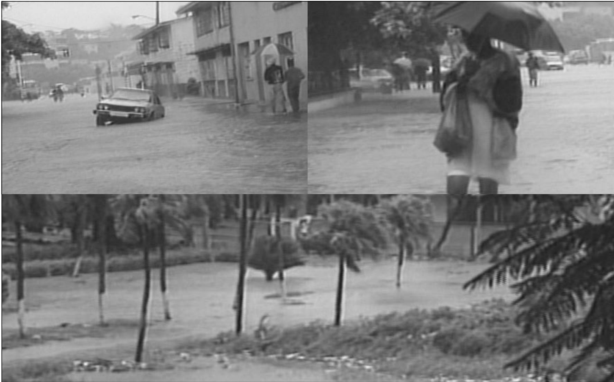
Pictorial memories of Tropical Storm Debbie