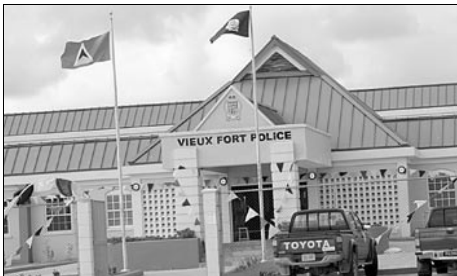
Millions of dollars have been spent on building and upgrading infrastructure

In keeping with international accepted standards, and the demands and requirements of the 21st century, Government also introduced a new philosophical approach for the management of inmates committed to the Facility; through the development and imple-