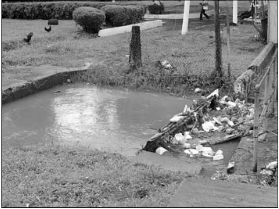
Indiscriminate dumping of solid waste is a major problem