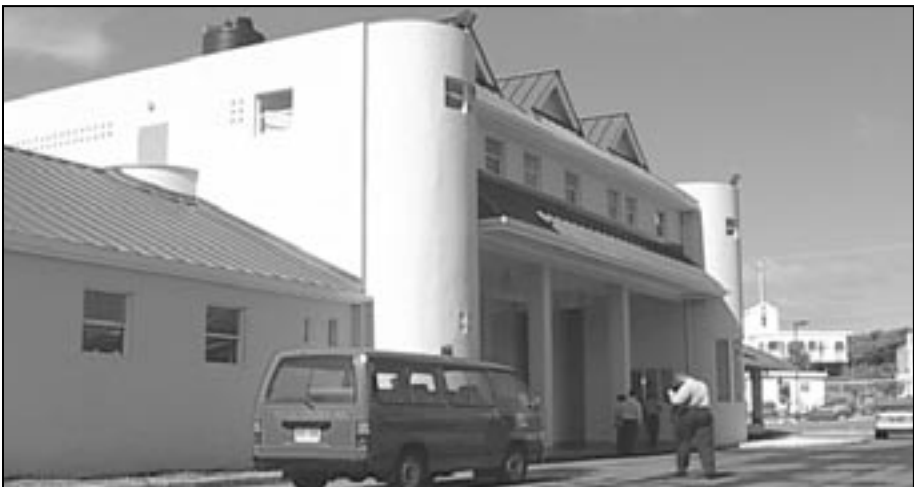
Modern facilities for increased efficiency

All Fire Service recruits are trained and tested in emergency response tech-