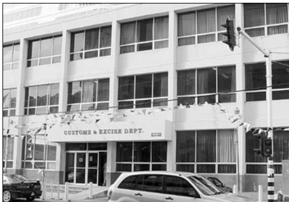
Customs and Excise Department on Jeremie Street

The success of these initiatives depends heavily on modern and reliable information systems in order to streamline operations. This state of the art ASYCUDA++ program provides customs with a wonderful opportunity to do just that. It is the first but huge step towards the attainment of “E – Government”. Customs must take the lead in that process, and it must start by automating trade.