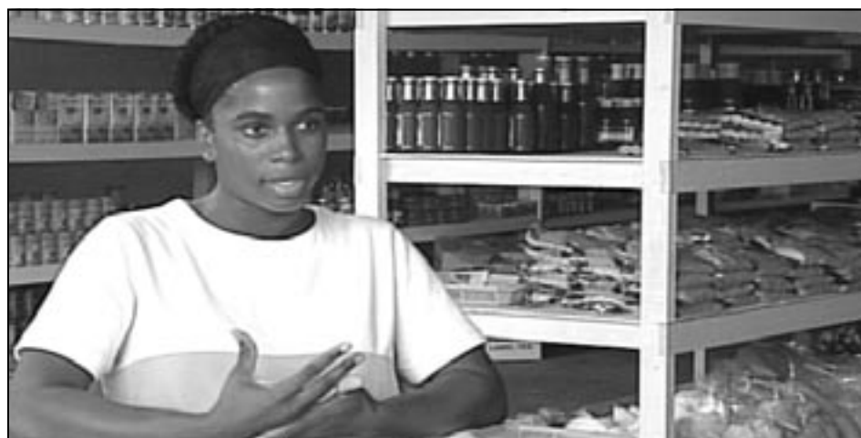
A BELfund client

It was with these concerns in mind that the BELfund and the National Skills Development Centre (NSDC) saw the need to collaborate with each other, in an effort to provide credit and other business services to the many skilled persons who have either graduated or will be graduating from that facility, to assist in establishing their micro businesses. However, persons who are not graduates of the NSDC need not feel left out, as those interested in participating in the YEDF programme can call or visit the offices of the BELfund at # 31 Leslie Land Road, Castries, the Headquarters of the National Skills Development Centre (NSDC) in Bisee, Castries or the Headquarters of the National Youth Council (NYC) on Peynier Street, Castries to obtain Application forms for the programme. Arrangements are also being made to have Application Forms at the various Regional Offices and District Youth & Sports Council Offices around the island.