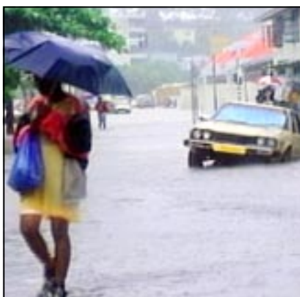
PM warns against complacency - pages 4 & 5