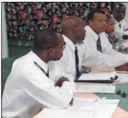
Customs changes its way of doing business - page 3