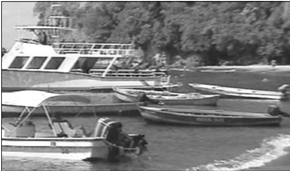
The SMMA - Bustling with activity

The SMMA will continue to fulfill its objective of conserving coastal resources for current and future generations. The future looks bright for fishers and fish-lovers alike.