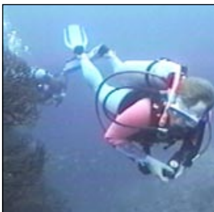
SMMA reaps rewards - page 6