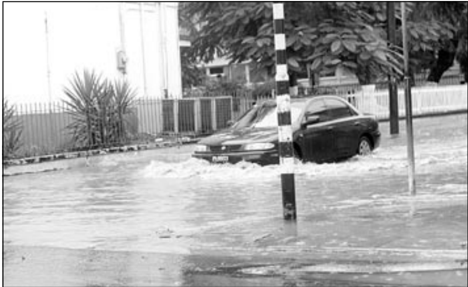
Corner of Laborie and Jeremie Streets after heavy rainfall