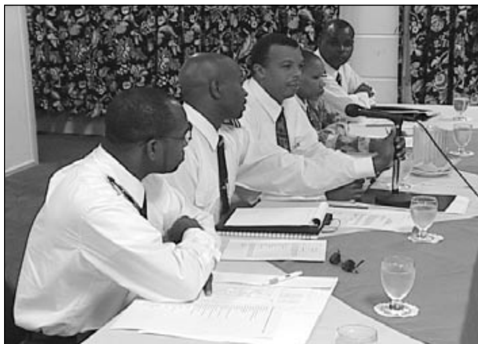
Customs employees frequently engage in training

submission of on-line trade declarations.