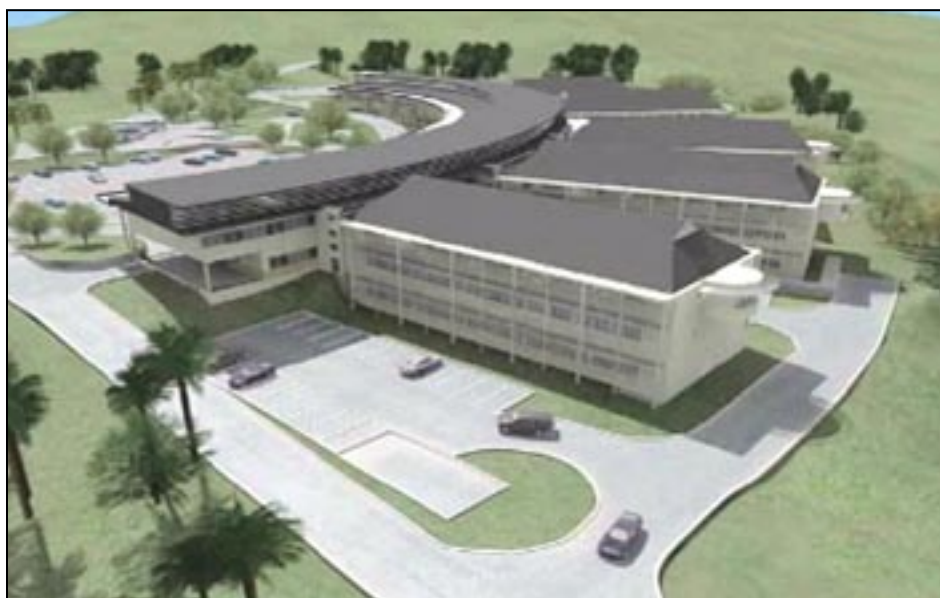
State-of-the-art National Hospital when completed

With the completion of designs, the architects will now prepare working drawings. That phase which is expected to last three to four months will be followed by the preparation of tender documents and the tendering process for the construction of the hospital which will also take three to four months to complete. The new health care organization is expected to be ready before the end of 2009.