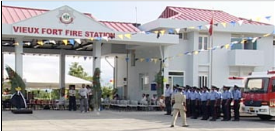
The Government of Saint Lucia - Upgrading all essential services