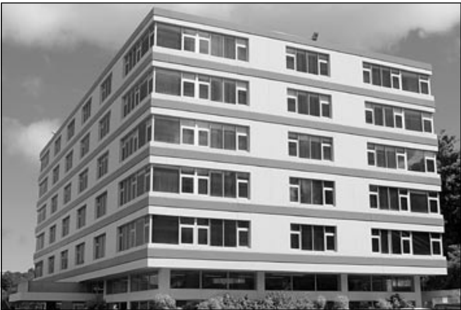
The Integrity Commission is housed in the Sir Stanislaus James Building on the Waterfront - Floor 1

The special exceptions to secrecy and confidentiality rule are: (a) when an order is given by a judge of the Supreme Court; (b) when the Commission assumes special powers to inquire into a declarant; (c) when the information is required in connection with the Exchange Control Ordinance (Cap. 180) or the Commissions of Inquiry Ordinance (Cap. 5), or in connection with court proceedings for perjury under the Criminal Code.