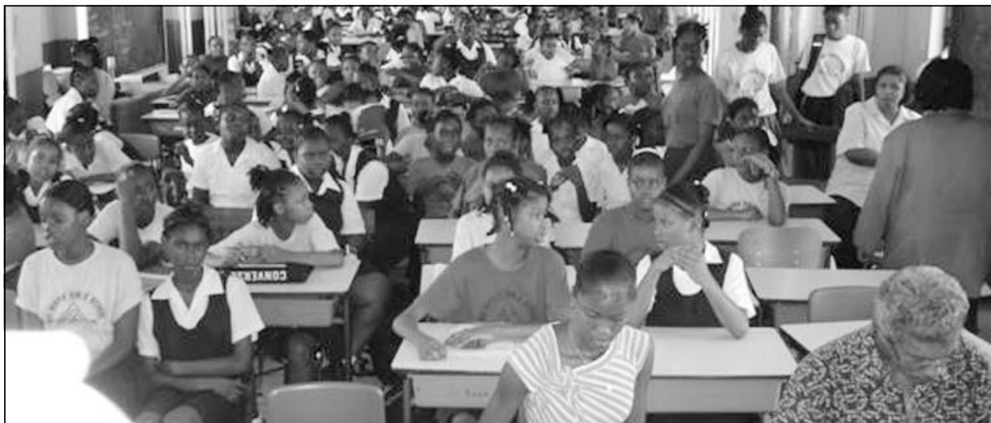
Ave Maria School's presentation on GMOs and Biosafety with Consumer Affairs Department and Ministry of Agriculture, Forestry and Fisheries

S t. Lucia is currently engaged in developing a national bio-safety framework for the country. What is Biosafety and why is such a framework important for St. Lucia? By now most of us must have heard of the term "genetically modified organisms" or GMOs. The theme for World Consumer Rights Day 2005 celebrated on March 15th and promoted by the Consumer affairs Department was "Consumers say no to GMOs". This theme raises red flags in the mind.