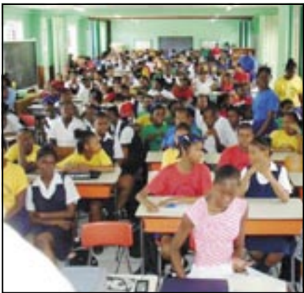
Saint Lucia Joins movement to minimize impacts on GMOs - page 2