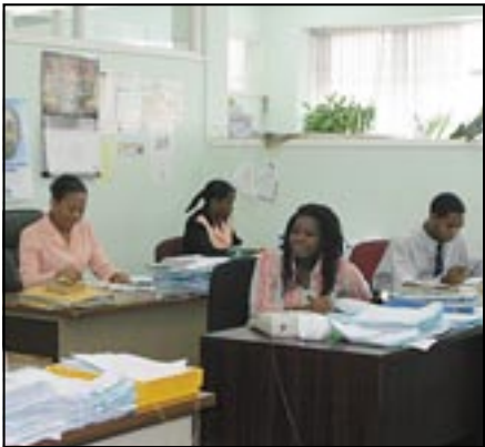
Statistics Department begins survey of living conditions tomorrow - page 3