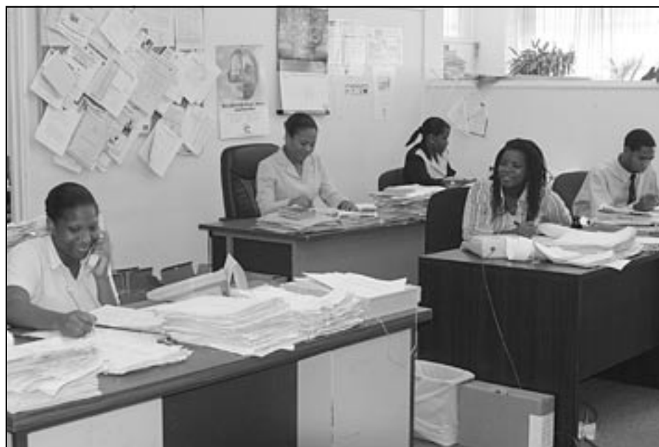
Staff at the Statistics Department working feverishly to ensure that all goes well

For this survey, the statistics department will be providing a sum of $15 EC per spender completing two one-week daily diary questionnaires using the memory joggers. Most households will have two spenders and will be entitled to receive a sum for $30 dollars if that is the case. If there are more spenders in the household, more money will be received by the household.