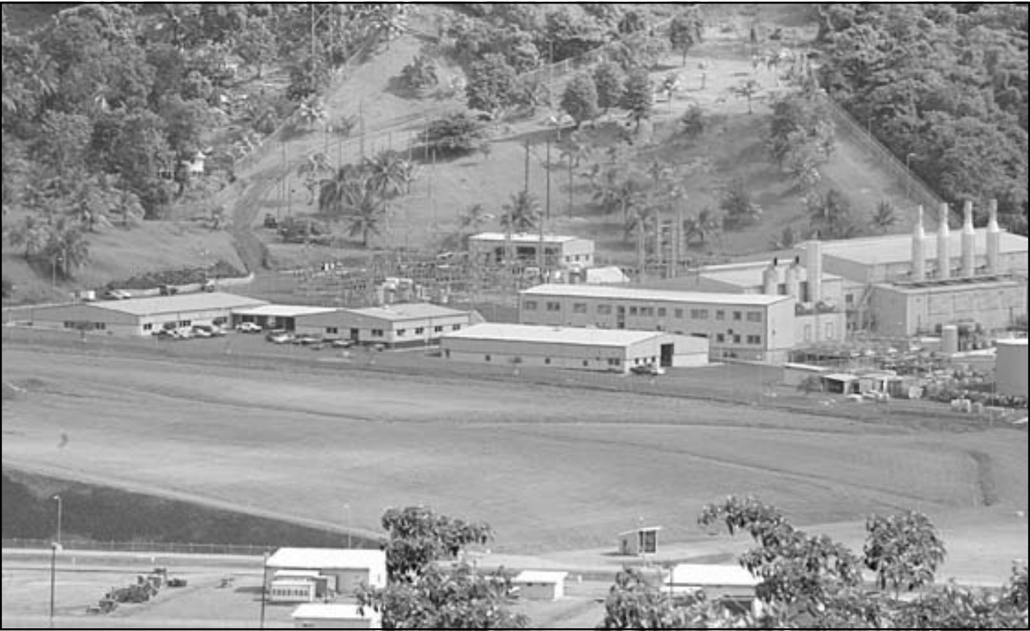
LUCELEC must find alternative sources of energy soon

The main aim of the Petrocaribe initiative is to supply oil at preferential prices to the countries of the region. As part of the preferential pricing arrangements proposed by the Venezuelan Government, it has agreed to contribute 40 percent of the cost, if oil is selling at more than US$50 a barrel. Further concessions are proposed if oil prices