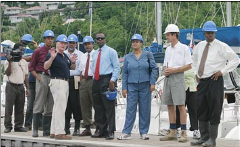
Government ministers, technocrats and Discovery contractors and consultants tour the soon-to-be completed hotel facility

"I am pleased to know that as we speak there are 350 Saint Lucians employed in this hotel in the construction