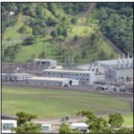
PETROCARIBE- A possible gateway to greater energy security? - pages 4 & 5