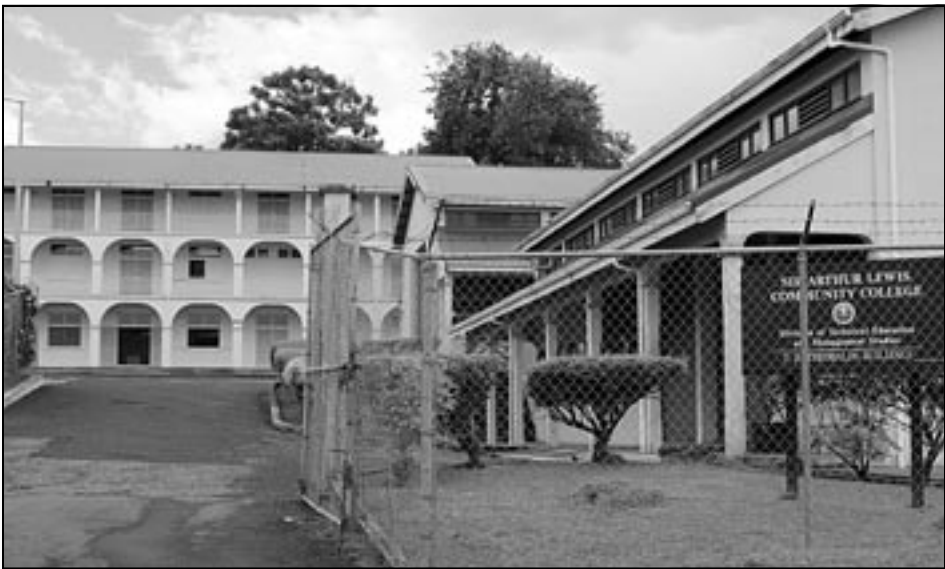
Main buildings of the SALCC are used to educate Saint Lucians who desire to continue their education

The DOCE is responsible for the organization and coordination of part-time courses and programmes, workshops and seminars either through day release or evening sessions. The Department also seeks to promote collaboration with both the public and private sectors as well as with foreign agencies and institutions.