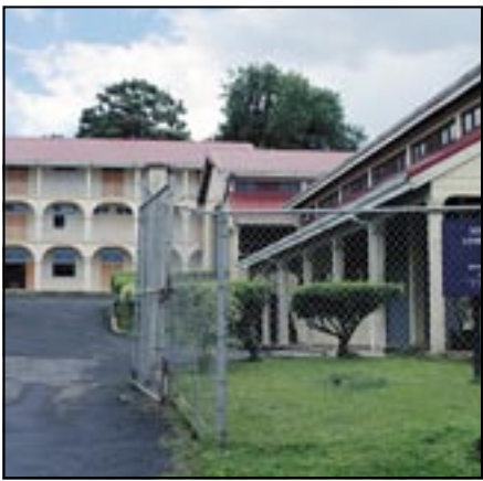
Continuing education - The Saint Lucian context - page 6