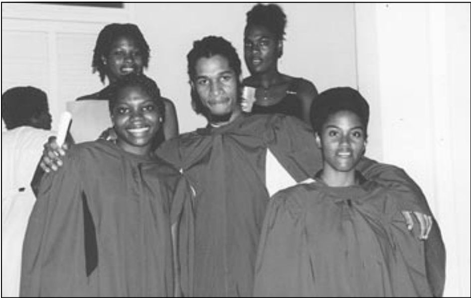
Hundreds of Saint Lucians graduate from the DOCE annually