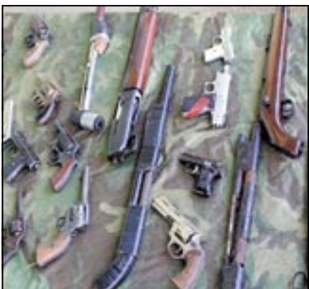
Police recover more illegal firearms - page 6