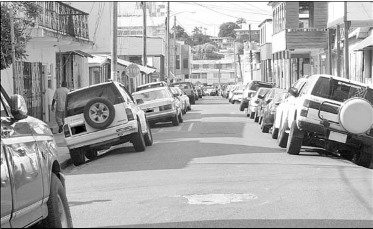
The continuing hike in world oil prices may force changes in driving habits

island Republic of Trinidad and Tobago. As a member of the Caribbean Community, and as an expression of regional solidarity, obtaining refined oil from a fellow CARICOM member-state was always a logical choice. In any event, Trinidad’s oil is protected by the Caricom trading regime.