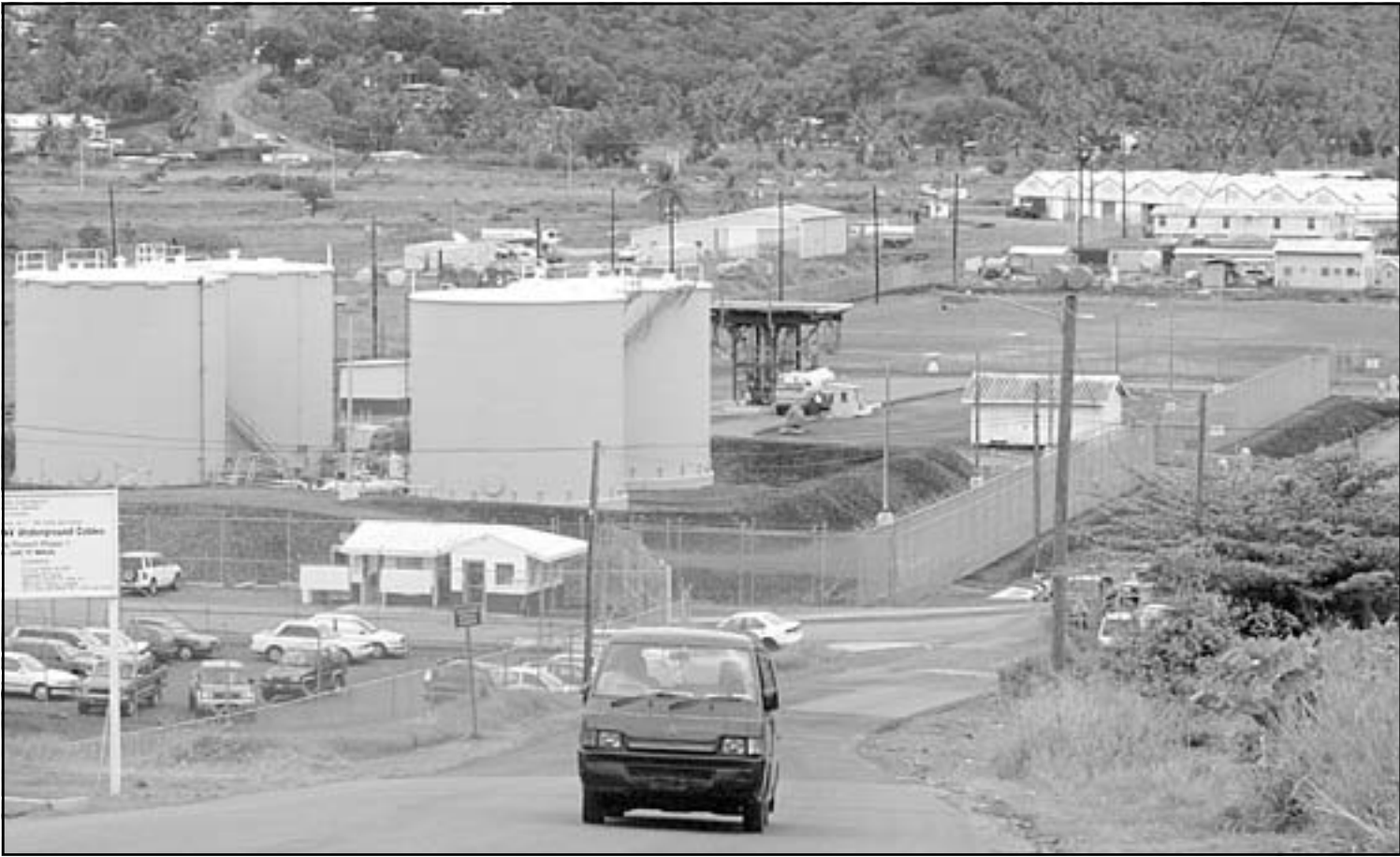
Storage facilities are essential if the agreement between the governments of Venezuela and St. Lucia is to be successful

Caribe initiative by Venezuela has opened for us a new door that represents a possible lifeline. I say it is a “possible lifeline” because there are hurdles in the way of implementing the initiative. Before I itemize the hurdles and the challenges, let me explain the initiative.