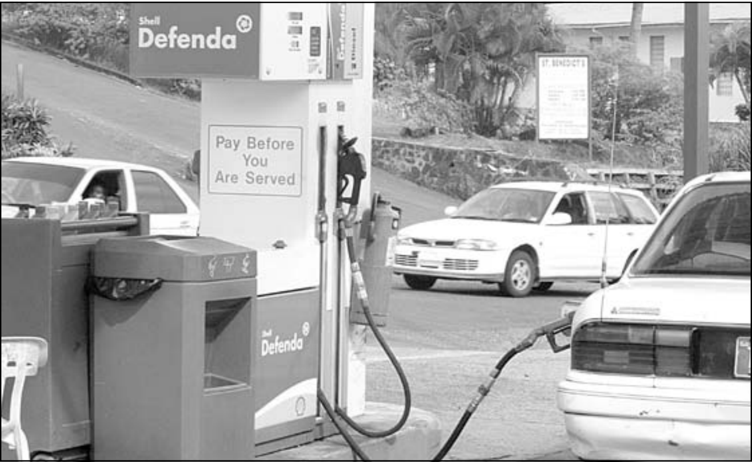
The government of Antigua and Barbuda announced a hike in the price of gas earlier this week

period shall be extended to 25 years, including the specified grace period of two years, at 1 percent interest.