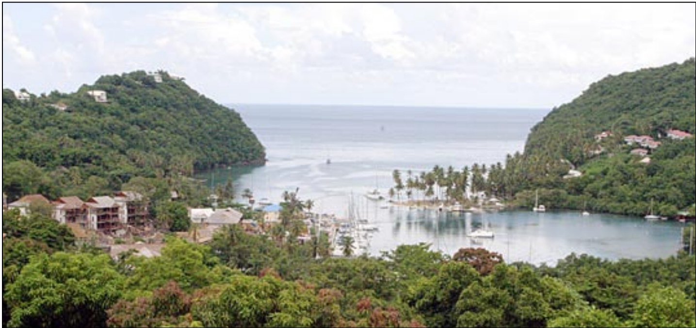
Discovery at Marigot Bay (L) nestled in the charming Marigot Inlet

stage. It is a learning process; they are learning skills they did not have before. What's even more pleasing is when the construction is completed, there is going to be 200 full-time jobs and these jobs are not only in the area of service."