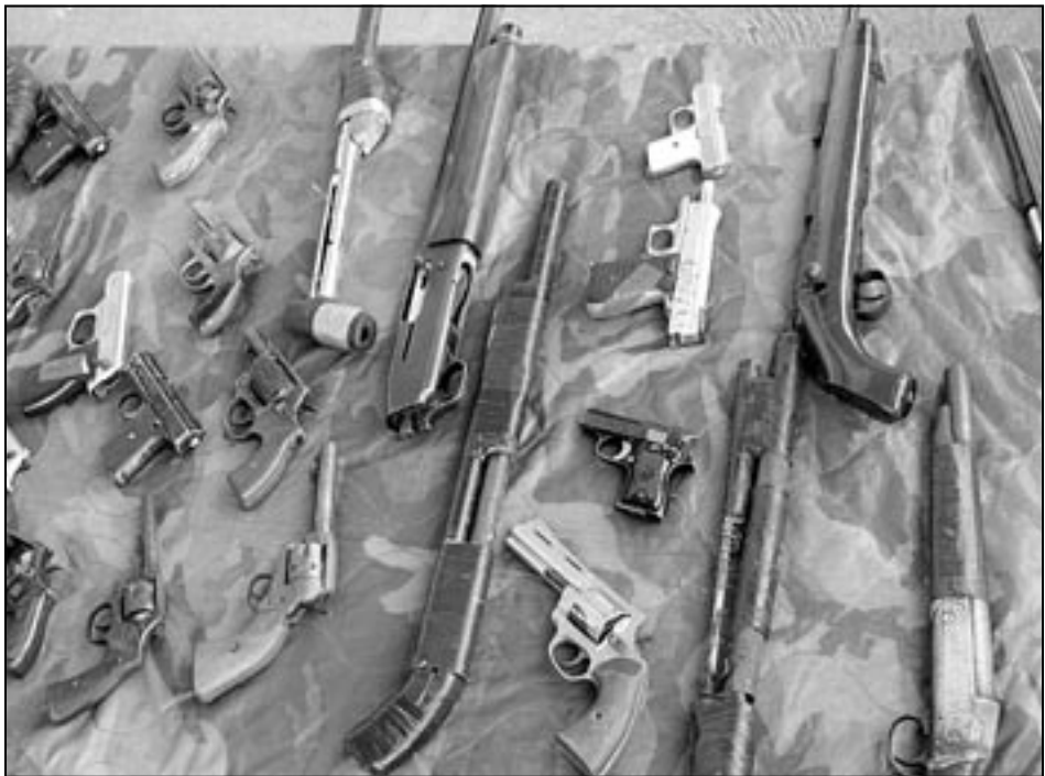
An amazing assortment of illegal firearms retrieved by the police