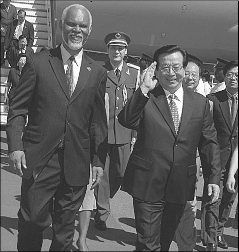
Foreign Affairs and Foreign Trade Minister, K.D. Knight (left), escorting Vice President of the People's Republic of China His Excellency Zeng Qinghong (right) across the tarmac after he arrived at the Norman Manley International Airport in Kingston by special aircraft this morning (Tues. Feb. 1) on an official three-day visit to the island.

Vice President of the People's Republic of China, His Excellency Zeng Qinghong, arrived in Jamaica today (February 1), following a three-day visit to Trinidad and Tobago.