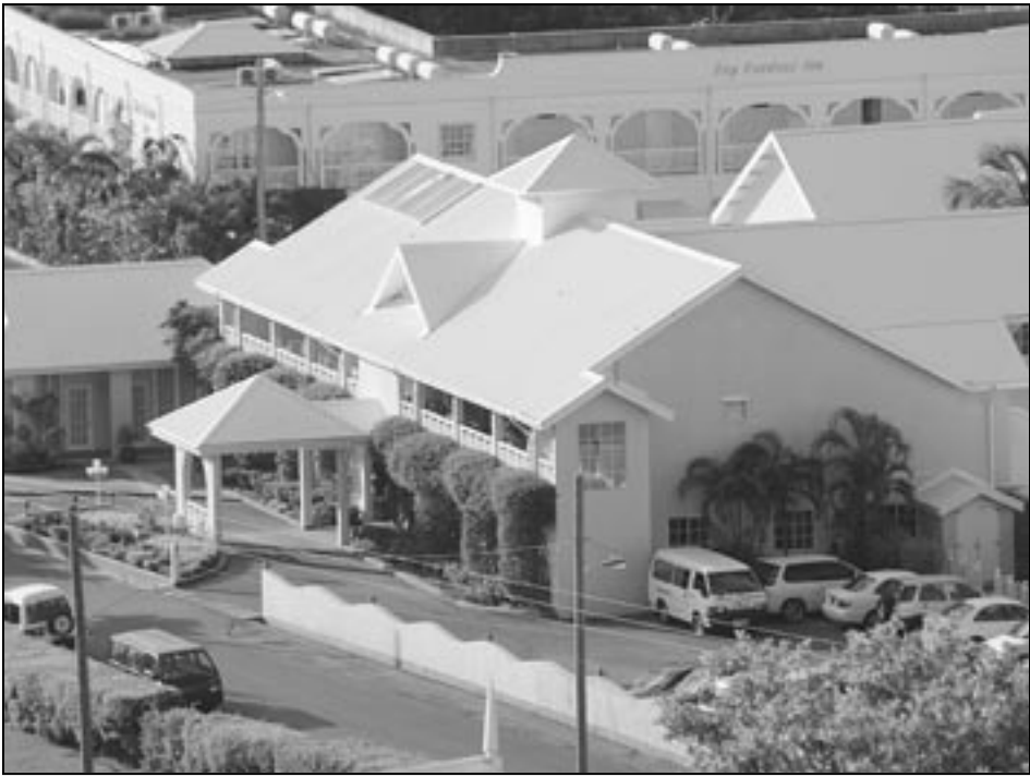
Bay Gardens Hotel

The Crystal Awards recognize the efforts of travel agents, who sell Star Vacation packages to destinations served