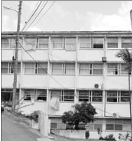
Section of Victoria Hospital housing the Leprosy Unit

Leprosy Day was observed under the theme, “Uniting Forces in the fight against Leprosy”.