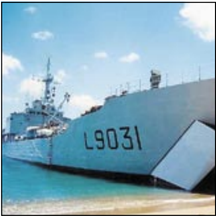
French boat coming for Independence - page 6