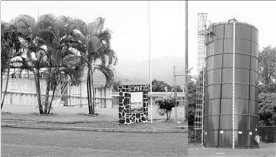
WASCO’s waster storage and treatment facility at Ciceron

cia. This project will eventually close on the 31st of March 2005”, the Minister informed. The Bill was facilitated and directed under the terms of the 5th Water Reform Project, initiated by Government, and funded by the World Bank and the Caribbean Development Bank.