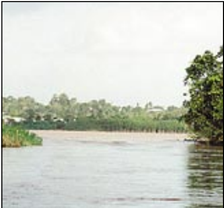
PM Guyana Flood Appeal - page 2