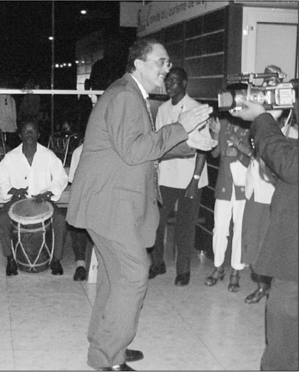
Airport by St. Lucians sporting their national flag and colours

However, the Prime Minister indicated that the French Government had opened the way for closer contact by generously relaxing the requirements for visas for travel by St. Lucians to the