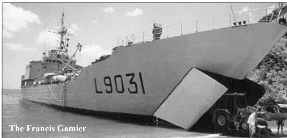
The Francis Garnier

O n the occasion of Saint Lucia's 26th Anniversary of Independence, the French ship "Francis Garnier" will visit Port Castries from 16th to 23rd February