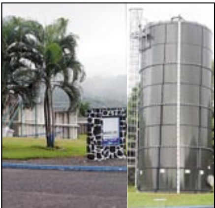
Water Bill passed - page 7