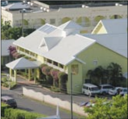
Bay Gardens: Best Hotel - page 2