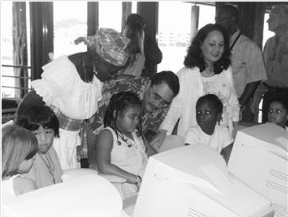
PM and Mrs. Anthony with a St. Lucian national and children at the Kindergarten School at the Mayor's Office in Kourou