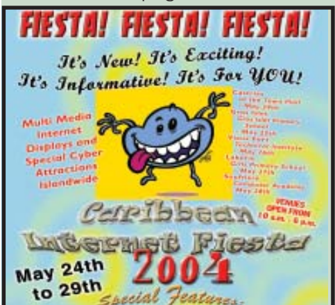
PM's Address at Fiesta - page 8