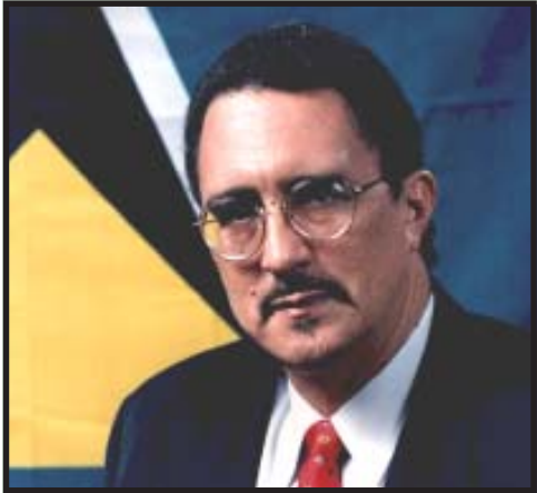
PM of St. Lucia is new Chairman of OECS - page 2

Prime Minister's Weekly Radio Address on all Radio Stations commencing Monday, May 31st