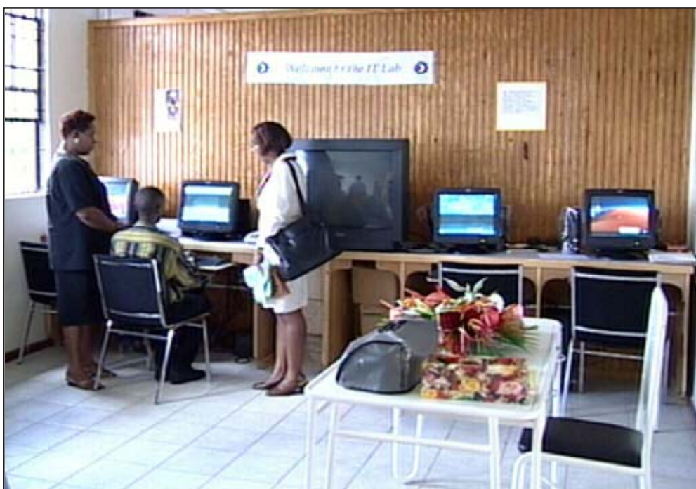
SLBWA Computer Room

Blindness in Saint Lucia has launched into the realm of computer technology, through a special Poverty Reduction Fund/ Blind Welfare Association Project, which was formally handed over to the association on Thursday, May 6th. The project, which begun in 2003, centred upon capacity building and empowerment of visually impaired persons.