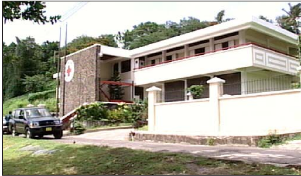
NEMO's Office in the Red Cross Building at Vigie, Castries

A National chapter of The Alliance was launched in Saint Lucia in 2003. There