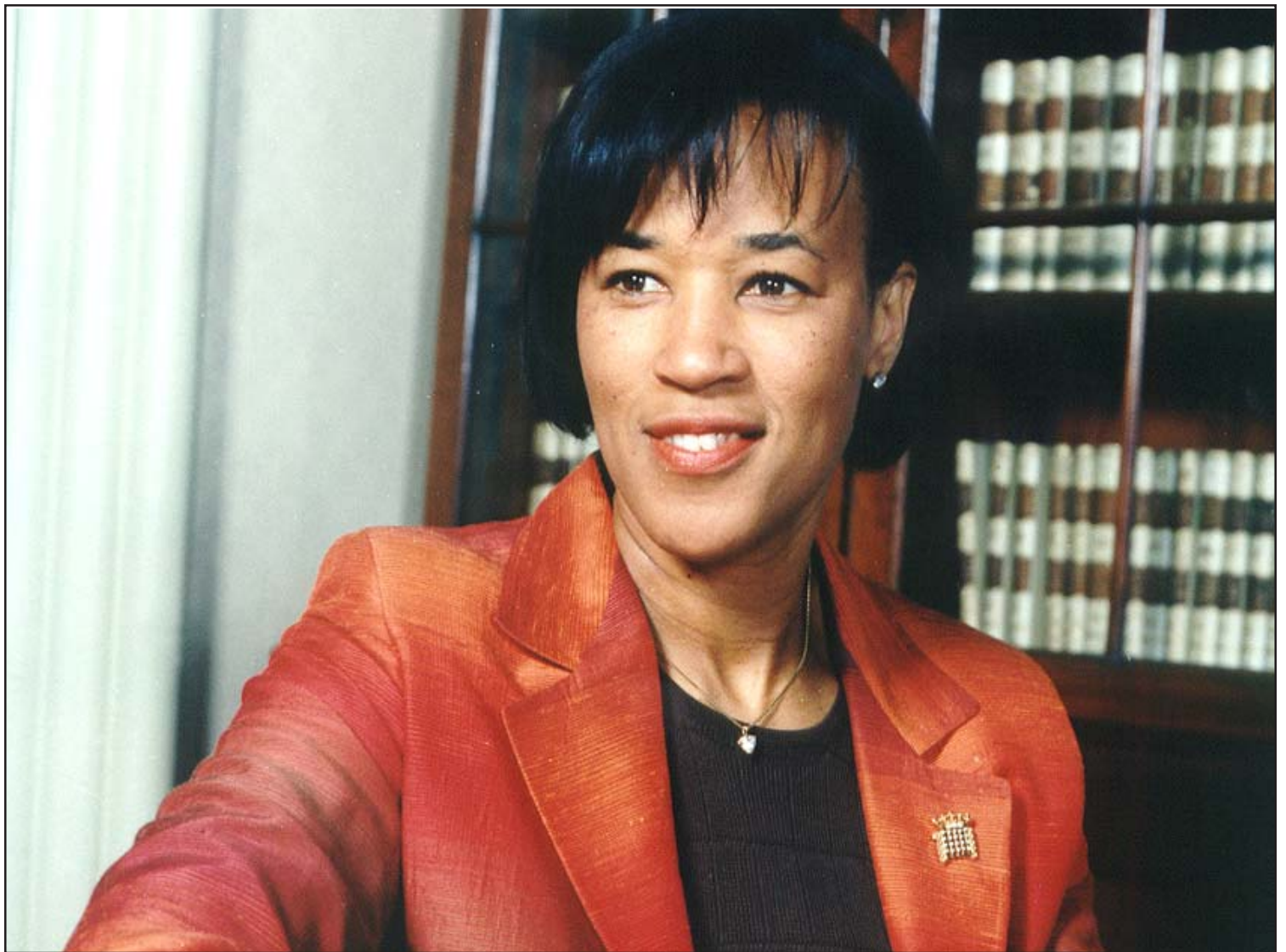
Baroness Scotland — has ministerial responsibility for the reform and modernisation of the UK Criminal Justice System

Following her visit to St Lucia, Baroness Scotland will visit Antigua and Dominica.