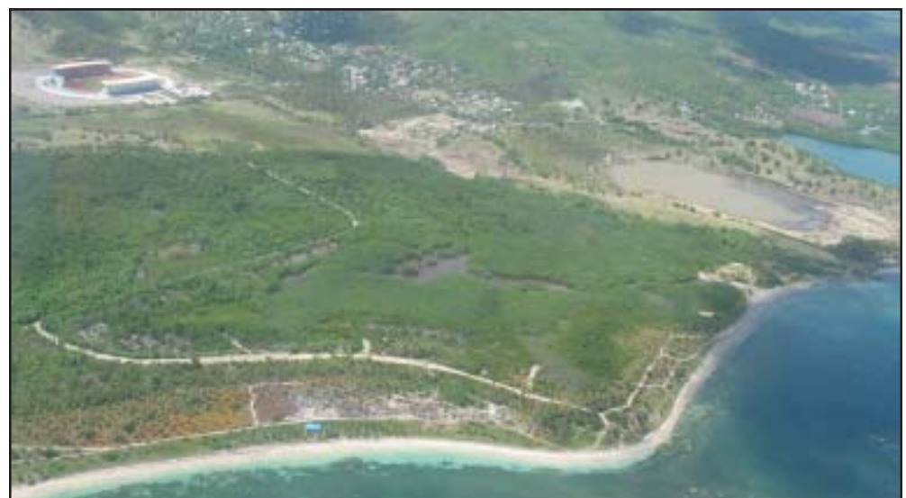
Potential Hotel Site

At Tuesday's Press Conference, Mr. Chastanet made mention of a hotel to be