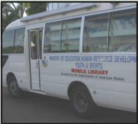
Mobile Library - page 4