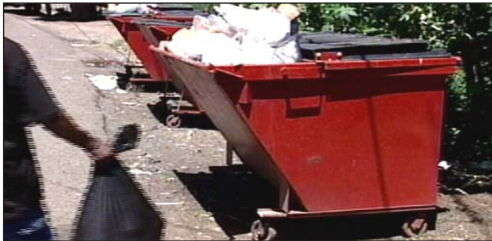
Outsider using Communal Bins