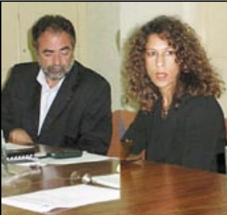
OECS in Le Grand Pavois Boat Show - page 2