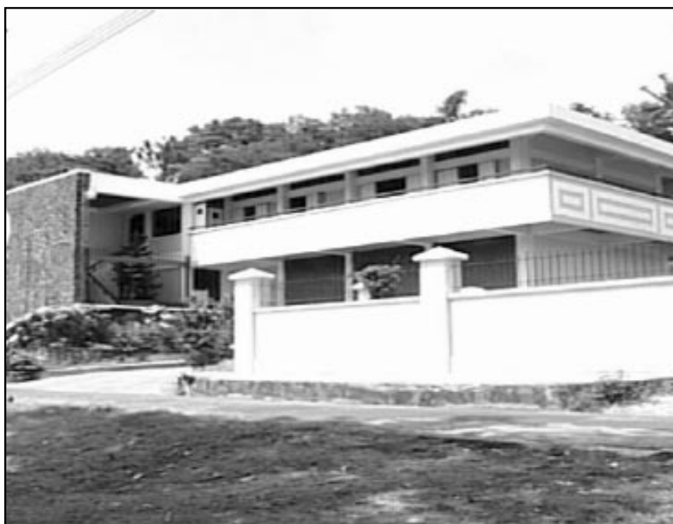
Red Cross building, Vigie, Castries

The SLHTA would like thank all who donated towards this worthy cause.