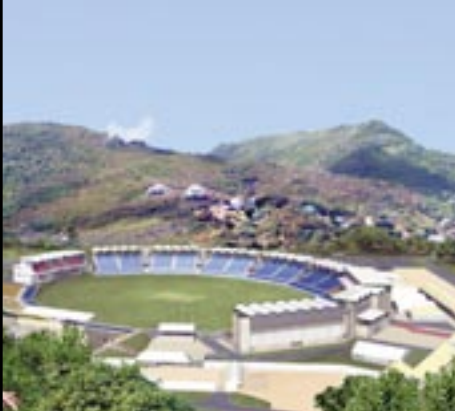
Strategy for CWC 2007 - page 7