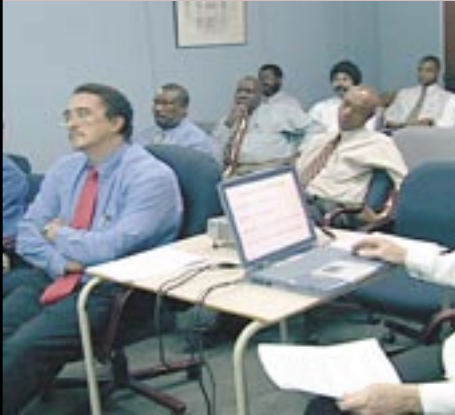
New hospital design presented - page 6