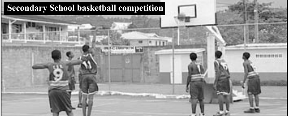
Secondary School basketball competition