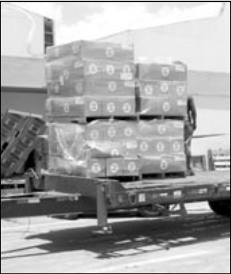
Supplies reaching Grenada

In his statement, Mr Benn spoke of London's commitment to help in Grenada's recovery both immediately and in the longer term. He announced that £500,000 (EC$2.4 million) is being made available to the Regional Appeal of the International Federation of the Red Cross, of which £300,000 (EC$1.4 million) is for Grenada. The Appeal will support 10,000 families for the next six months.