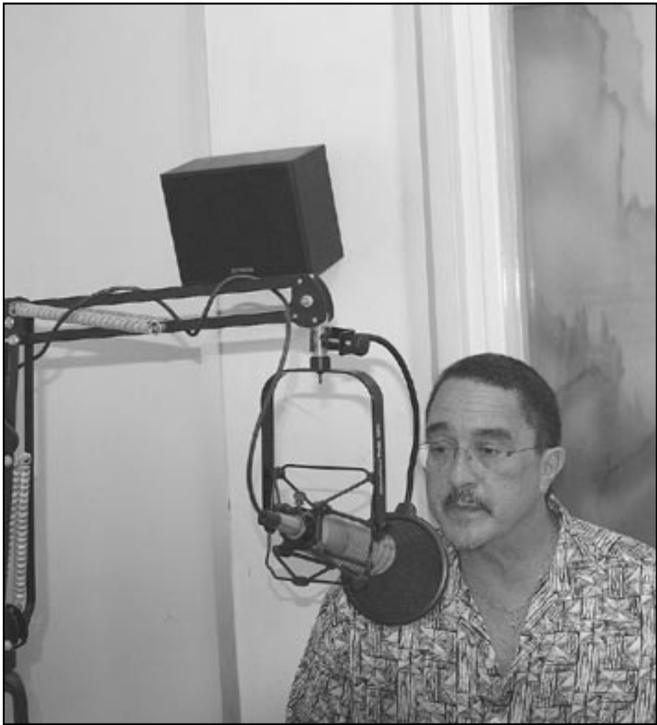
Prime Minister Dr. Kenny D. Anthony

H ello St. Lucia, here we are once again, with each other.