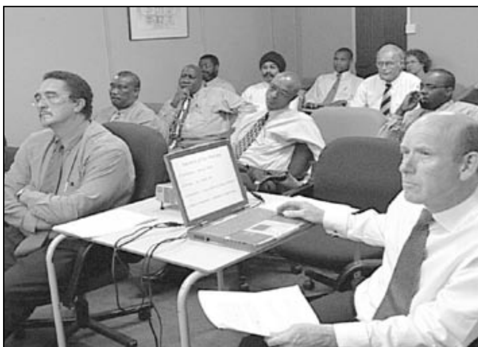
Design for new hospital being presented

The elevation and conceptual form for the new hospital is expected to commence soon after approval of the initial preliminary plans