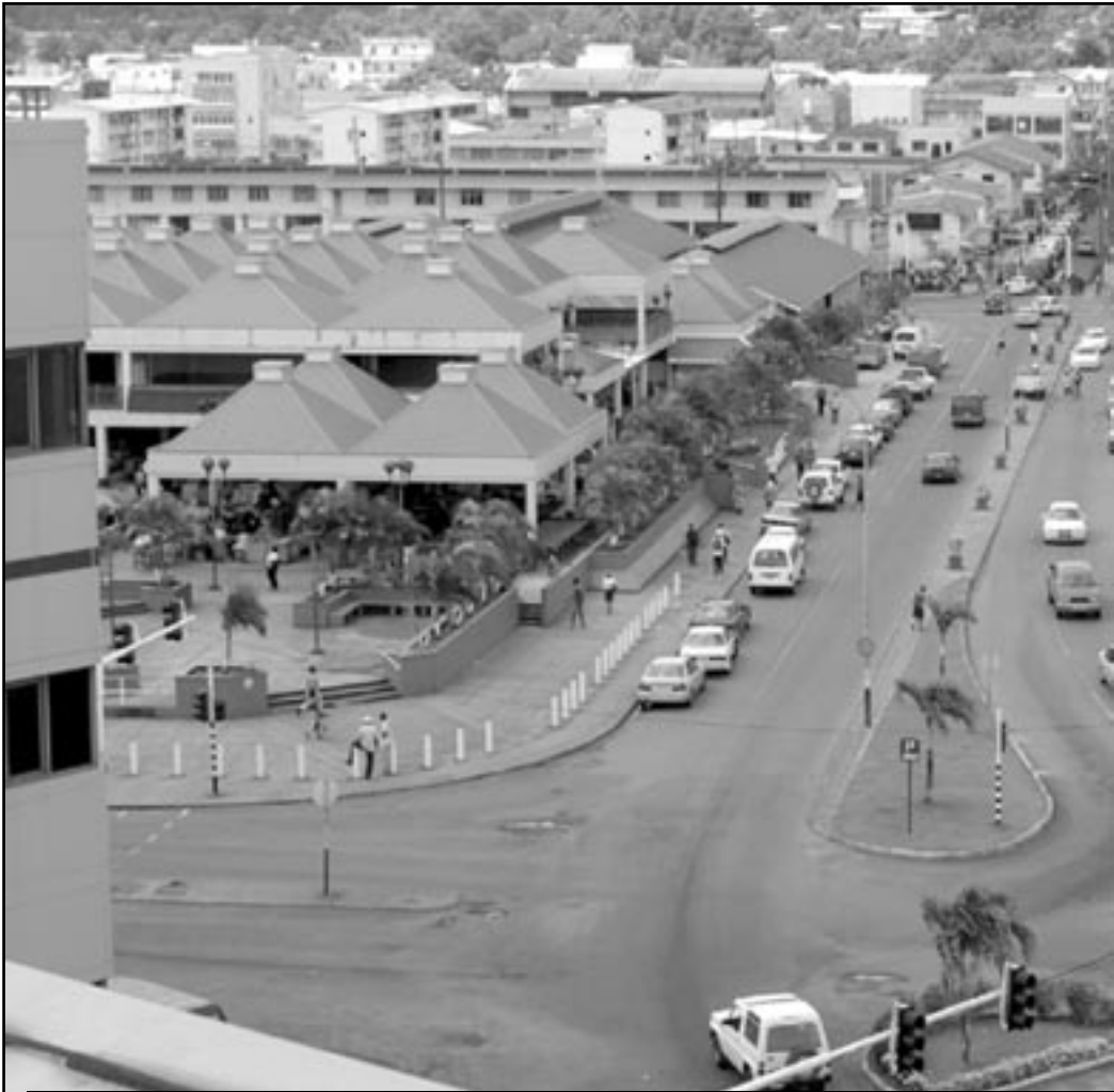
Increased price of fuel affects everyone - Motorists, fishermen, business community

increase. The result is increased prices at the stores or supermarkets, as may be the case. Likewise, the Government does not have to increase duties or taxes for prices to rise. Taxes on goods may remain the same, but the base price for the goods we import from overseas may actually increase, as has happened now because of the increases in the price of