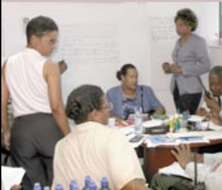
Emergency Operation Centre Management for simulated plane crash