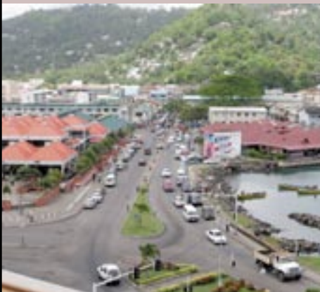
Fuel price rise affects everyone - page 4 & 5