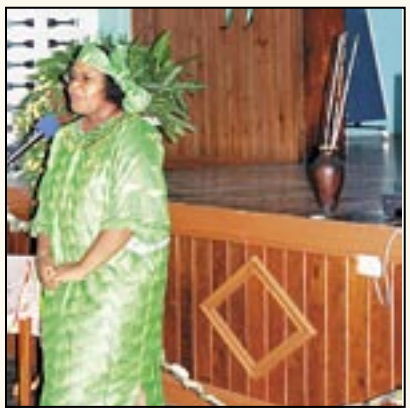
St. Lucia rich with role models - page 6 & 8