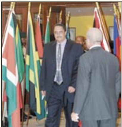
Best Government in the Region - page 1 & 2