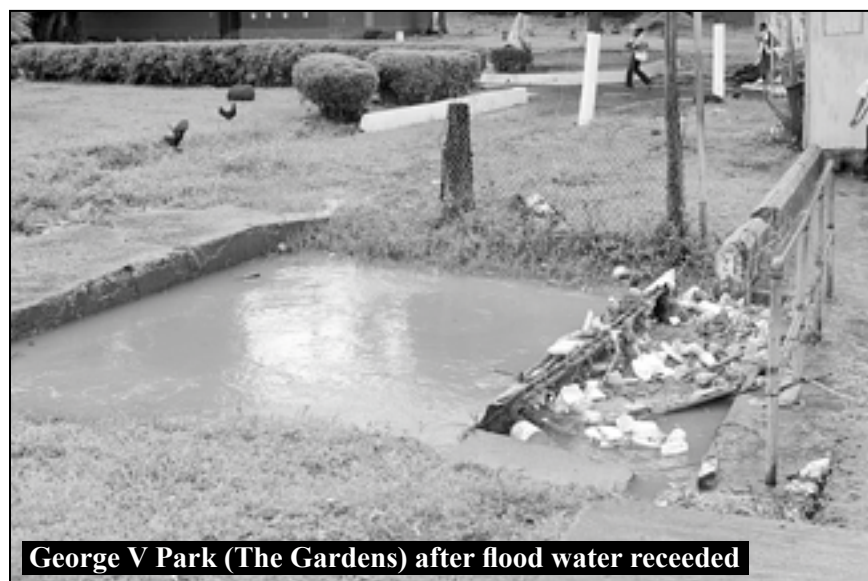
George V Park (The Gardens) after flood water receded

Four contracts were dished out among three contractors from St. Lucia, Martinique and China last week, for the commencement of works in December, to eliminate the incidence of flooding in the area in and around the gardens and in the West Coast Village of Anse-La-Raye.