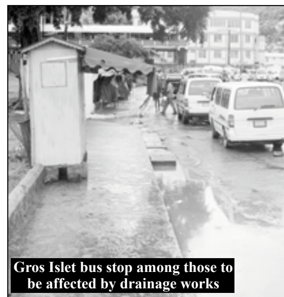
Gros Islet bus stop among those to be affected by drainage works