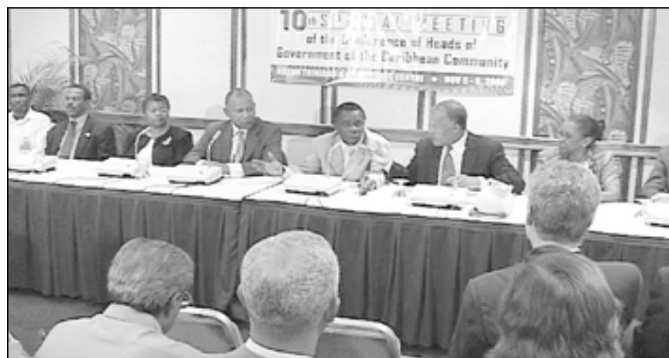
Caricom Ministers at last meeting