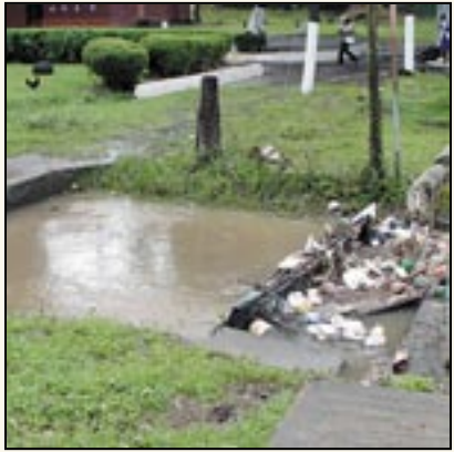
The Gardens prepare for drainage works - page 2 & 7