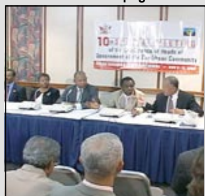
CARICOM forging ahead with 2005 deadline - page 3