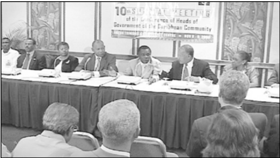
Prime Ministers Patrick Manning, Keith Mitchel and Owen Arthur flanked by CARICOM officials at the recent 10th Special Meeting

The 10th Special Meeting of the Conference of Heads of Government of the Caribbean Community ended its first day with a decision on a top agenda issue - to keep the 2005 deadline for the implementation of the CARICOM Single Market.