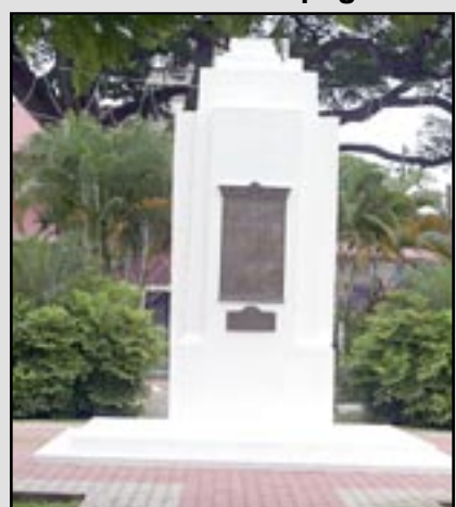
Remembering War Veterans page 4 & 5