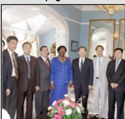
Chinese delegation meets Governor-General - page 4 & 5