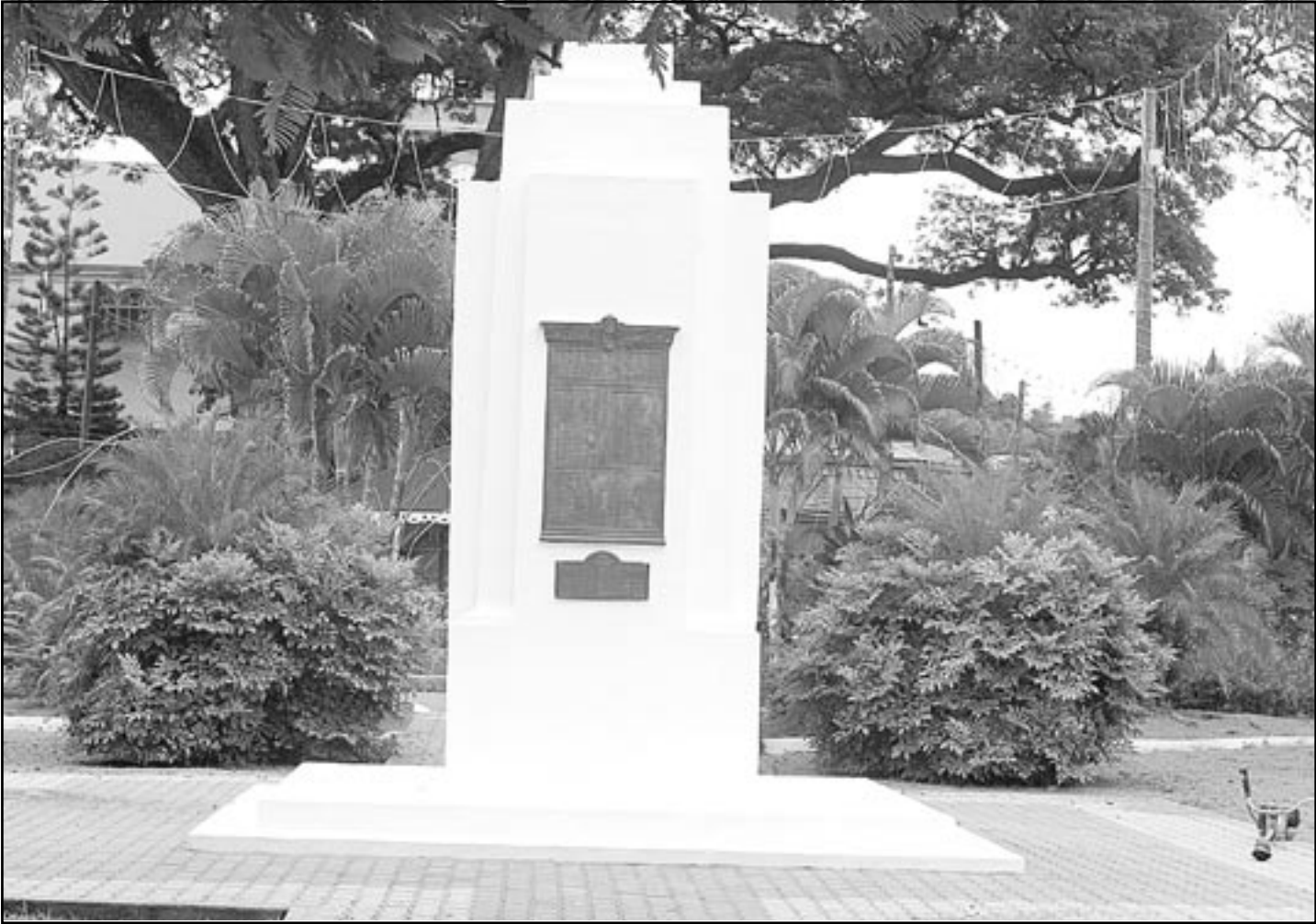
The Cenotaph at Derek Walcott Square