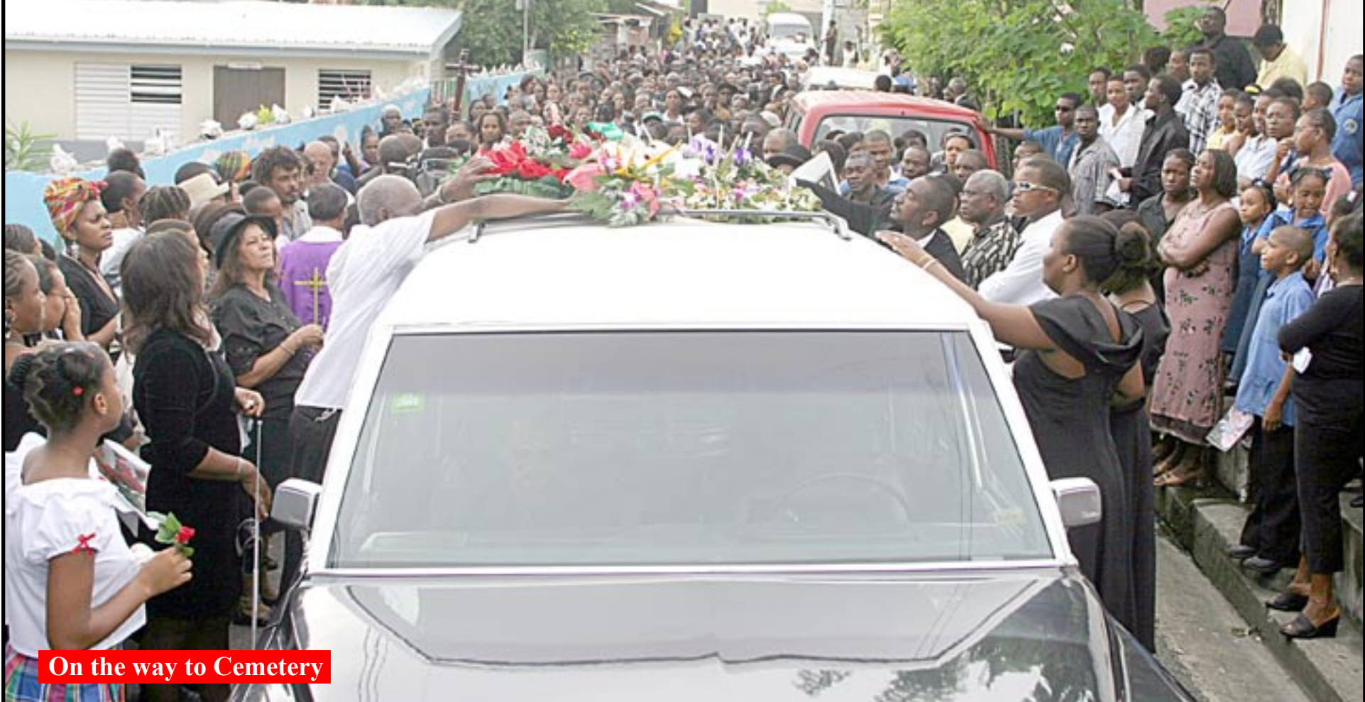
On the way to Cemetery