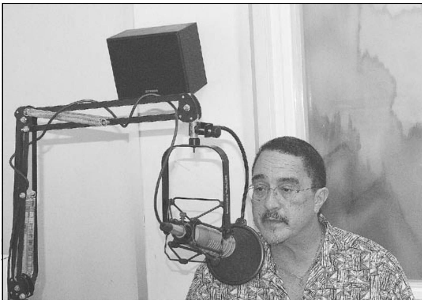
Prime Minister Dr. Kenny D. Anthony