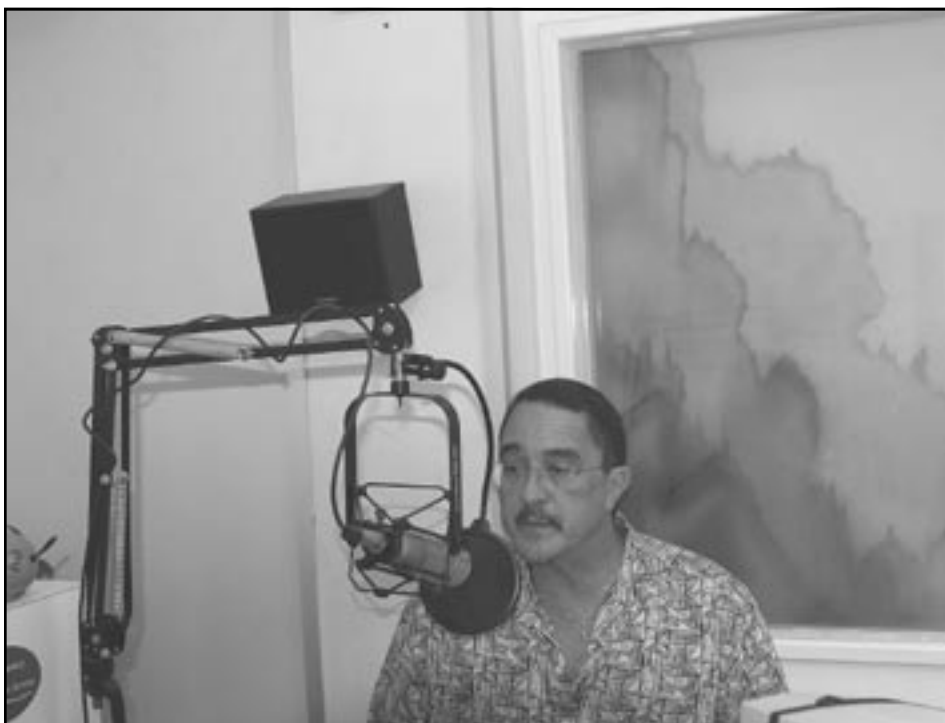
Prime Minister Dr. Kenny Anthony