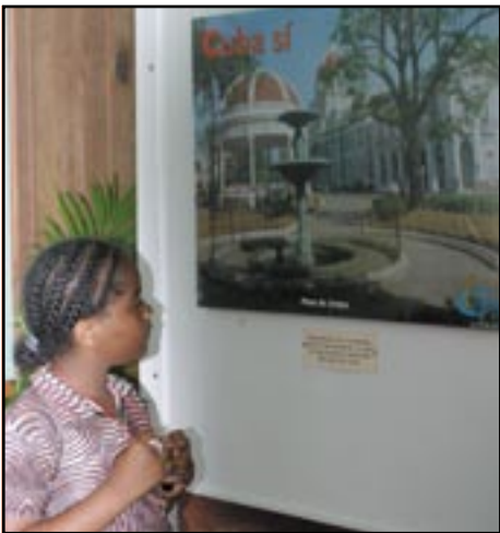
Teenager admires Cuban portrait- page 4