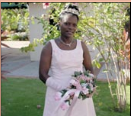
Young La Rose Queen - page 5