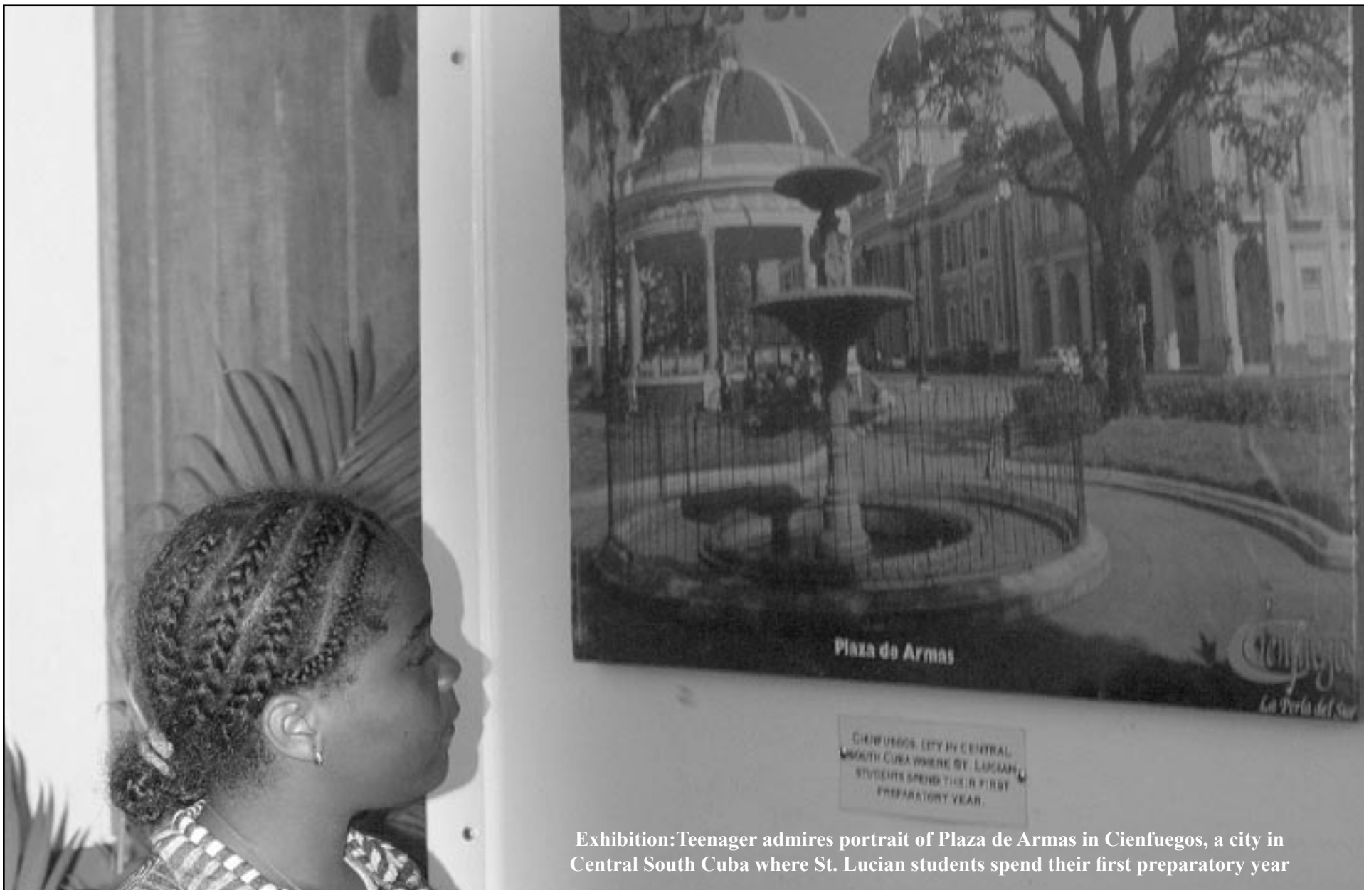
Exhibition: Teenager admires portrait of Plaza de Armas in Cienfuegos, a city in Central South Cuba where St. Lucian students spend their first preparatory year

University education, as we all know, is not cheap. It comes at a high price. The average student paying for a university education at the University of the West Indies (UWI), in the UK, the USA or Canada has to find thousands of dollars to finance his or her university education. That money invariably would have to be borrowed from a bank or some other financial institution. The Government helps by making the loan facilities available, paying economic cost at UWI for some students and for others in the Public Service, meeting the cost of study leave with pay. When the government agrees to provide study leave with pay, it also