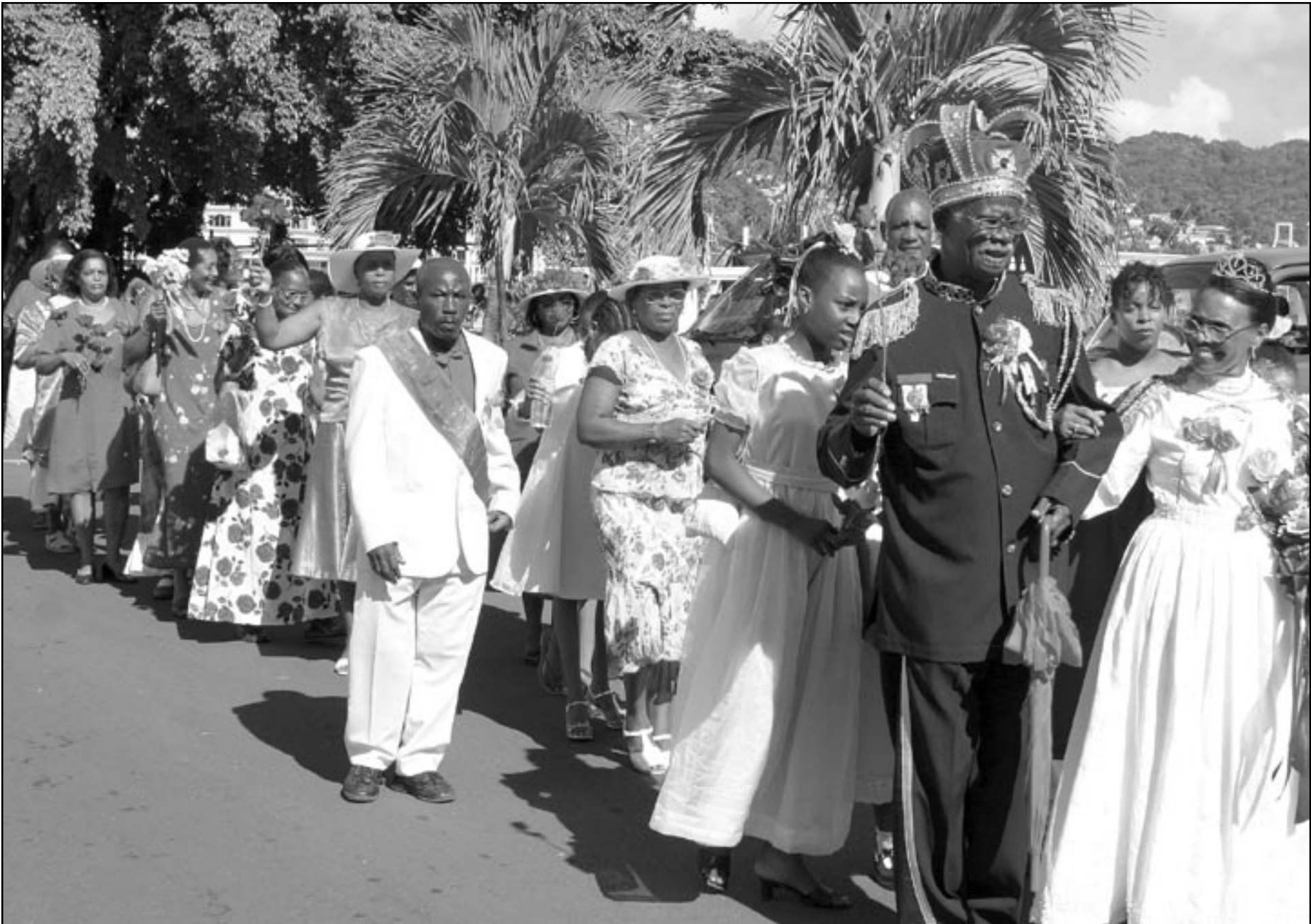
Castries La Rose Group

Until next Monday, I salute you. And to all St. Lucians at home and abroad, in our true native tongue, I say to you: VIVE LA WOZ!