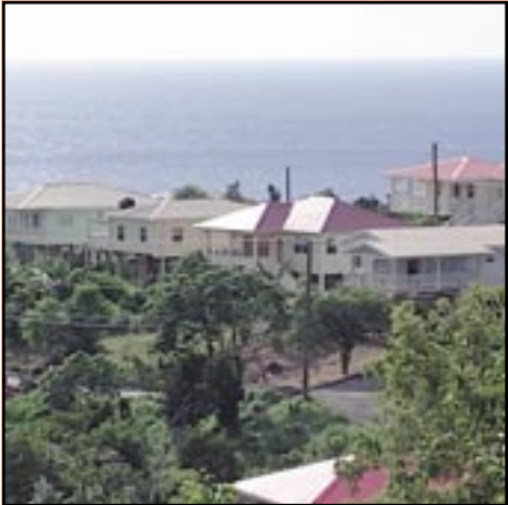
Goverment delivers on Au Tabor - page 2