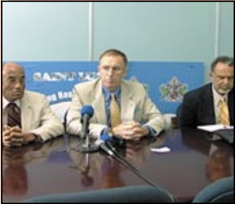
RSS Team - page 3