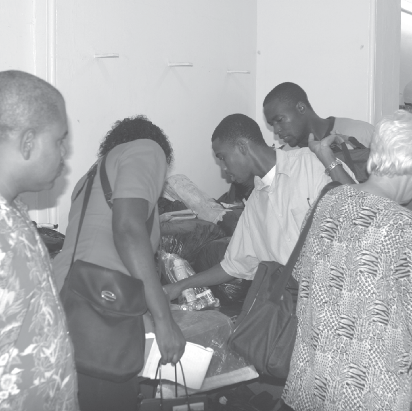
Journalists viewing drugs confiscated from the recent Wilton’s Yard raid