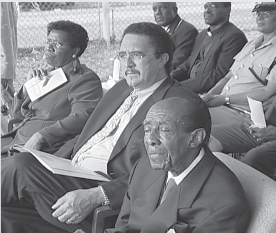
Sir George F.L. Charles with Prime Minister Dr. Kenny D. Anthony & Governor General, Dame Pearlette Louisy

The Prime Minister also urged that "the freedoms Sir George fought for yesterday, and that we now have and enjoy today be cherished and sustained for tomorrow for all generations of St. Lucians."