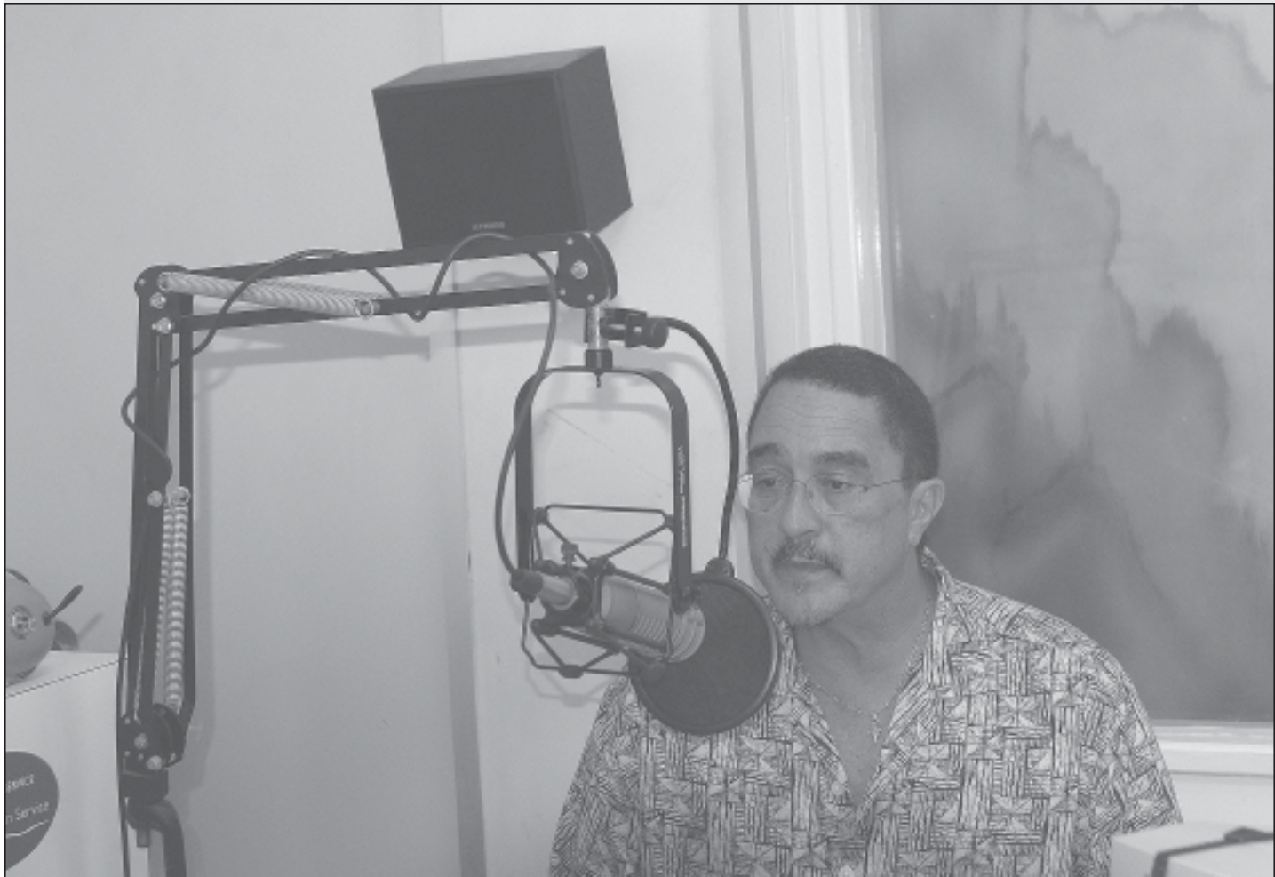
Prime Minister, Dr. Kenny D. Anthony addressing the Nation

H ello St. Lucia, It has been a very wet weekend and I hope the weather has not been too unkind to you.