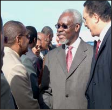
Jamaican P.M., P.J. Patterson being introduce to Cabinet Members