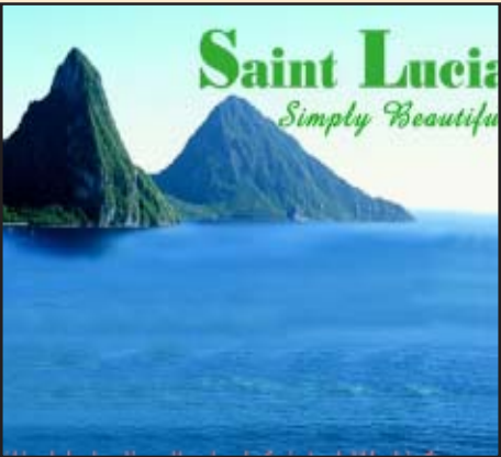
Pitons now on World Heritage list