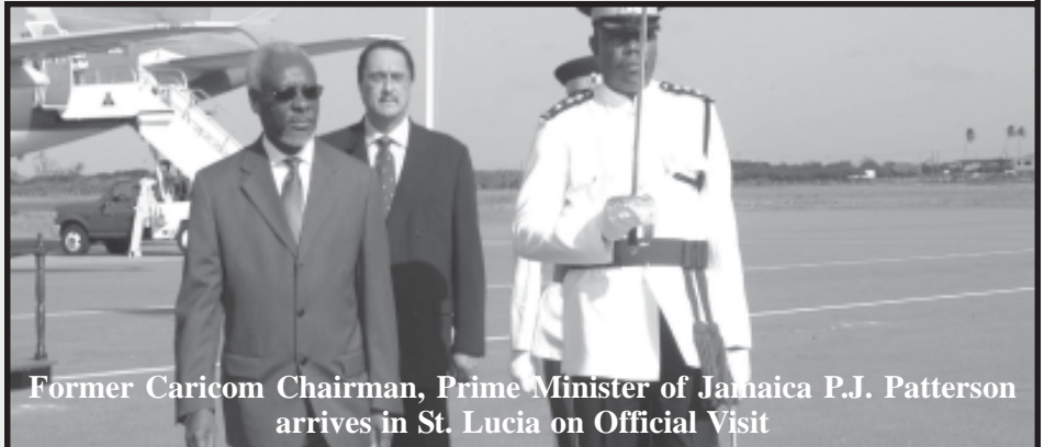
Former Caricom Chairman, Prime Minister of Jamaica P.J. Patterson arrives in St. Lucia on Official Visit

Prime Minister, Dr. Kenny D. Anthony is expected to attend the CARICOM Meeting.