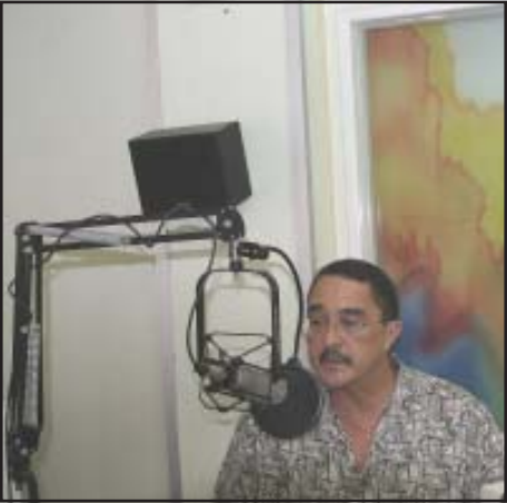
PM talking crime - page 4, 5 & 8