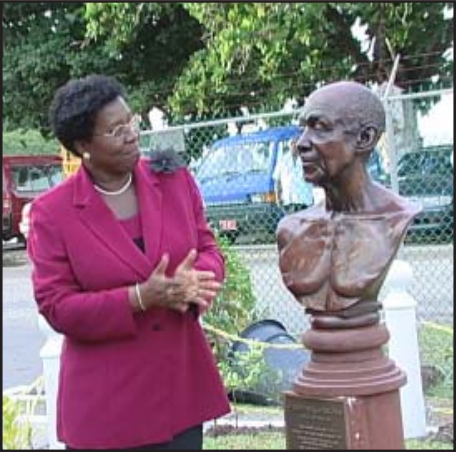
Governor General unveils burst of George F.L. Charles Tribute - page 2