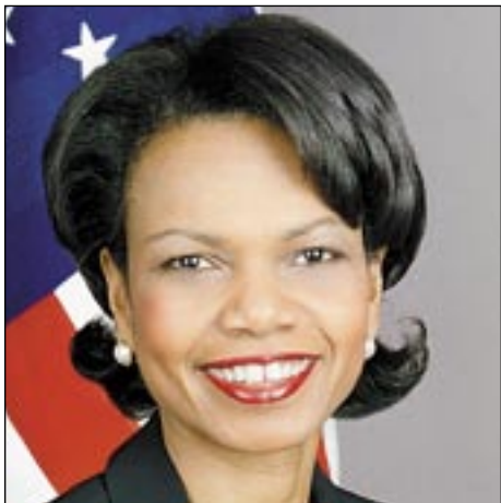
CARICOM meets US Secretary of State Condoleezza Rice - page 6