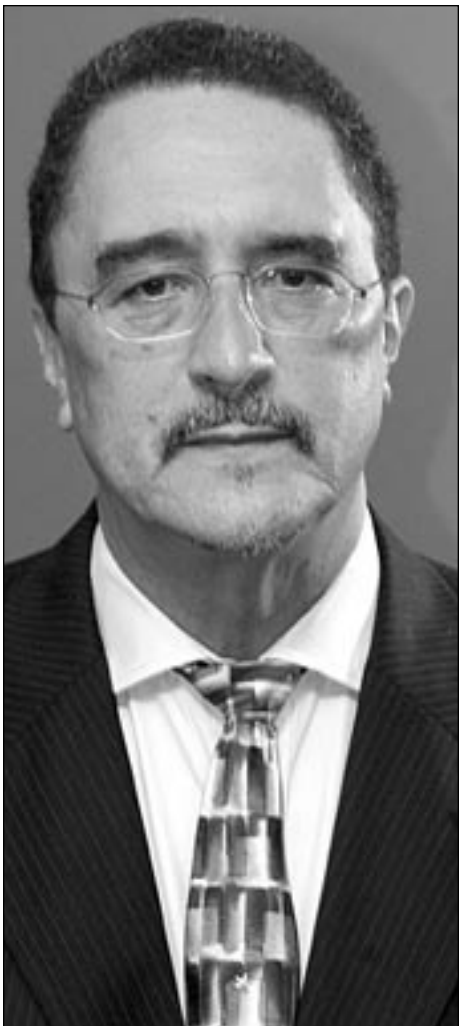
Prime Minister Dr. Kenny Anthony