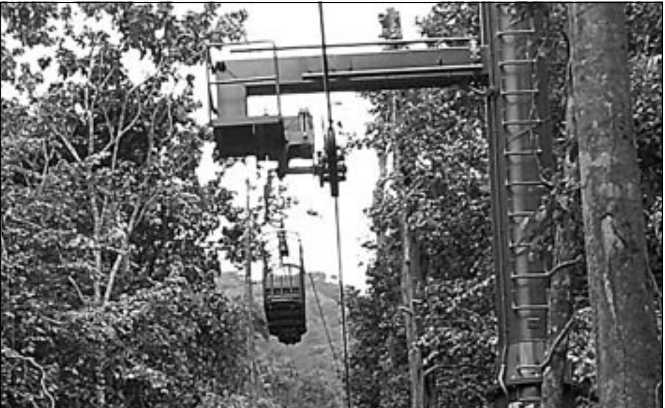
View of one of the trams

The Government's involvement in two events this week show that not only is it seized of the challenge but it is also rising to meet it. First on Tuesday, government ministers and officials participated in the official opening ceremony of Rain Forest Sky Rides - an aerial tram system that will present in