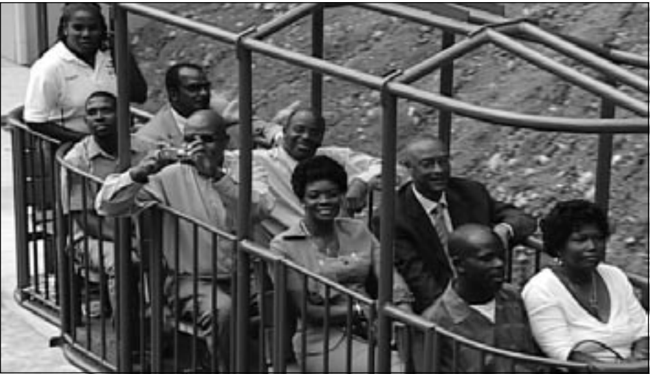
Government Ministers and other guests embarking on inaugural rides at the opening ceremony