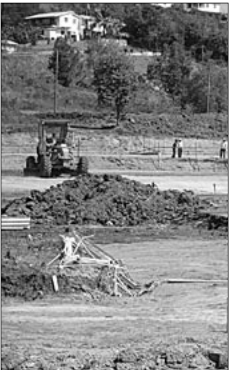
Construction on the site of the Gros Islet Secondary School