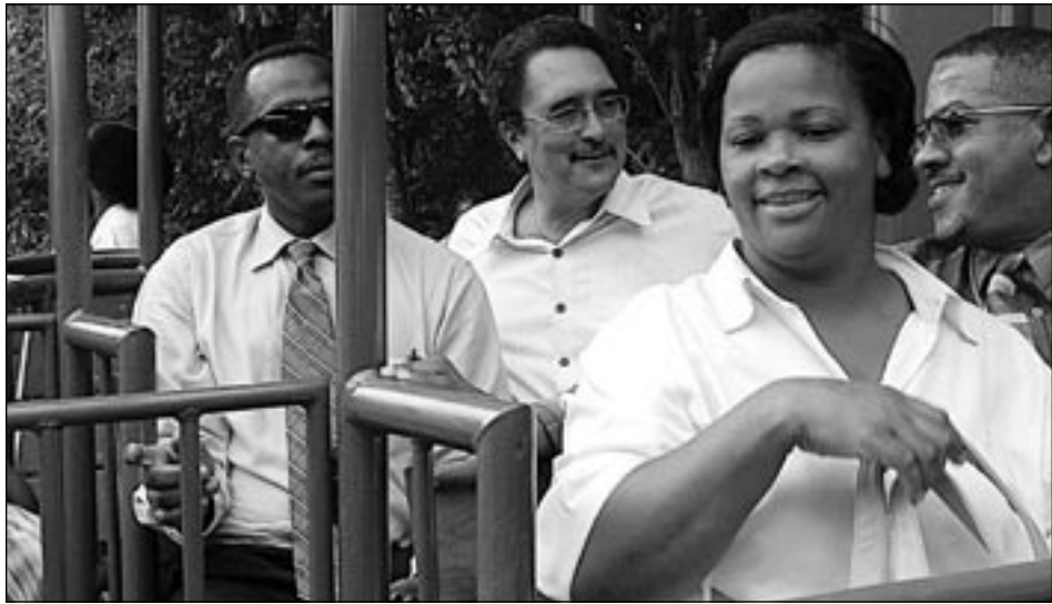
Tourism Minister - Philip J. Pierre

practical, workable policies that will allow for balanced growth and development in all economic sectors and development of adequate linkages between sectors. This is not easy as all sides seek to derive maximum benefits.