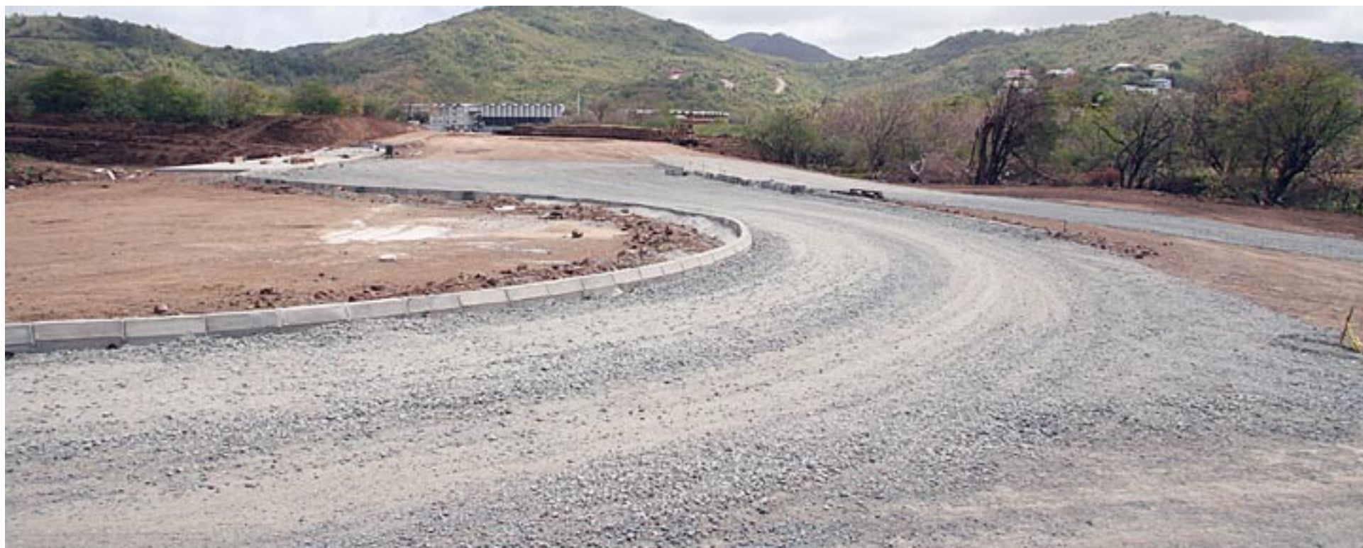
The new road to Beausejour Cricket Ground from the Gros Islet Highway under construction. This road will be critical to proper traffic management during CWC 2007.