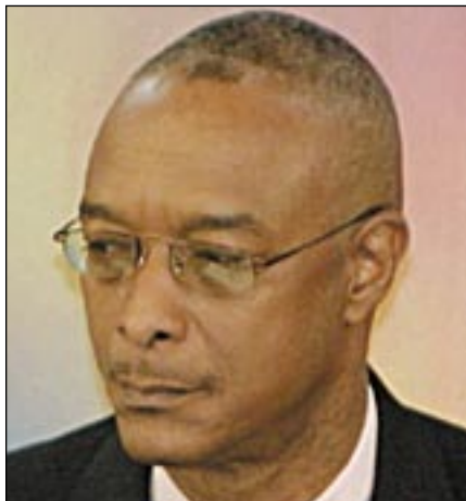
World Meteorological Day Message - page 7