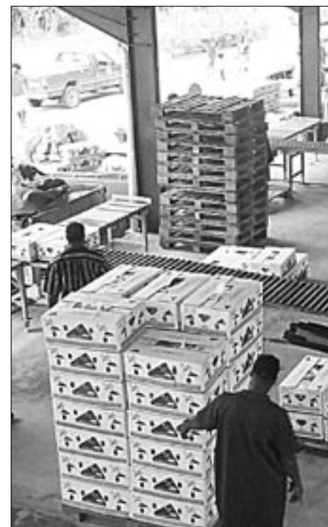
Boxing Wibdeco Bananas

The Directors are also pleased to announce the payment of dividend to shareholders amounting to EC$4.725 million. However, most of the dividend will be set against recent advances to the shareholder companies and other debts due from them to the WIBDECO.