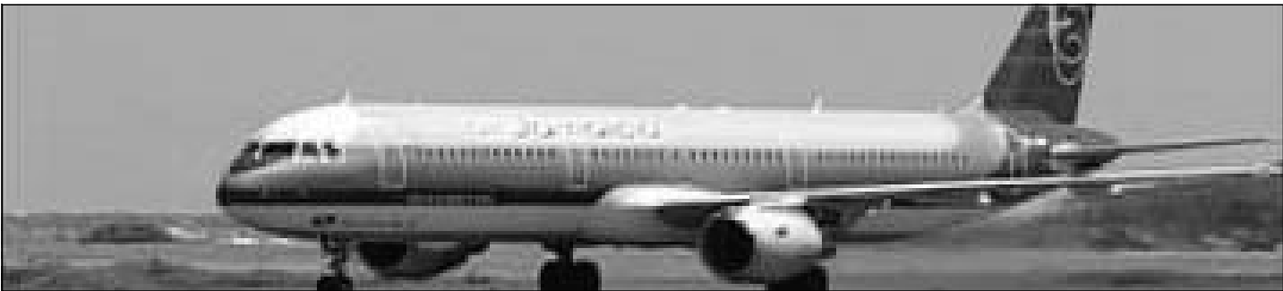
Air Jamaica landing in St. Lucia on resumption of the New York Service

A successful promotion on Z100, New York’s “number one hit music station”, has given Air Jamaica’s new non-stop service to St. Lucia a big boost in the marketplace. In February, Air Jamaica and Coco Resorts’ boutique hotels in the Rodney Bay area, offered free vacation packages to more than 100 lucky winners who experienced the wonders of the unspoiled Caribbean nation.