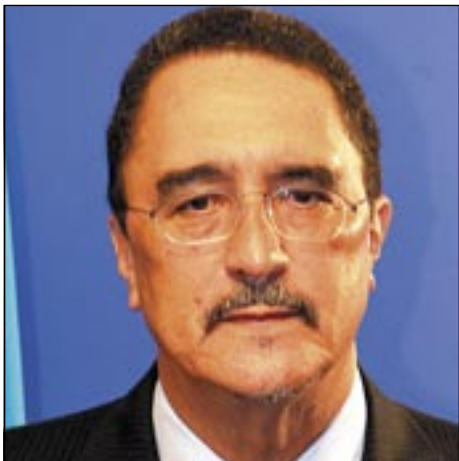
Labour Code to be Passed - page 3