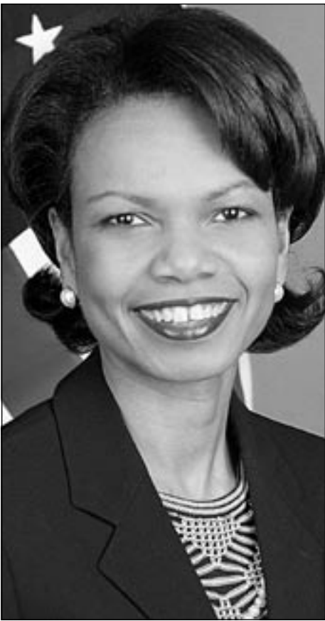
Dr. Condoleezza Rice US Secretary of State

The Ministers and the Secretary of State welcomed the recent resolution