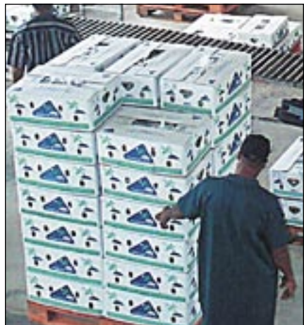
WIBDECO assists Banana Farmers - page 2

THE NEW RAIN FOREST SKY RIDE BABONNEAU PAGES 4 & 5