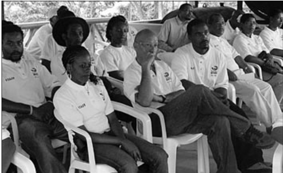
Some of the staff of Rain Forest Sky Rides at the opening ceremony

ered an address at the opening of a workshop on Regional Sustainable Tourism Planning Policy Development held in St. Lucia in which he outlined the St. Lucia Government's position on the use of the country's natural resources for tourism. In the following pages, St. Lucia Naionwide features the speeches and highlights from these two events indicating how Government is fashioning sustainable environmental tourism.