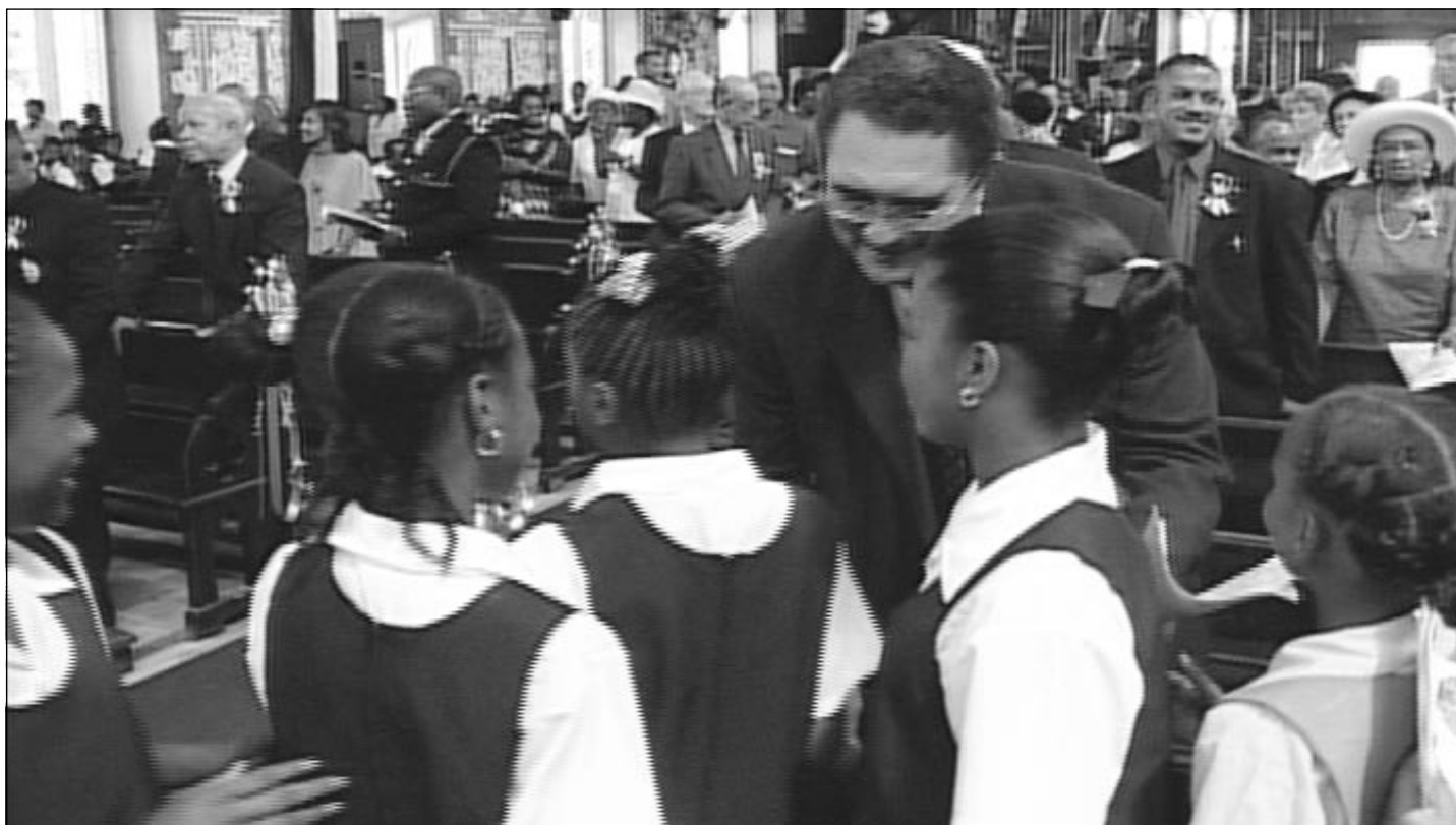
P.M Dr. Kenny Anthony meets students at the Independence Day Ecumenical Service

"C'est p[eyi] nous; Pouvwah se sa nous!" This is our country and the power is ours. Let's use that power to change for the better – always!