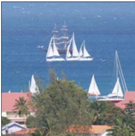
Caribbean Maritime Association Launched - page 6