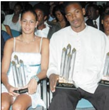
2006 Sports Awards - pages 4 & 5