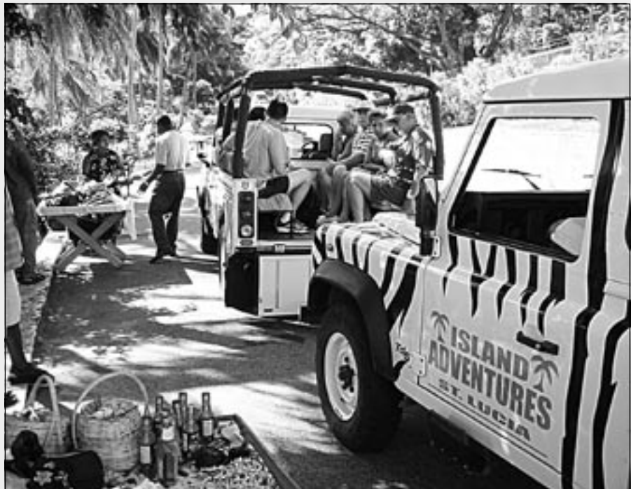
Heritage Tourism Activities

The ceremony was addressed by Par-liamentary Representative for Dennery South Honourable Damian Greaves and Minister for Tourism Honourable Philip J. Pierre. Minister Pierre reiterated his commitment to ensuring the decentral-ization of the tourism activity from the north to other parts of the island.