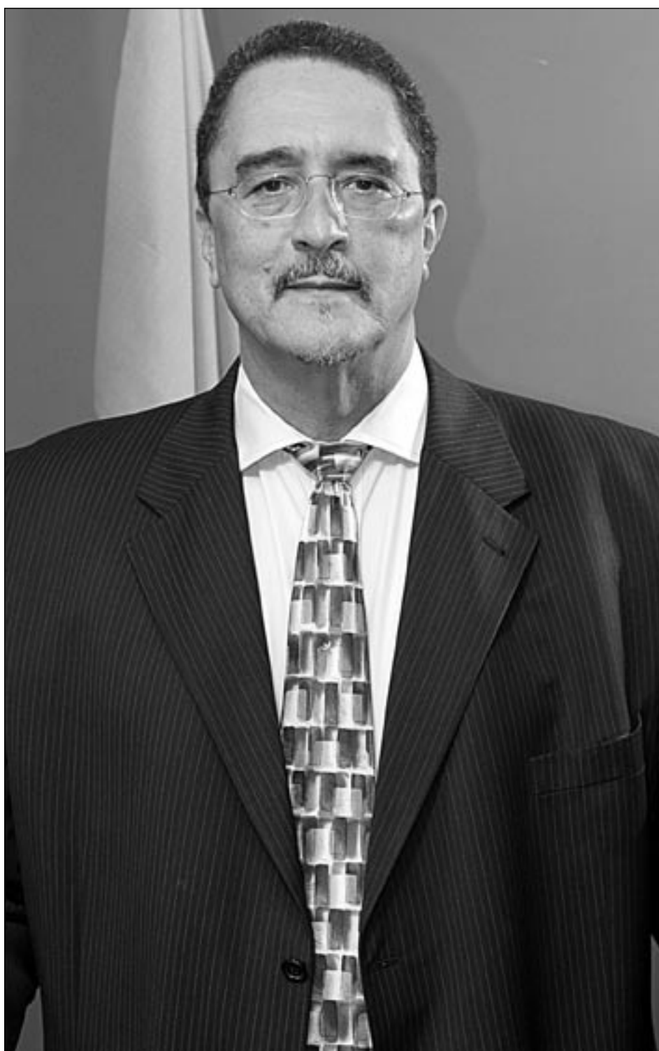
Prime Minister Dr. Kenny D. Anthony

Where others are celebrating the growth of civilizations, we are deciding who the St. Lucians of tomorrow will be. Yet, even as we shape our fu-