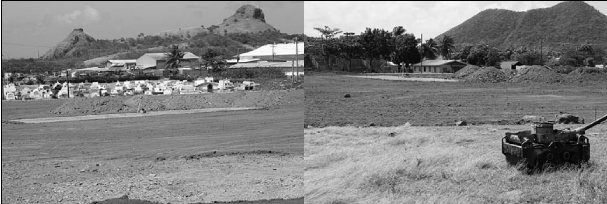
Work on the Gros Islet Playing Field which is to be used as a practice venue for the 2007 ICC Cricket World Cup