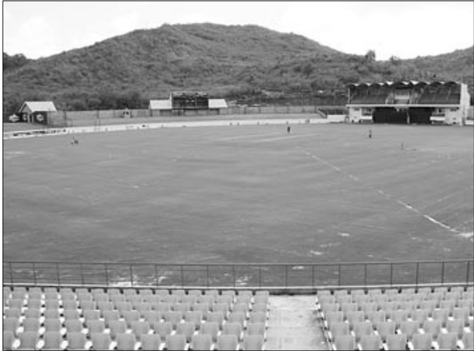
The Beausejour Cricket Ground