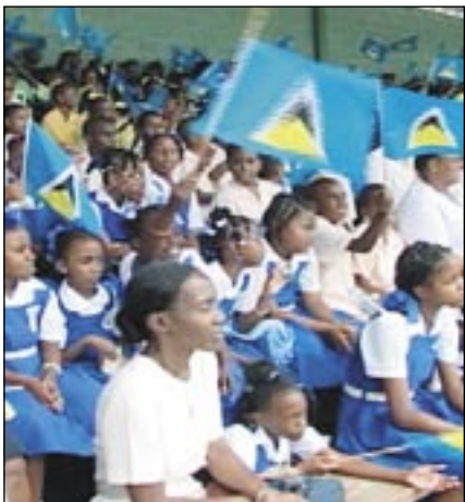
Independence Celebrations - page 2