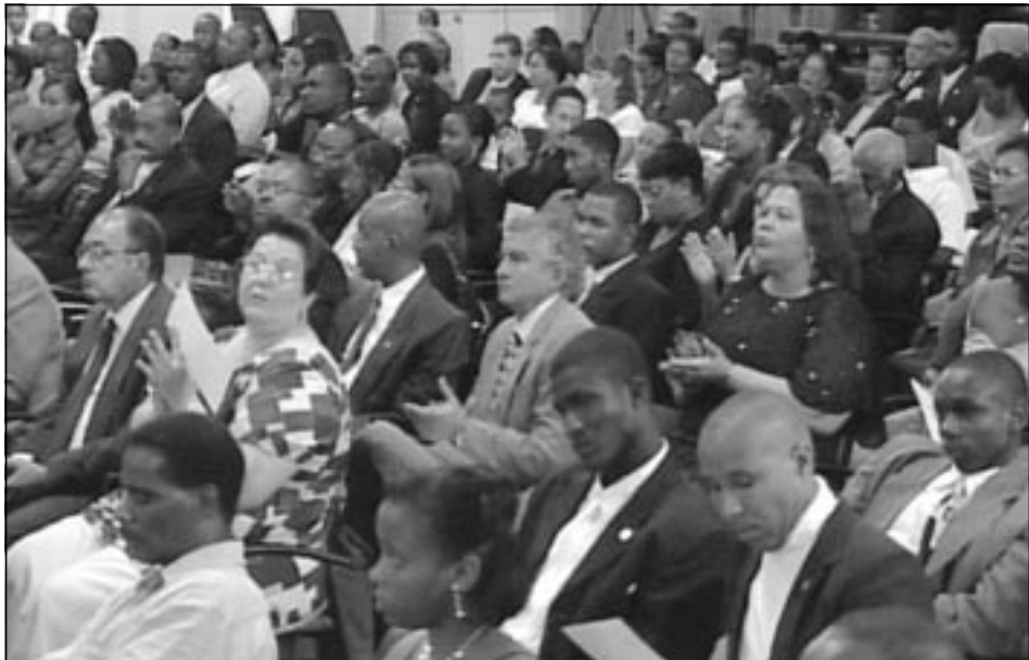
Section of Guests at the 2006 National Sports Awards