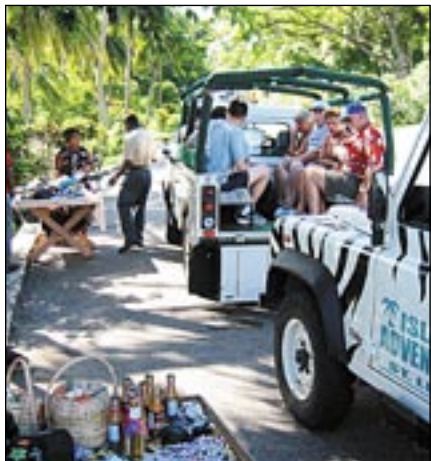
Heritage Tourism Programme Closes - page 7