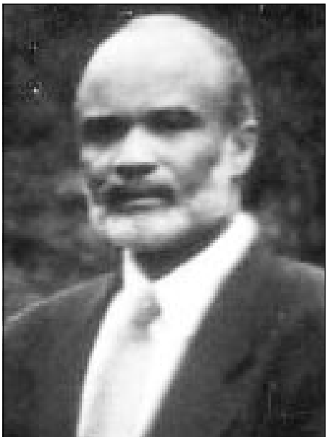
Mr. Rene Preval new President of Haiti

The Caribbean Community has welcomed the election of Rene Preval as the new President of Haiti. In a statement by the