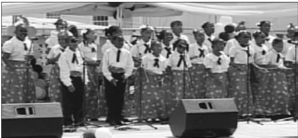
Students at the Independence Day Youth Rally