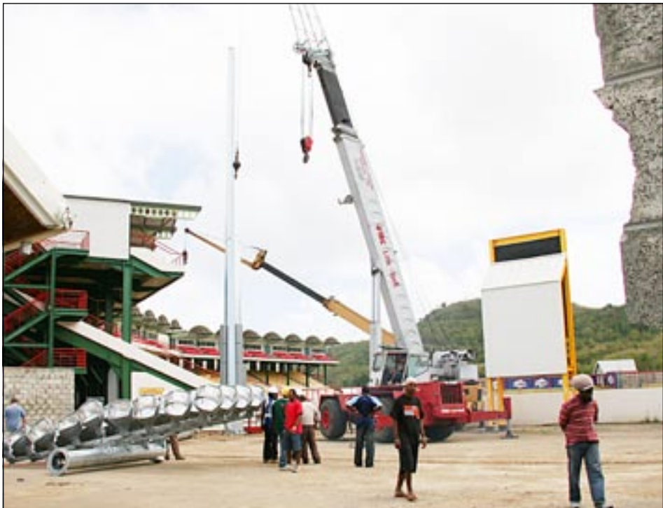
A crane about to lift the lights into position

The lights which will allow the staging of cricket matches at night at the Beausejour Cricket Ground (BCG) were being installed at the cricket stadium this week. Sometime last year the BCG authorities had announced that lighting facilities would be added to Beausejour to permit the playing of night matches making St. Lucia, the first West Indian country to be able to do so. The lights are expected to be used for the first time next month for two one day internationals between West Indies A and England A on the 9th and 11th March but they will be tested first at practice games early next week. The installation of the lights is part of the process of upgrading the Beausejour Cricket Ground for the hosting of matches in the ICC 2007 Cricket World Cup.