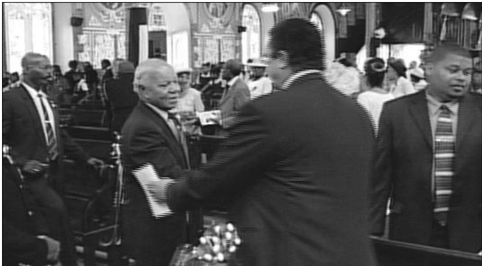
P. M. Dr. Kenny Anthony about to embrace former P. M Sir John Compton at Independence Day Ecumenical Service.