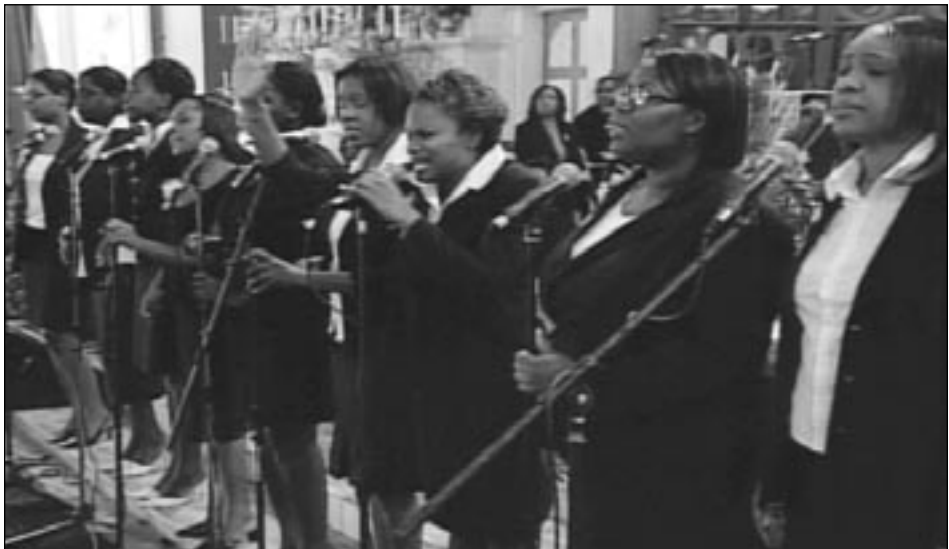
Singers at the Ecumenical Service