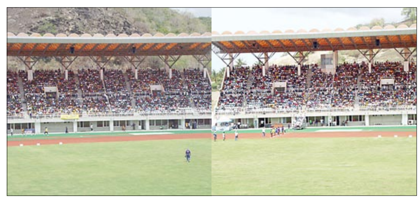
The Beasejour Cricket Ground

Information on Saint Lucia, which will host Group Stage matches as well as Semi-Final 2, in the 2007 Cricket World Cup in the West Indies, was in great demand at the World Travel Market held in London last week. The ICC Cricket World Cup 2007 family was out in full force during World Travel Market (WTM), showcasing the tournament and the nine Host Venues at the global expo for the tourism and travel industry.