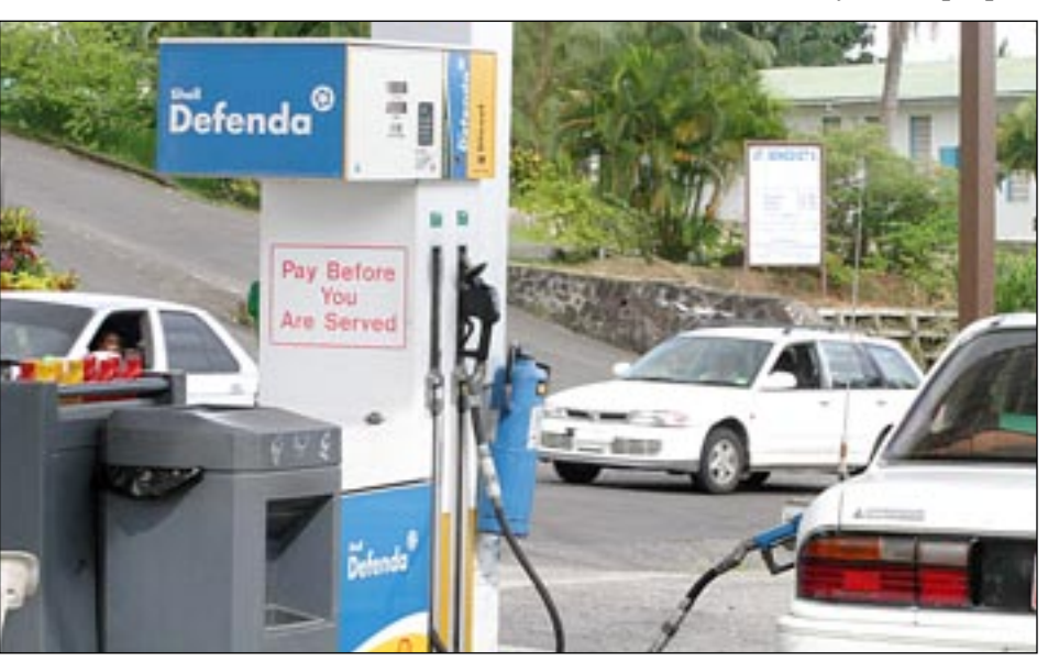
A petrol station

We all need to make an effort to use our energy resources carefully and wisely. Small actions, such as turning off a light can make a difference in the end. We should also be more selective and choose energy-efficient appliances in order to reduce our demand for electricity. We should also adopt energy conservation measures when we drive. For example, we should walk short distances, ensure that our tyres are proper-