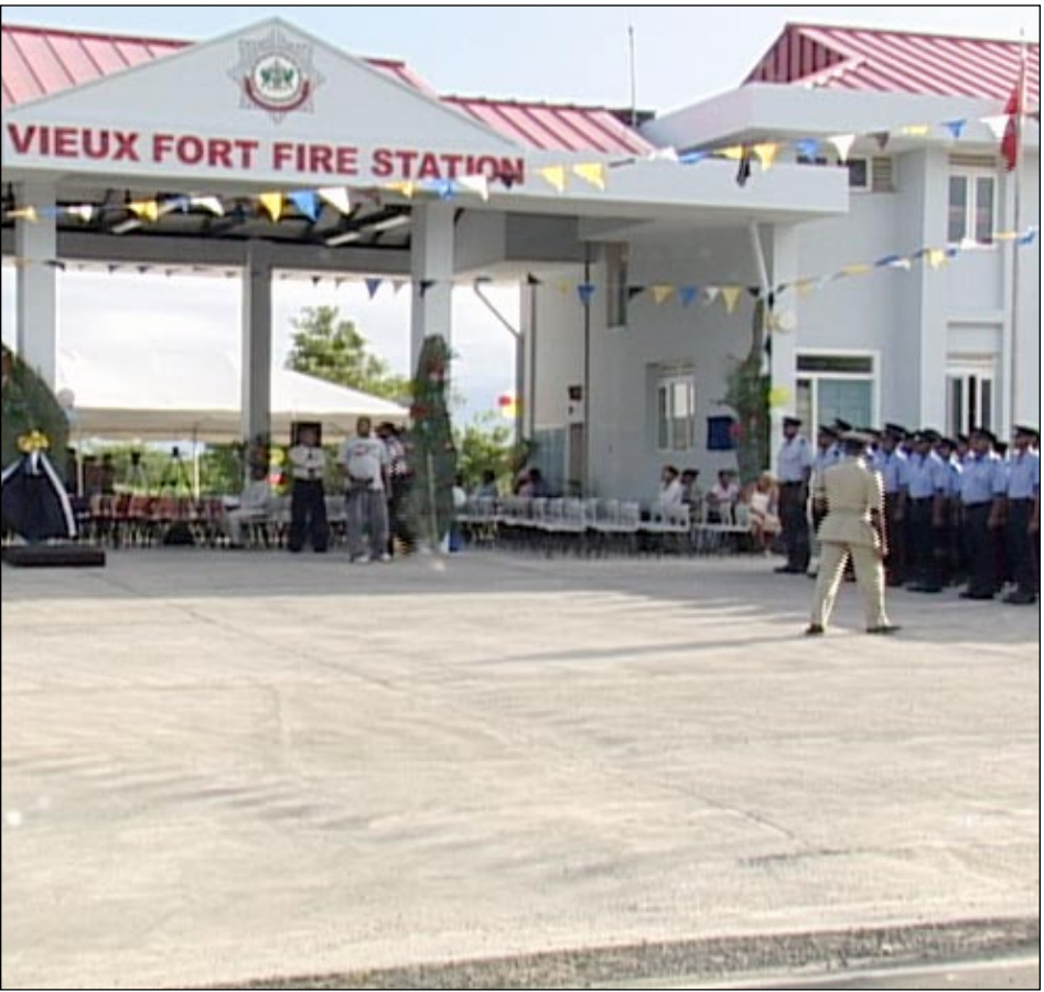
The recently built Gros Islet (left) and Vieux Fort Fire Stations