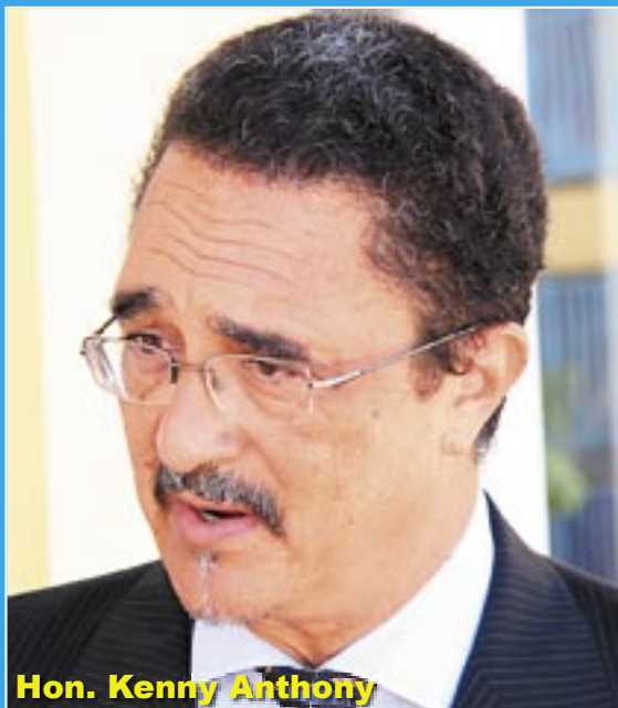
Hon. Kenny Anthony