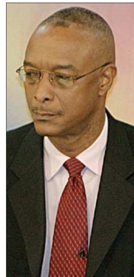
Hon. Felix Finisterre

The Minister went on to say that "it has not been easy to modernize that sector."