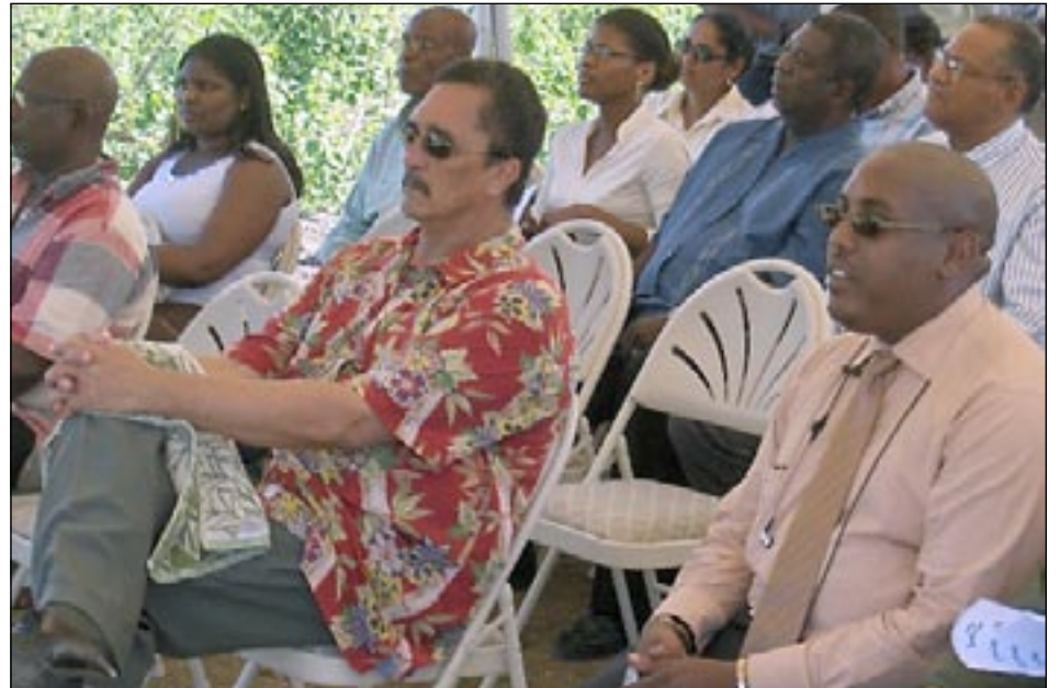
Parliamentary Representative for Vieux Fort South, PM Anthony ( centre) and NDC Managing Director, Wayne Vitalis (right) and other guests