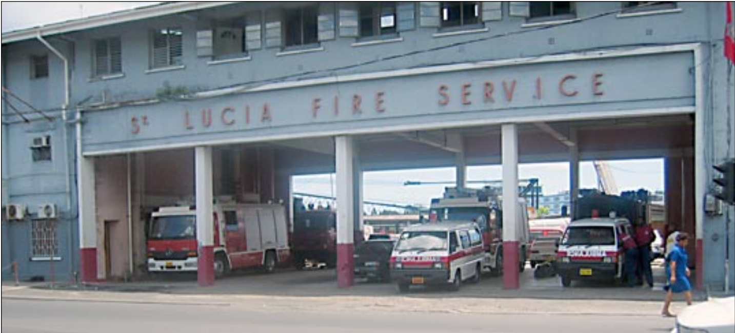
Castries Central Fire Station

The Deputy Permanent Secretary, Home Affairs and Internal Security apprised the Cabinet Secretary of the concerns raised and the latter indicated that the Collective Agreement which speaks to the issue of Excess Working Hours was on the Agenda scheduled for the Cabinet meeting of yesterday Monday 9th October 2006. This information was communicated immediately to the President of the Welfare Association by the Deputy Permanent Secretary of the Ministry on Saturday, October 7th 2006.