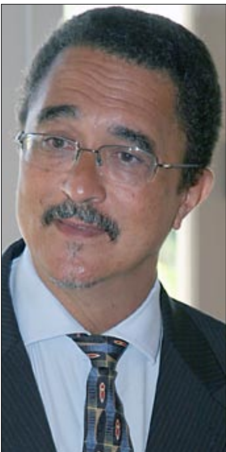
Prime Minister Anthony

The Prime Minister also advised the representatives of the fire officers that he had instructed the Ministry of Home Affairs to seek quotes from the Private Sector to replace the roof of the building housing the Central Fire Station on Jeremie Street in Castries. He advised, however, that the removal of the roof is