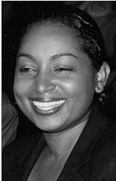
Hon. Menissa Rambally Minister for Social Transformation, Culture and Local Government

In the western hemisphere, we have created a phobia surrounding WTO, FTAA and the like that ensures that the real debate and decisions emanating from such discussions are confined to a select few, who know what is good for us all.