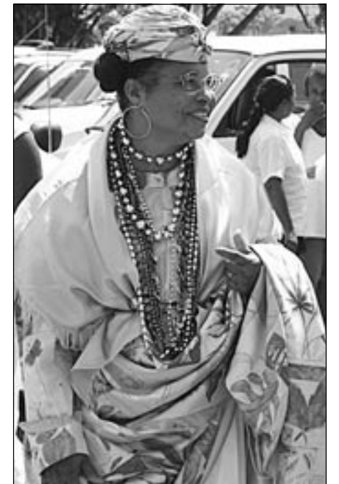
Women - preserving the rich cultural traditions

been affected by the restructuring, they feel the backlash in all its manifestations; from loss of income and resources available to satisfy the every day demands of the household, to the abuse that is often associated with the frustrations of the dislocated male farmer and land owner, all of which emanate from the loss of dignity.