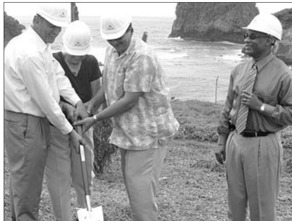
Breaking ground for new hotel project on the east coast

There is solid evidence that tourism-related construction activity industry is driving economic growth in St. Lucia.