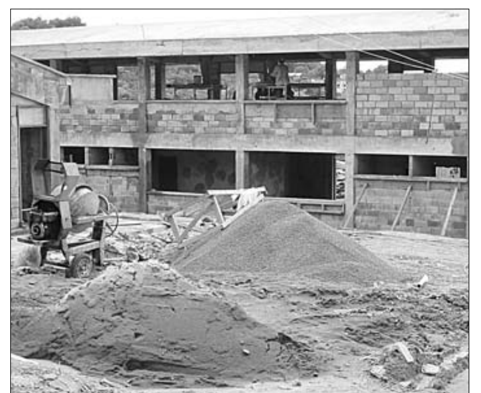
Construction sector will also call for more building materials

Until next week, do have a very pleasant and productive day, and God Bless!