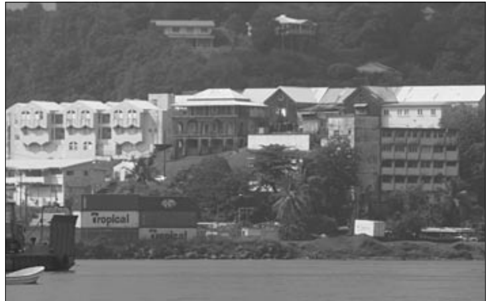
Victoria Hospital - Largest medical facility

The Universal Health Care Programme when established will ensure that Saint Lucians have access to quality health services, regardless of their financial status. The new system will be funded with a fixed consumption tax on goods. That proposed flat tax is a 3.5 percent - 4 percent increase on the environmental levy, which now stands at 1 percent - 1.5 percent. Basic goods such as food and clothing have been exempted. The tax will raise an estimated 30 million dollars, with government matching that amount as part of its overall contribution to health care.