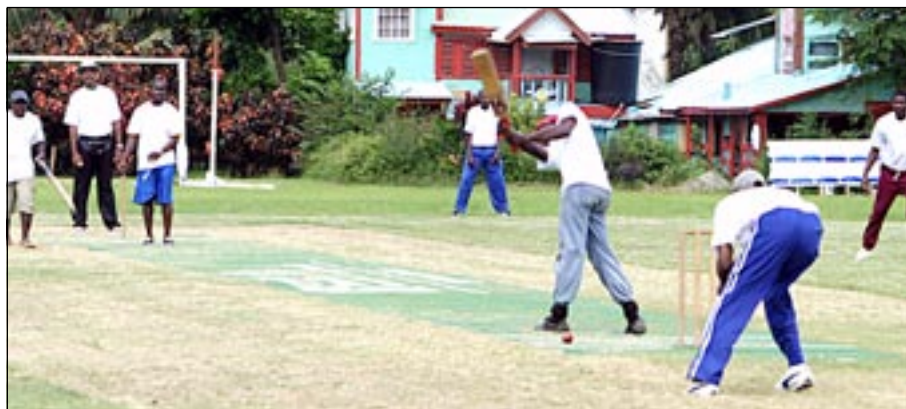
A Prime Minister's Team faces Media and Communications Team on one of the all weather roll-out cricket pitches presented by Cable and Wireless Ltd. in support of cricket development in the Caribbean