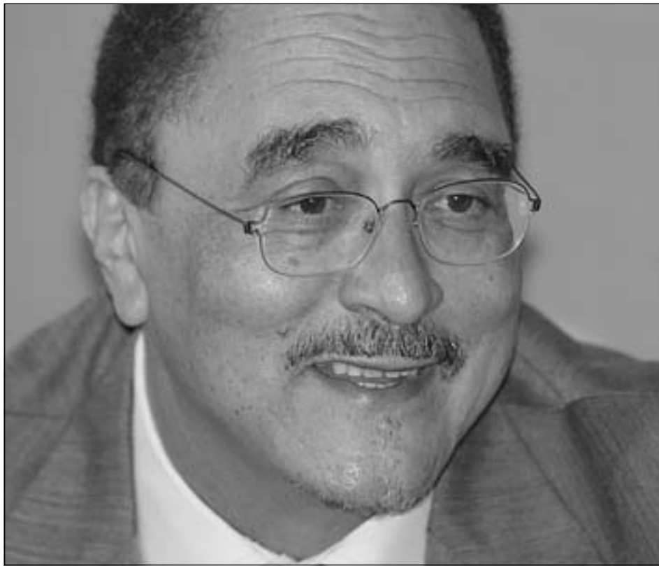
Prime Minister of Saint Lucia Dr. Kenny D. Anthony

As the Eastern Caribbean Central Bank (ECCB) reported last month, the positive growth rate in St. Lucia – and indeed in the rest of the OECS – has been driven largely by construction and expansion in the tourism industry. The Central Bank has also predicted that, barring unforeseen or uncontrolled events like natural or man-made disasters, the growth rate in St. Lucia and the rest of the OECS will continue to be driven and fuelled by further growth in tourism and construction. Much of the growth in construction is explained by the construction of infrastructure for the hosting of the Cricket World Cup in 2007. Indeed, the Central Bank estimates that the region's economies, including St. Lucia, will collectively grow by 5.6% this year. An even higher growth rate of 7% is forecast for next year, 2006. If that happens, then this will be the highest growth rate achieved by the OECS in over a decade.