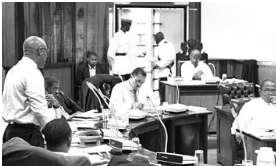
Hon. Damian Greaves addressing Parliament

T he Saint Lucia House of Assembly has approved the WHO Framework Convention on Tobacco Control Bill, which creates the necessary social environment for the implementation of the convention signed in 2004. The decision means the Government of Saint Lucia has given it official legal backing to the World Health Organization (WHO) Convention dealing with the control of tobacco and the effects resulting from its use