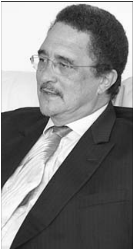
Hon. Kenny D. Anthony

However, we must not lose our focus on the other sectors. While we continue to do all we can to encourage the diversification of our agricultural base, the expansion of our tourism sector and the continued viability of our manufacturing sector, we must also continue to build