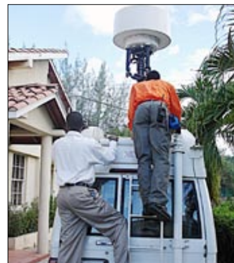
Technicians operating the spectrum equipment

Five countries – The Commonwealth of Dominica, Grenada, St. Kitts and Nevis, Saint Lucia and St. Vincent and the Grenadines are members of ECTEL.