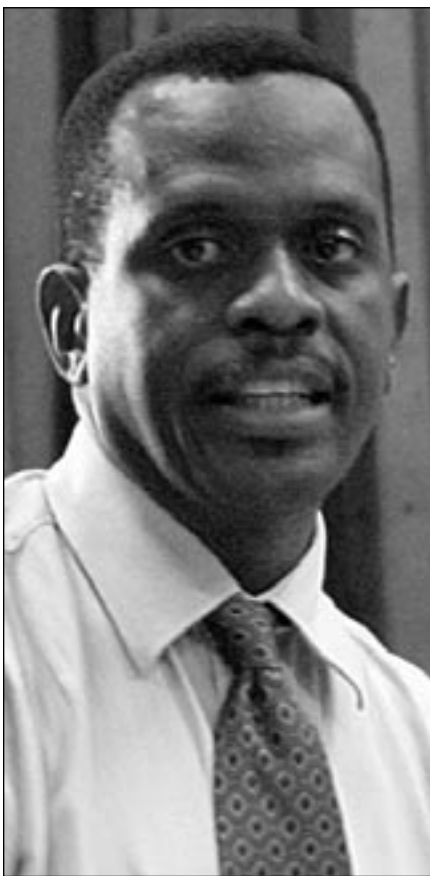
Hon. Philip J. Pierre MP for Castries East

M ember of Parliament of Castries East and the Japanese Ambassador to St. Lucia on Wednesday last week officiated at a ceremony to mark the completion of a community access road in Castries East.