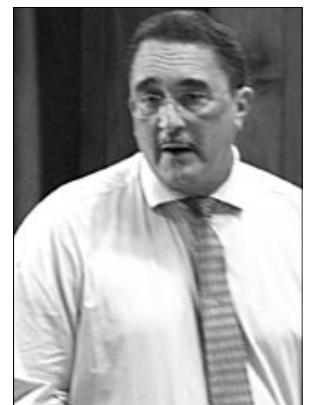
Prime Minister Dr. Kenny Anthony speaking at the House of Assembly

"ASYCUDA ++ will now allow us to have a better sense of the movement of goods as they come into the country," says Dr. Anthony. He told the House, "via the system, you will not only be able to make the necessary projections and have a clearer sense of revenue intake down the road, but more importantly the fin-