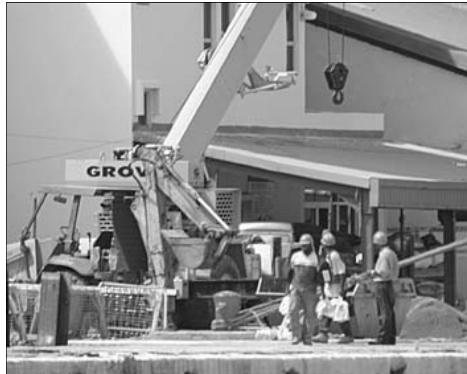
Worker at Port Castries

The construction boom in the private sector will be matched by major expansion in construction activity in the Public Sector. Consider for a moment the following. Drainage projects are under way in Dennery, Castries and Anse La Raye. Health centres are undergoing major repairs. A school repair and expansion programme is under way. Construction of two new secondary schools will commence before the end of the year. Construction of the new psychiatric hospital is due to start