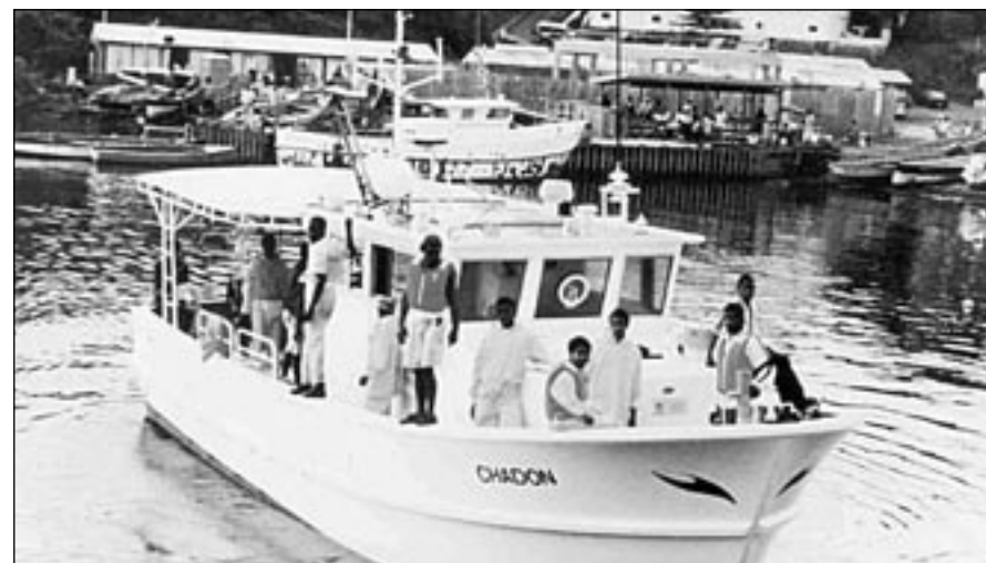
Modernization of the fisheries sector

Fisheries have been considered the lifeblood of coastal communities in Saint Lucia, contributing in excess of 19 million EC Dollars to the island's economy. Recognizing this valuable contribution, government has provided incentives to the industry through duty free concessions on boats, engines, equipment and other related materials. The incentive package which is estimated at three million dollars annually also includes a 75cents per gallon fuel rebate to fishers.