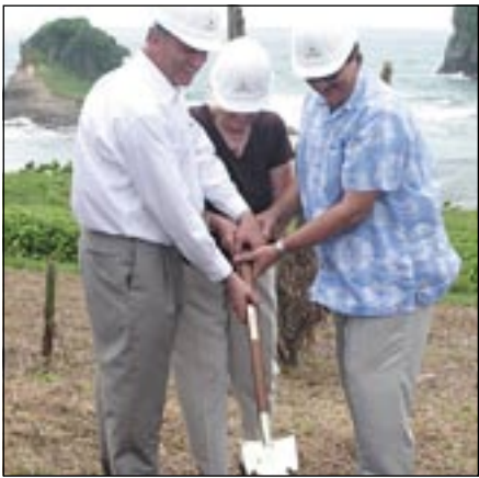
Will there be enough construction Skills - pages 4 & 5