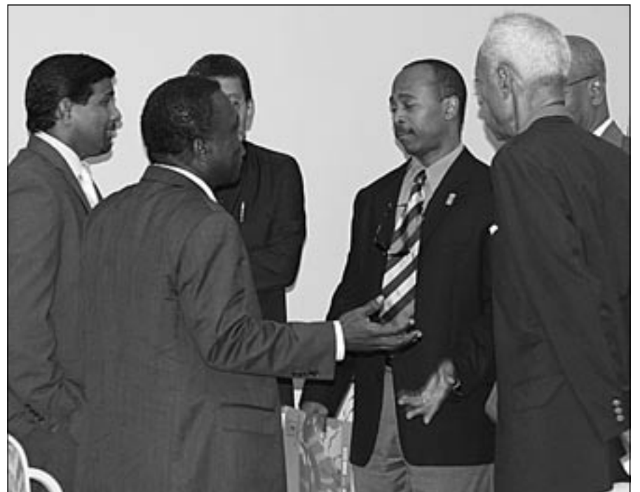
Prime Minister Dr. Keith Mitchell of Grenada with cricket officials

M embers of the West Indies Cricket Board, representatives of West Indies Players Association and CARICOM leaders met in Saint Lucia on Friday November 04th to discuss a wide range of issues related to the development of West Indies cricket. Among the topics discussed were the governance of West Indies cricket, mechanisms for dispute resolution and greater involvement of the West Indian public charting the way forward for West Indies Cricket.