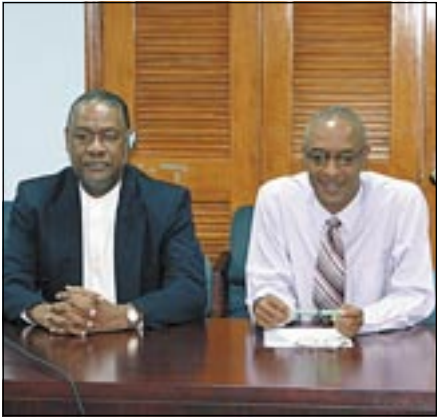
Improving Access in Telecommunications - page 2