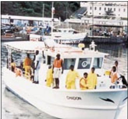
OECS Countries Consolidate Fisheries - page 7