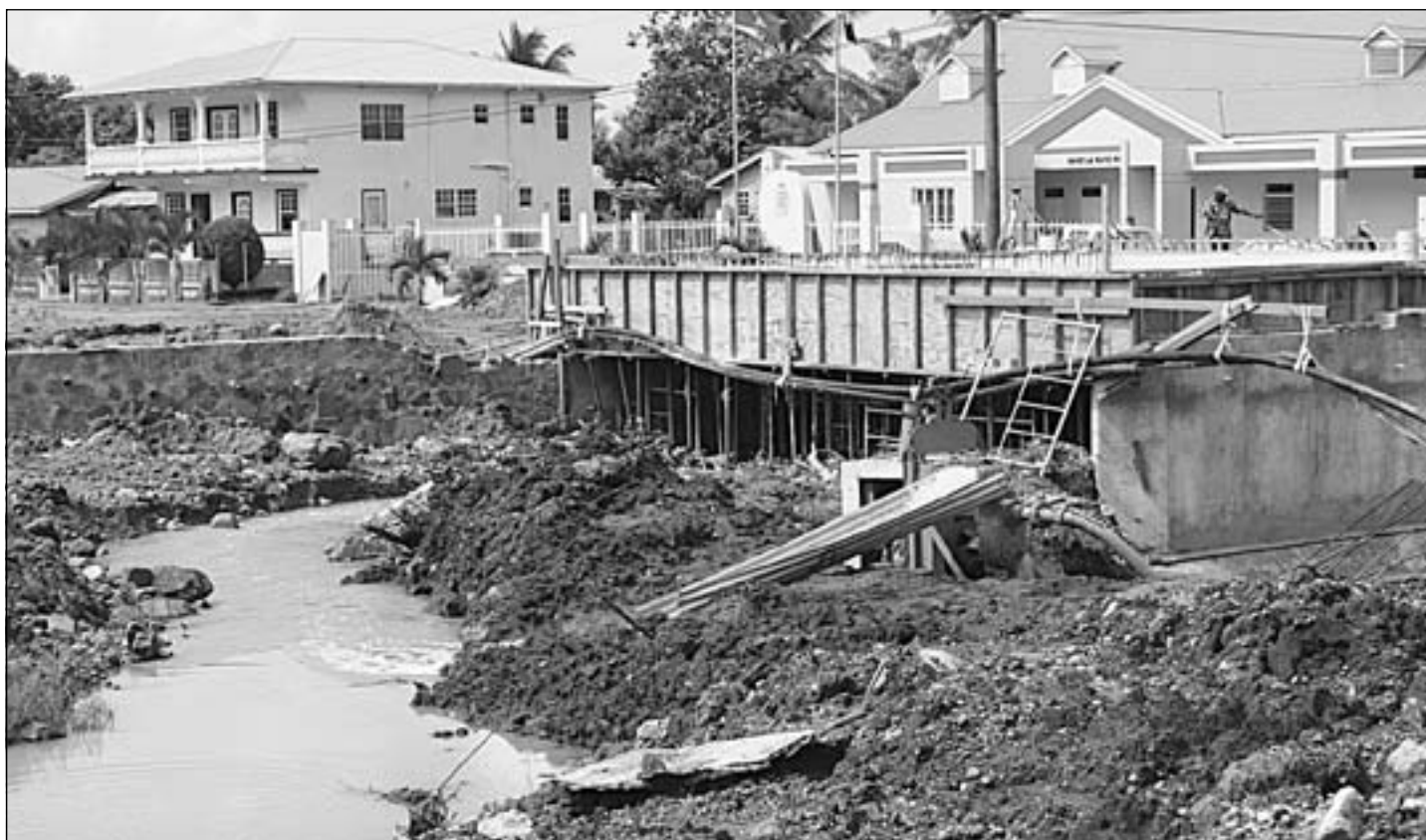
Public sector workers