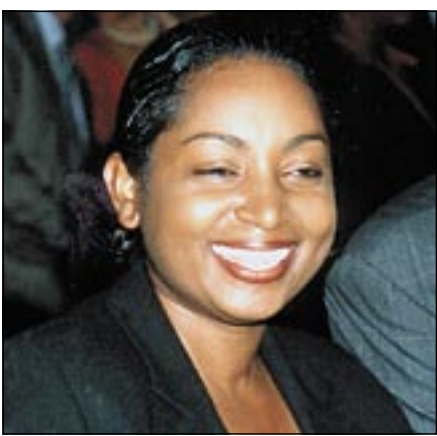
Trade Regimes on the status of Rural Women - pages 6 & 7