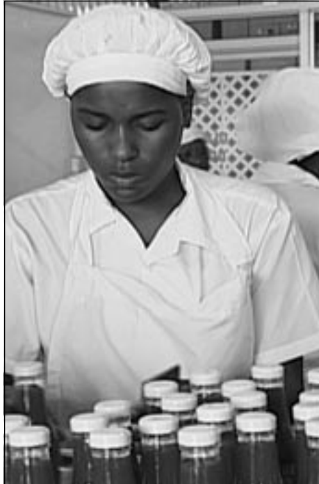
New employment in the manufacturing sector

There is no doubt that on balance trade regimes in their various guises