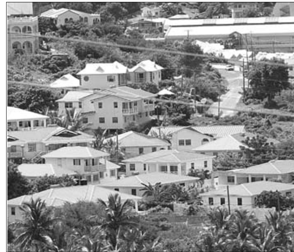
Expansion of residential housing - more skills required

ing to the basic principle of supply and demand, then as the supply of jobs increases in the months ahead, so will the demand be reduced? We cannot begin