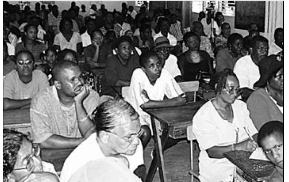
Rural women participate in communities discussions

I look forward with eager anticipation and optimism to our discourse.