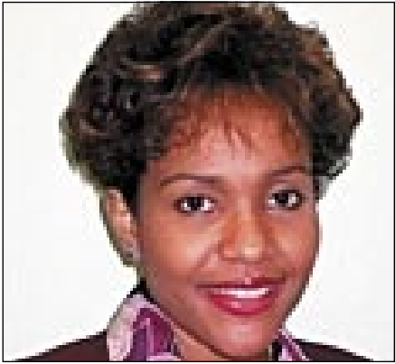
Quality Assurance in Health - A Priority - page 3