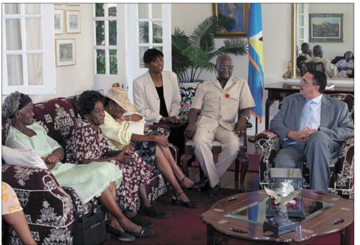
Prime Minister Dr. Kenny Anthony meets senior citizens, some of whom wore medals at the recent regional games in Barbados

The Terms of Reference of the Commission give it two years to complete its work, which will commence immediately following its official launching.