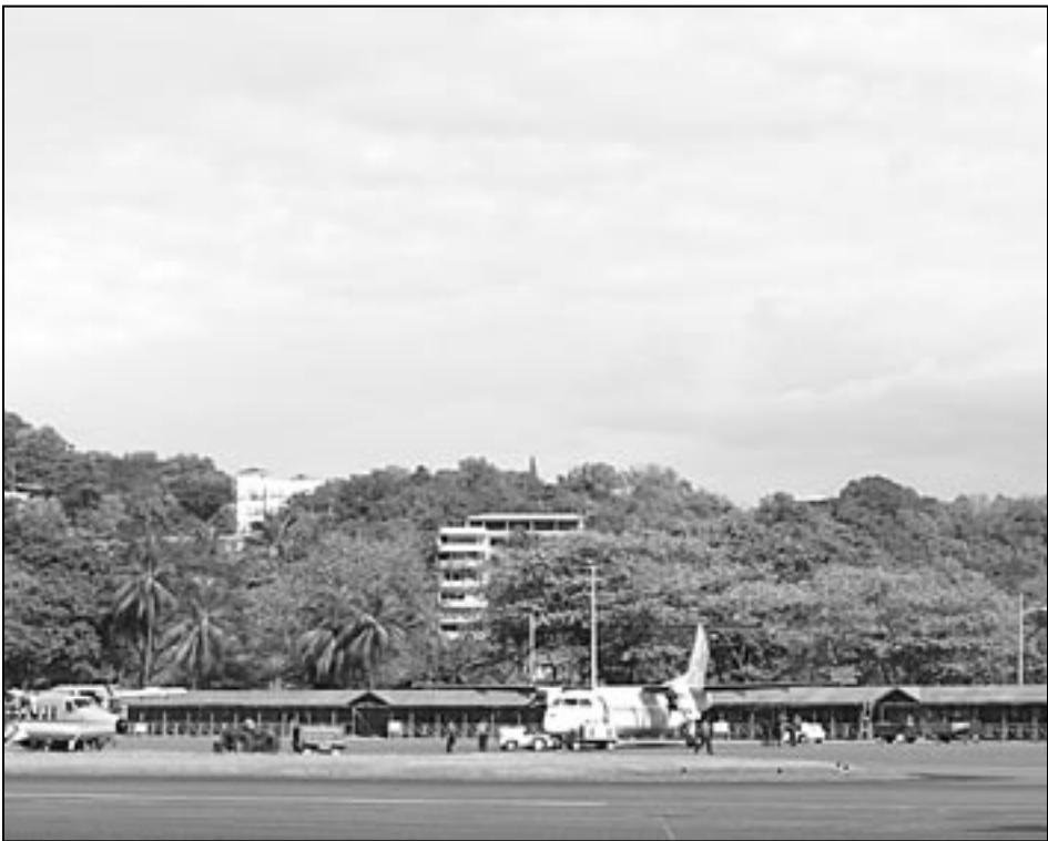
Sir George F.L. Charles Airport, Vigie, Castries