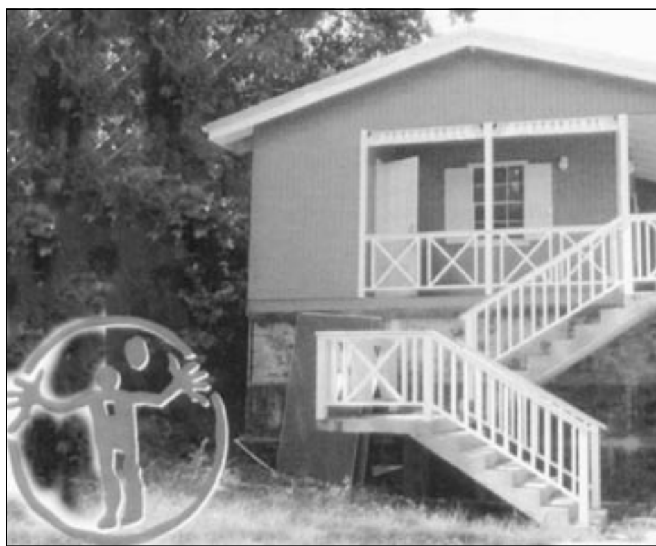
New Child Development and Guidance Centre

T he Child Development and Guidance Centre will be moving into its permanent home, following the official opening of a new structure on Friday, March 4, 2005. The building is located on the premises of the Donator School at Lapansee. The centre was established in 1998 as a non-profit organization formally operating out of the Donator school.