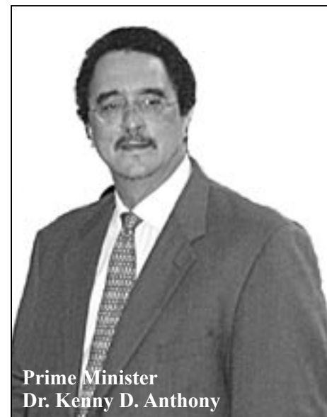
Prime Minister Dr. Kenny D. Anthony