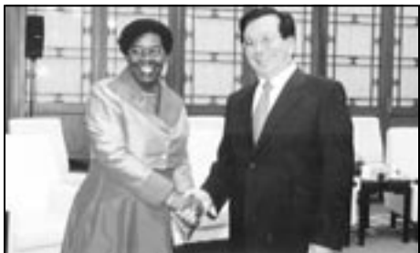
Governor-General meets China's Vice President, Zeng Qinghong

M embers of the St. Lucia-China Friendship Association will gather on Monday for their first Annual General Meeting since its establishment one year ago.