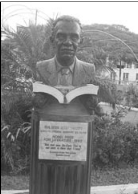
Bust of Derek Walcott

For those who have died, the FRC will be identifying their graves, and plans to place appropriate markers on the final resting places of those who