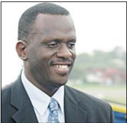
Reduce Bank Fee - Hon. Phillip J. Pierre page 1 & 8