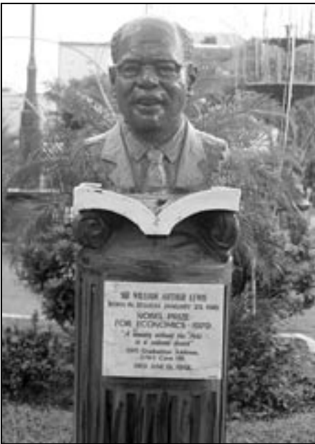
Bust of Sir Arthur Lewis