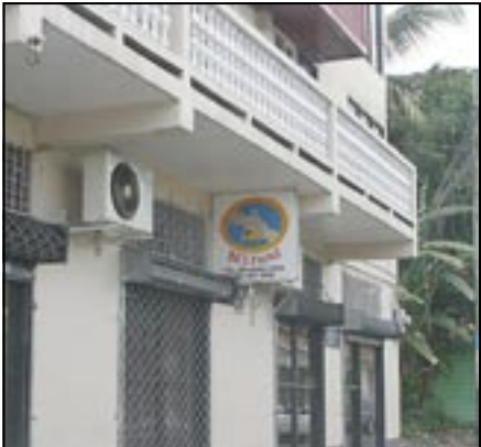
BELFUND making a difference - page 3