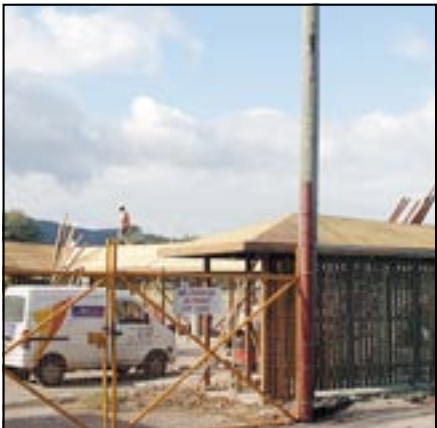
Vigie Airport getting ready for CWC 2007 - page 2