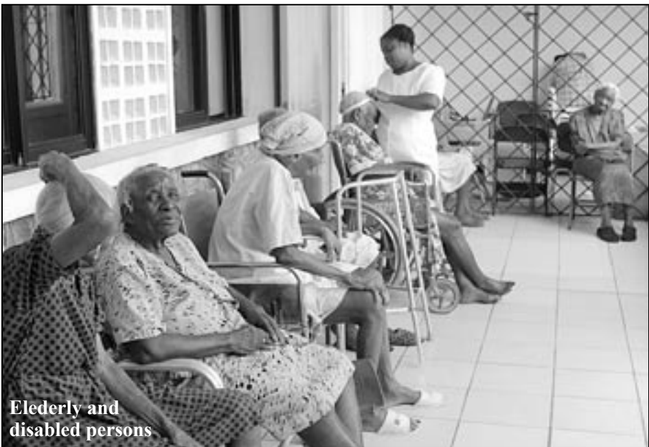
Elderly and disabled persons

The categories now exempted include: “A person who provides evidence that his or her name appears on the Government’s Public Assistance Record” or “a person with a disability who shows evidence, or who, in