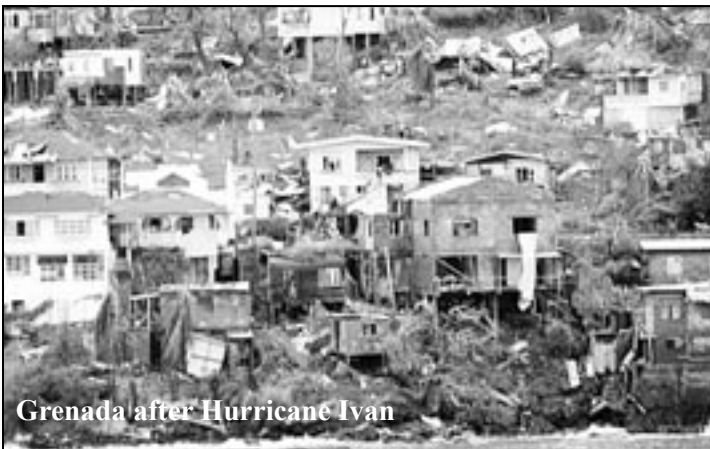
Grenada after Hurricane Ivan

the Caribbean Development Bank; the Caribbean Environmental Health Institute; the Caribbean Epidemiology Centre; the Caribbean Institute for Meteorology and Hydrology; Caribbean Tourism Organization; Insurance Association of the Caribbean; Organization of Eastern States -Environmental and Sustainable Development Unit; the Seismic Research Unit; the University of the West Indies and CARDI.