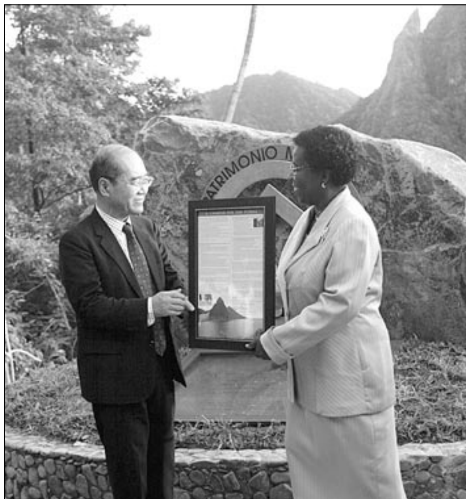
Governor-General, Dame Pearlette Louisy presents Charter for the Pitons to Mr. Koichio Matsuura, UNESCO's Director-General

The winning logo will be presented to the public, through a media launch to be staged shortly.