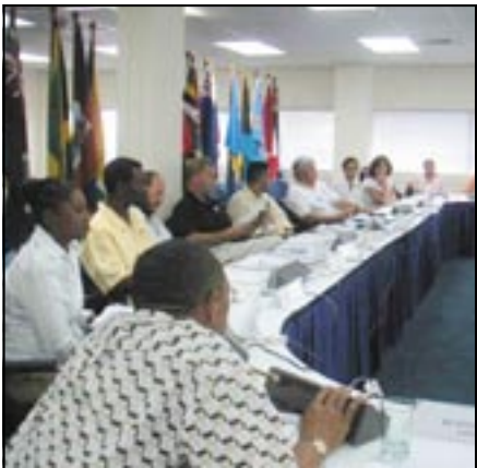
New Caribbean Marine Association coming - page 8