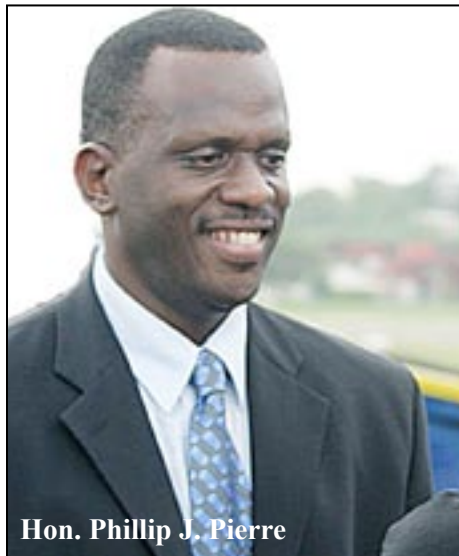
Hon. Phillip J. Pierre