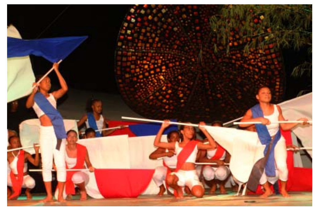
A scene from the Independence Eve gala.

Our diplomatic service, although small, has been very effective in promoting, defending and articulating the national interest abroad. Through its efforts we have been able to forge relations with friendly governments and countries that share our ideals and find our principles noble.