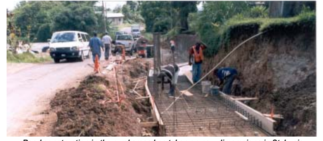
Road construction in the rural areas has taken on new dimemsions in St. Lucia

The Tertiary Roads Rehabilitation Project was conceived as part of the Government's commitment to provide appropriate road infrastructure to support economic activity in all sectors, with particular bias on tourism and agriculture. Some 55 major roads all around the country will receive attention under the programme.