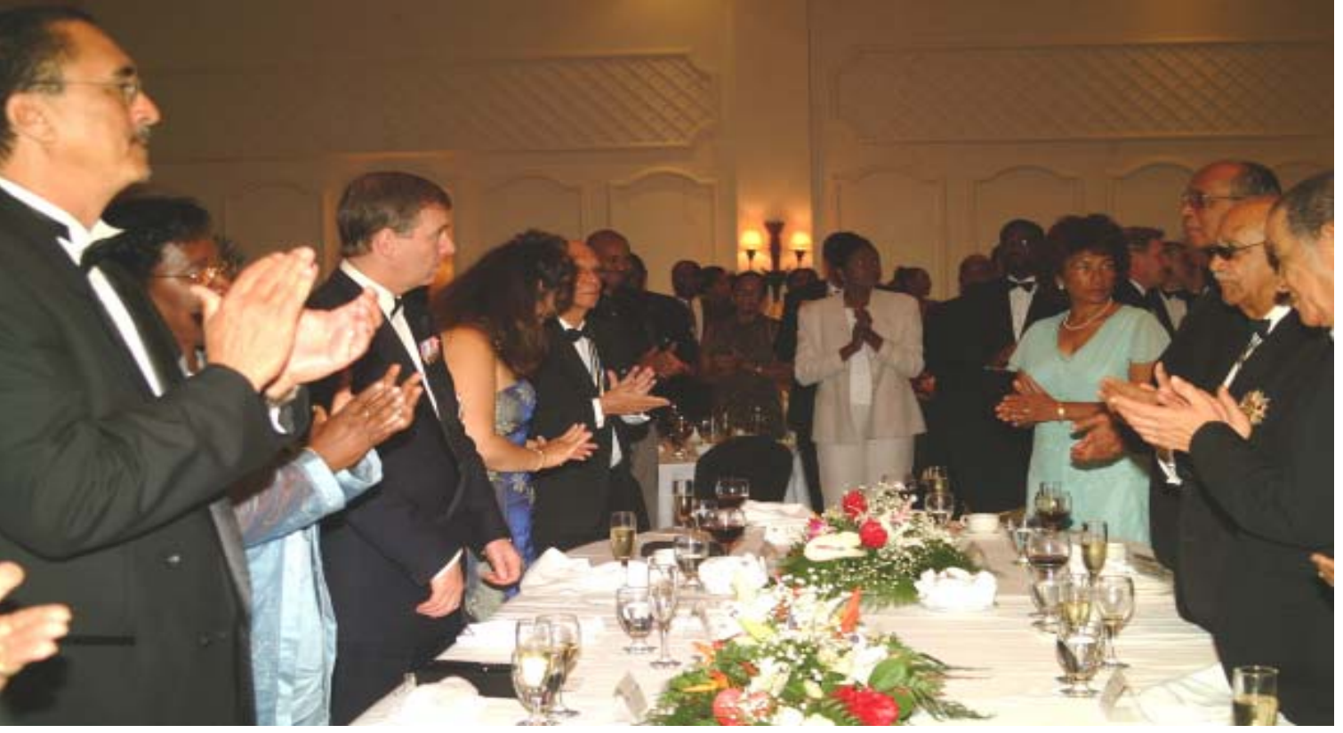
His Royal Highness the Duke of York flanked by past and present state and government leaders of Saint Lucia

have become a new people of hope and possibility, crowned twice with the laurels of the highest intellectual achievement in Derek and Sir Arthur and today presiding over the general conference of the world's nations.