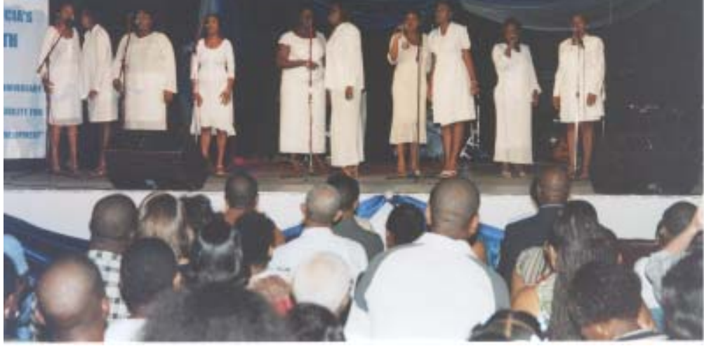
"Special Blend" on stage at the concert of Prsise and Inspiration.

Passing on the flag from the present to the next generation of leaders.