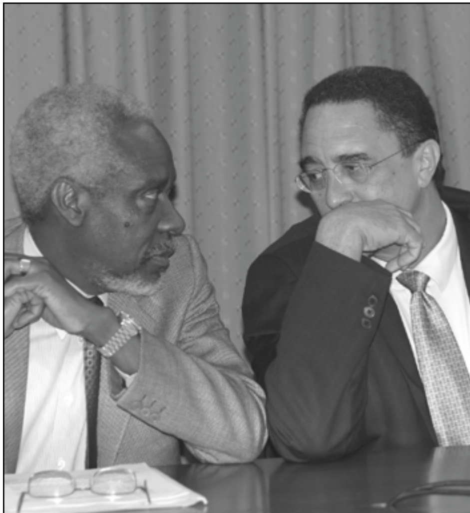
P.J. Patterson and Dr. Kenny Anthony are very strong supporters of CCJ