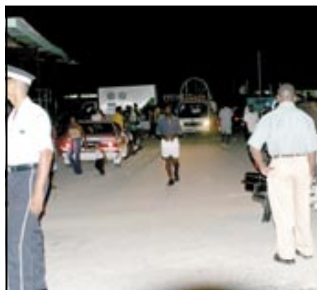
Police has crowd under control