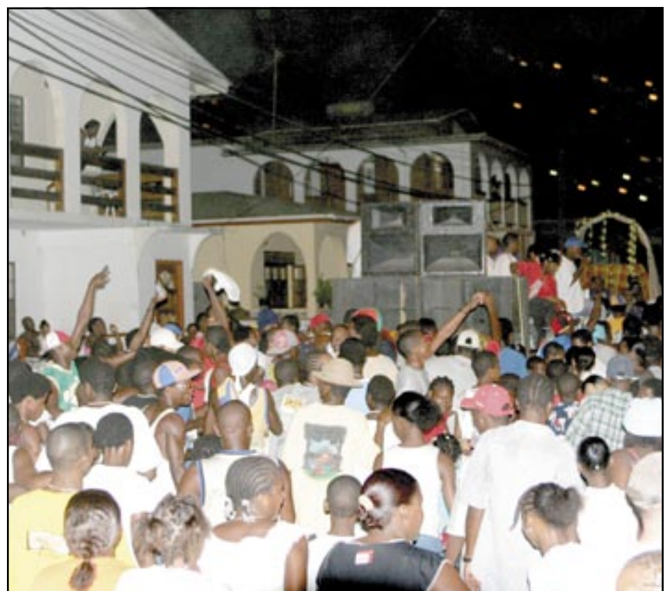
Last Tuesday's Celebrations