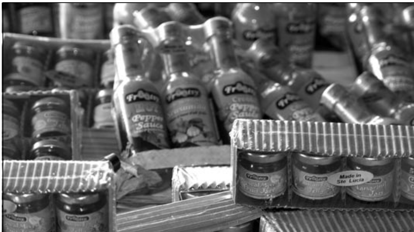
Frosts brand of local products

The exposition will showcase an array of products and services available in Guyana, including agro processed foods, rums and beverages, pharmaceuticals, furniture, forestry, mining, tourism, and information technology. It will also include a seminar on "Doing Business in Guyana", one on one meetings with Manufacturers and visits to manufacturing operations in Guyana.