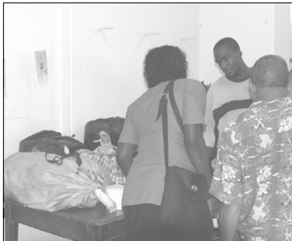
Journalists examine drugs confiscated from Wilton's Yard raid

Everyone knows the link between drugs, guns and crime. The drug traffickers need to protect their ill-gotten gains from firstly the Police, and secondly, from other gangs. They trade drugs for guns. These gangs know one language – death. The drug lords recruit young men and arm them with guns to enforce their will and bidding. They become consumed with their power and in no time seek to enforce their will on those around them. Young people murder each other for their masters – the drug lords and barons. Is it little wonder that the majority of murders these days are drug-related?