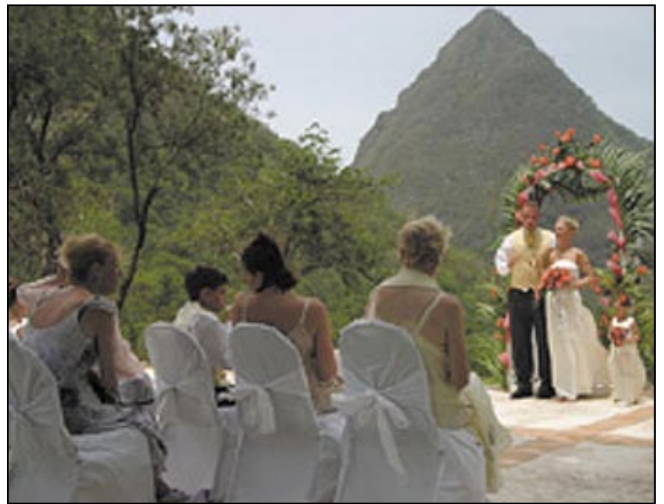
Pitons on World Heritage List

The soup kitchen was established in June this year, and now caters for 45 needy residents.