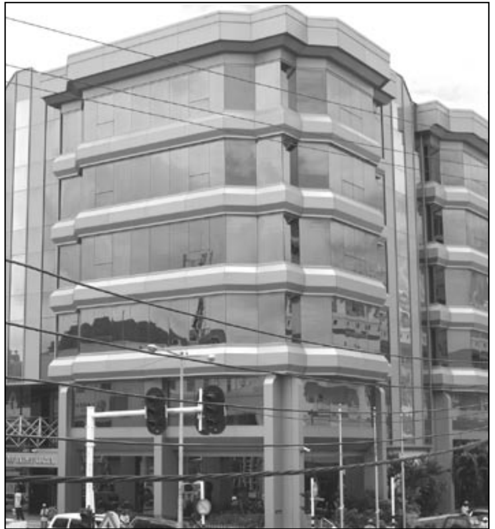
Bank of Saint Lucia on Bridge Street

There are still opportunities available for accessing grant funds in support of Human Resource Development, especially for persons already employed and are willing to enhance/improve their skills through training and or complementary studies in local institutions.