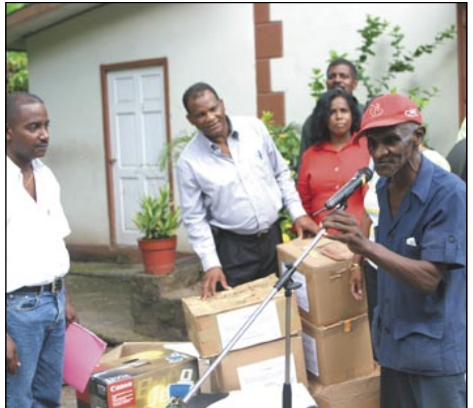
Malgreoute Home for the elderly gets gifts from Guadeloupe