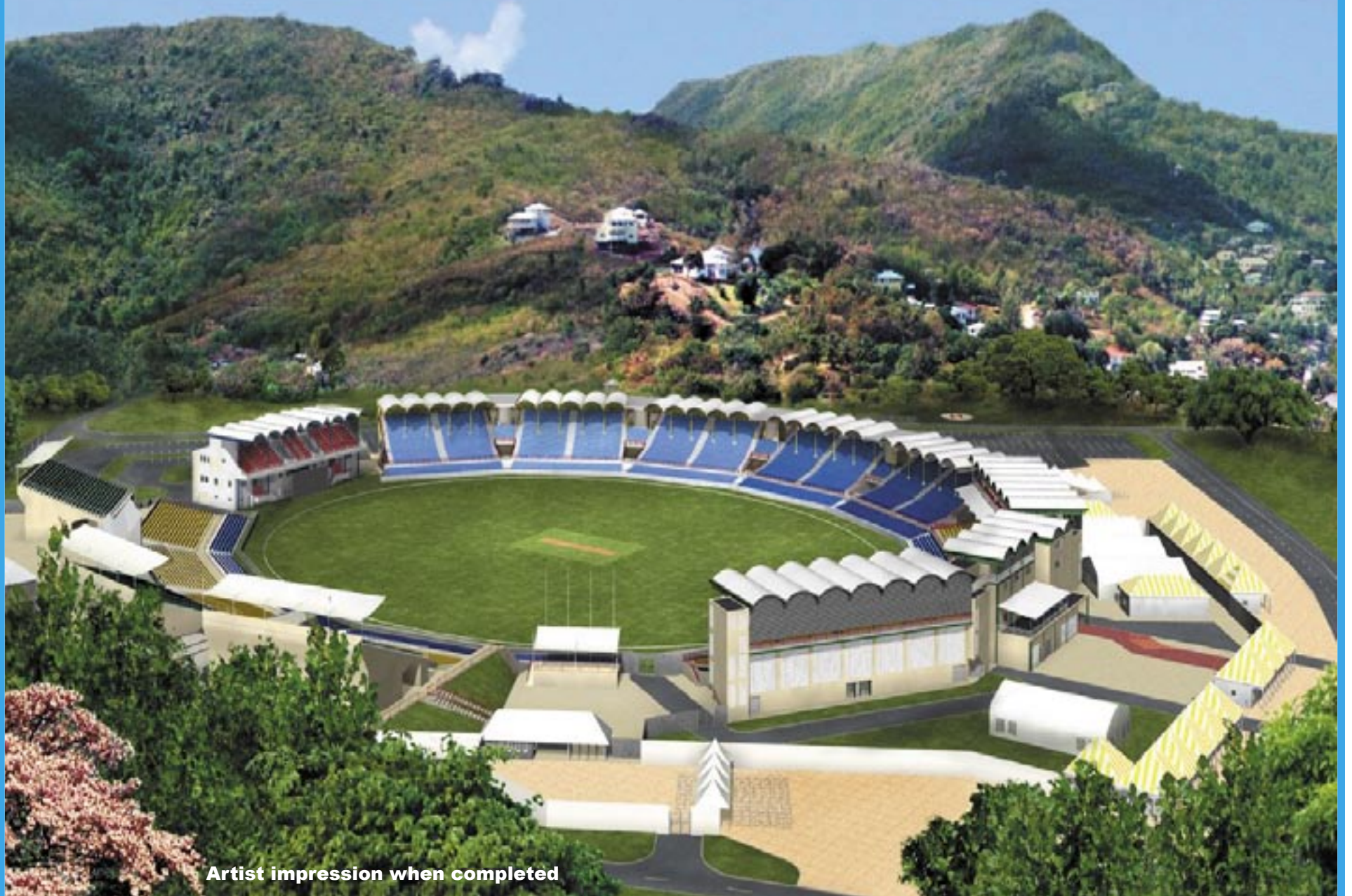
Artist impression when completed

“Committed to hosting the best cricket world cup ever”