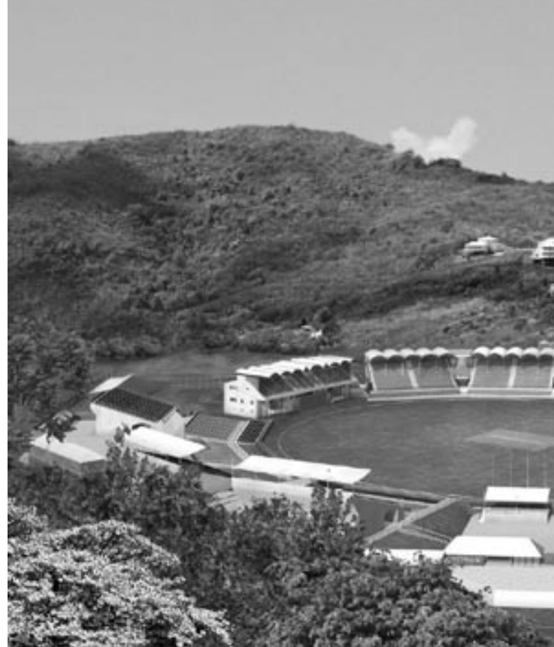
Artist impression of Beausejour Cricket Ground

sider that more than 66 million people visit America's 8,200 museums every year.