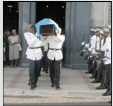
Remembering former Prime Minister Winston Cenac, QC - page 7