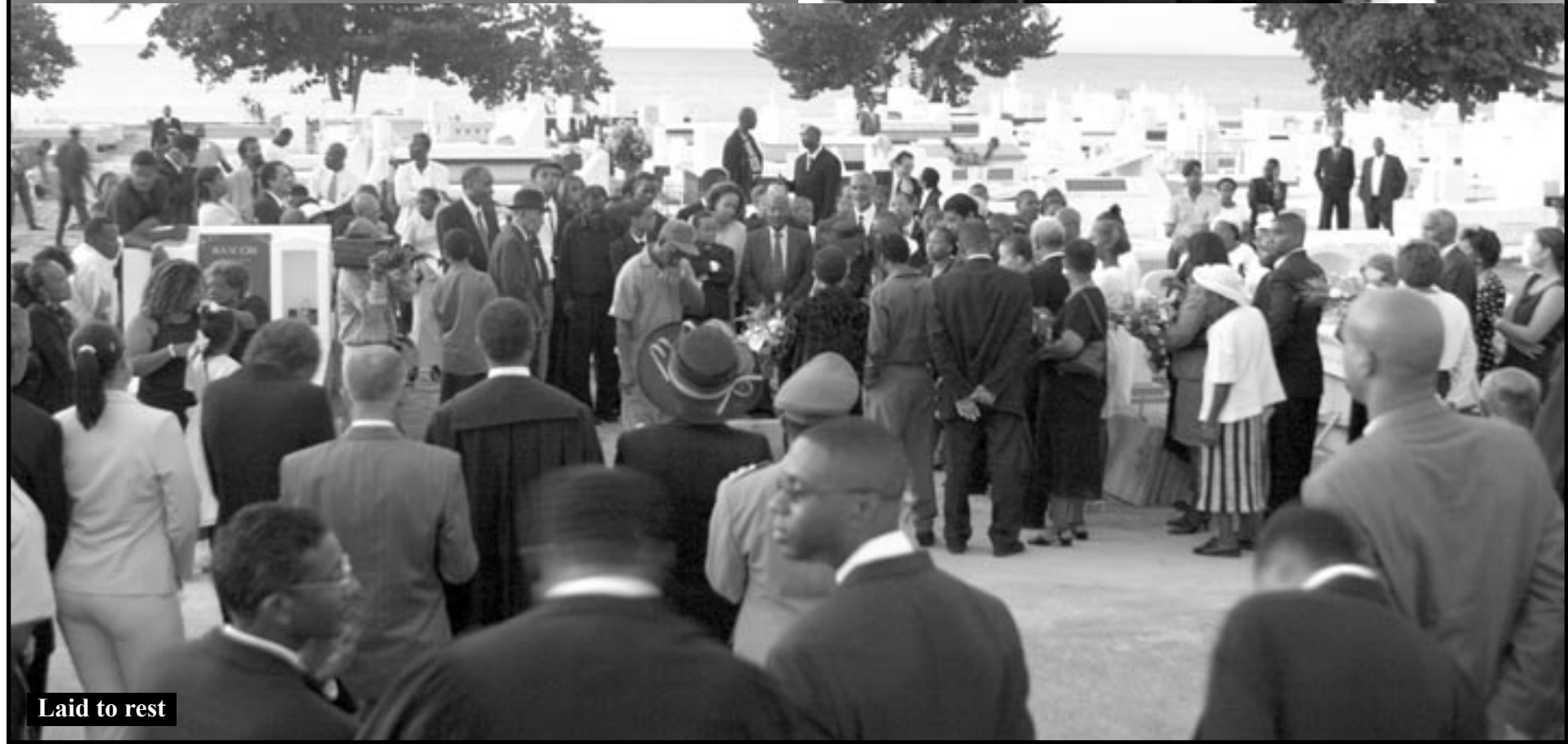
Laid to rest