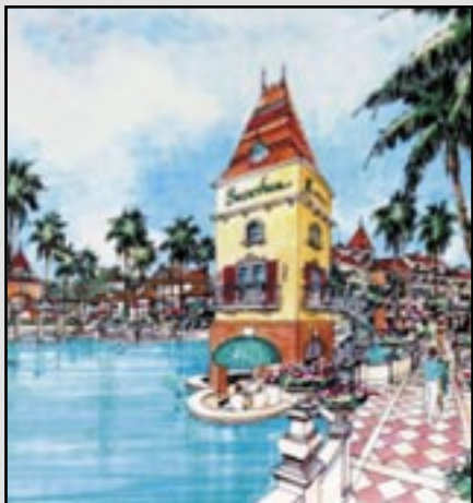
Sandals to build new Hotel- page 3