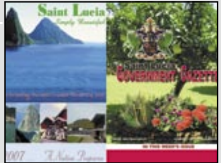
New-look Saint Lucia Gazette - page 6