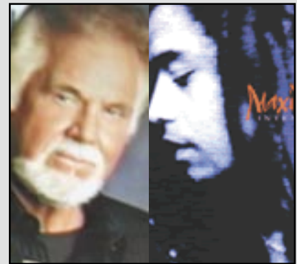
Kenny Rogers, Maxi Priest- coming to St. Lucia - page 8