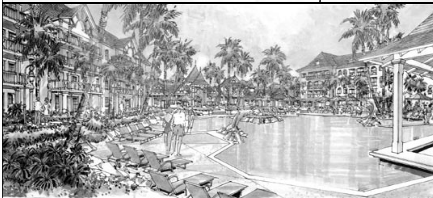
Artist impression of Caribbean Village