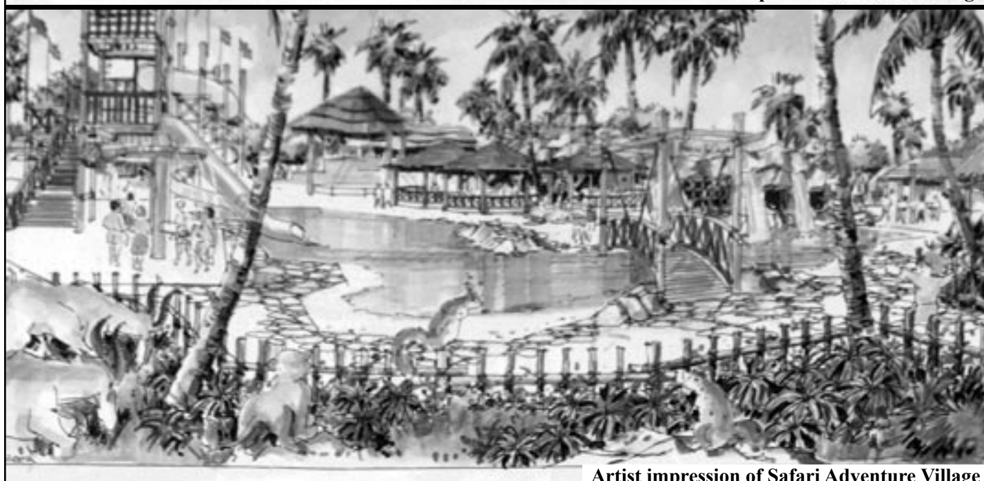
Artist impression of Safari Adventure Village

P rime Minister Dr Kenny D. Anthony has welcomed the announcement of the introduction of “Beaches”, a new line of hotel resorts about to be introduced to the island by the Sandals Group, ahead of the upcoming Cricket World Cup in 2007.