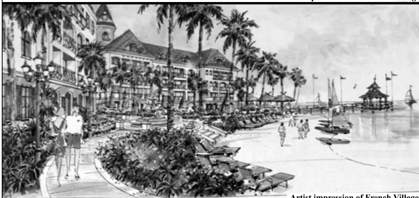
Artist impression of French Village