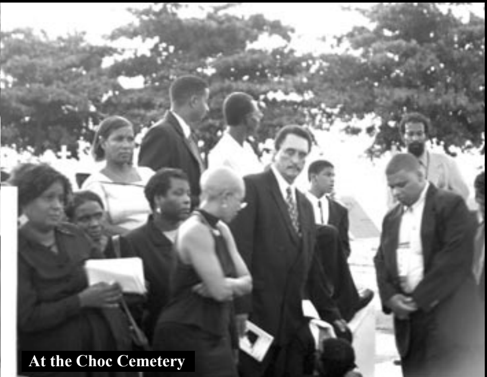
At the Choc Cemetery