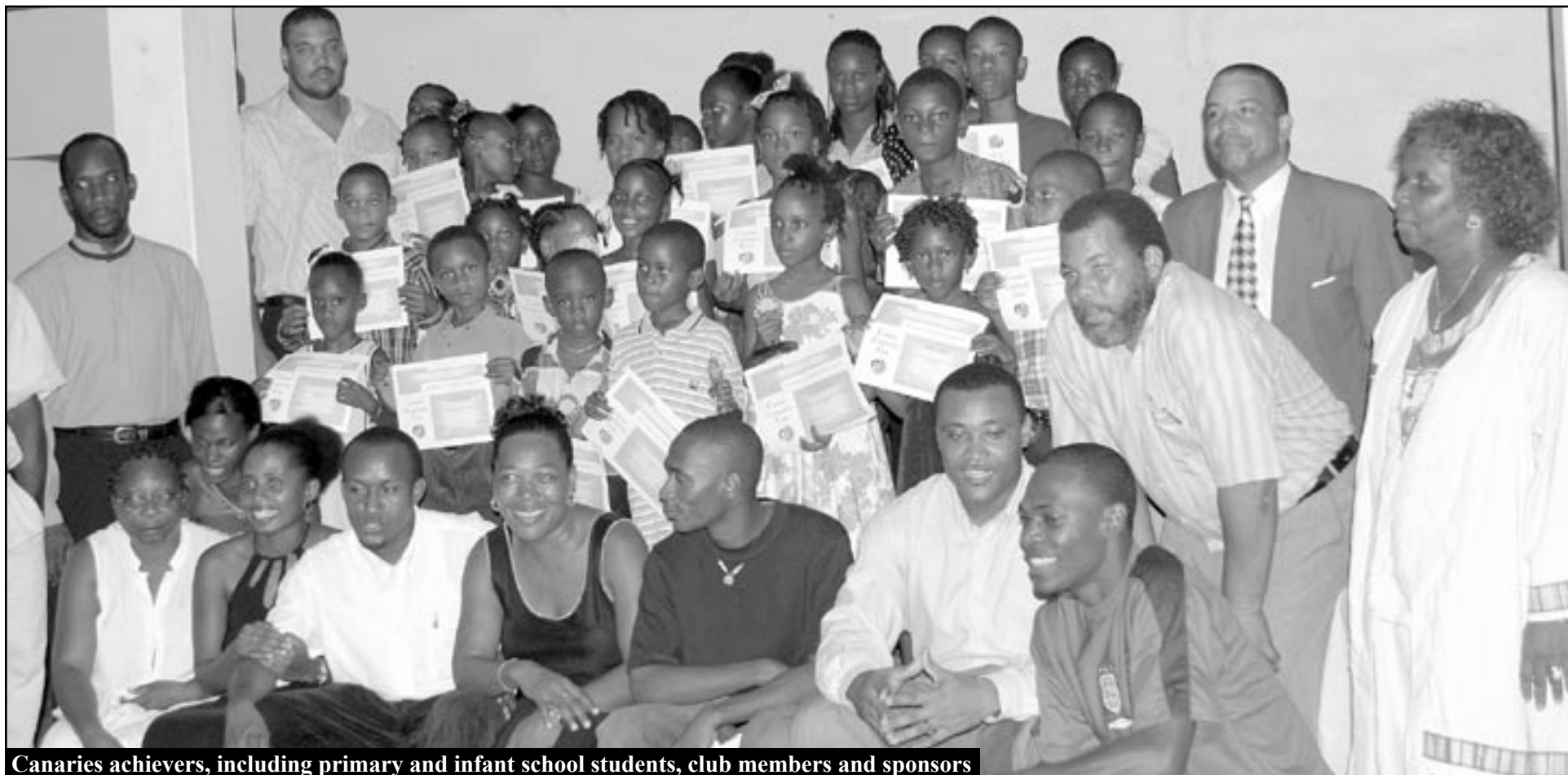
Canaries achievers, including primary and infant school students, club members and sponsors