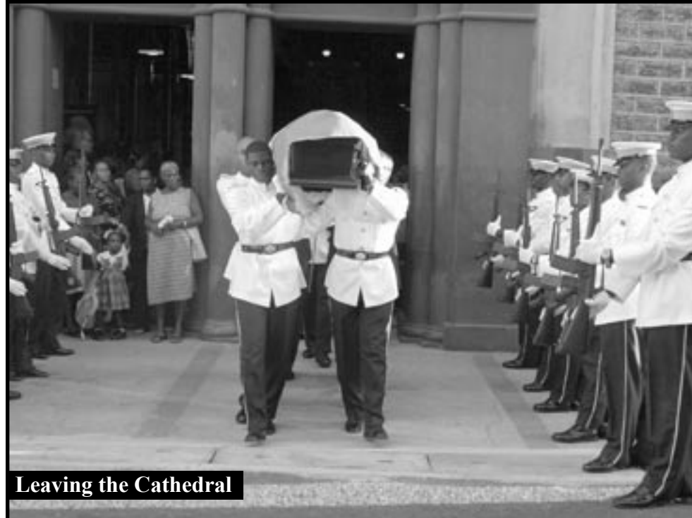
Leaving the Cathedral