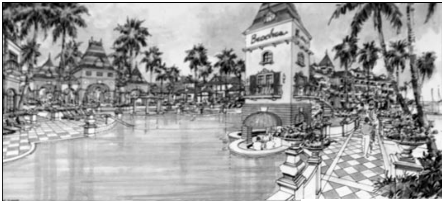
Artist impression of Main Pool & Plaza