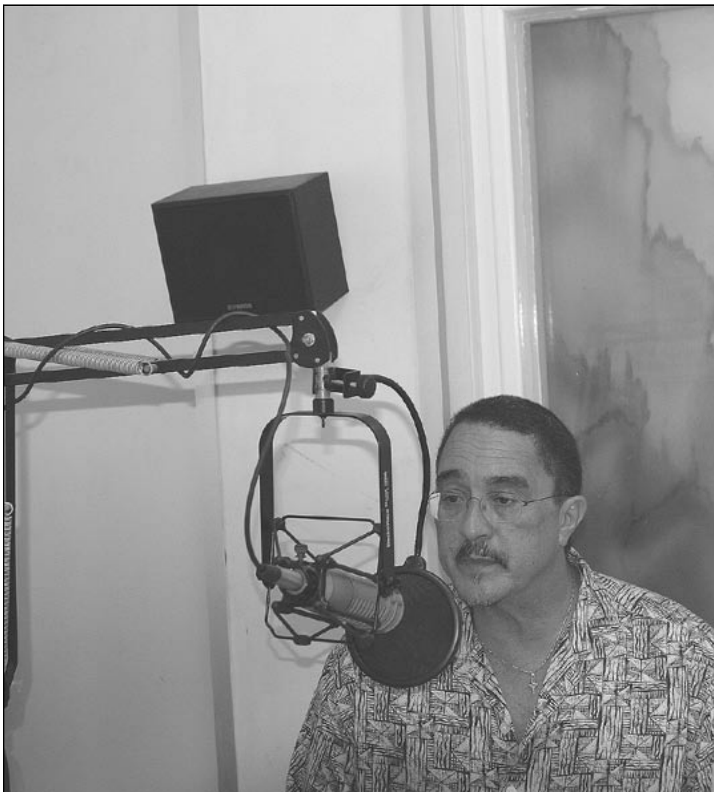
Prime Minister Dr. Kenny D. Anthony