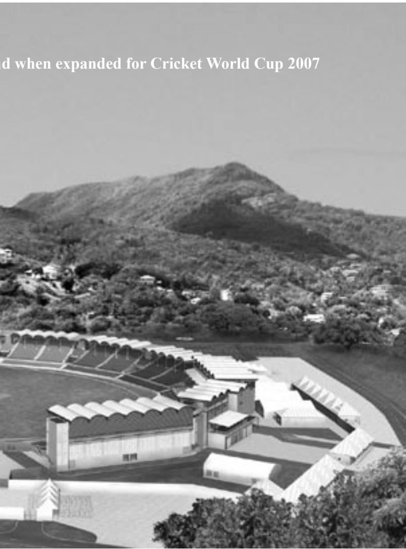
d when expanded for Cricket World Cup 2007

Rolex Cup regatta in St. Thomas, the Cayman Islands Super Fish Bowl, the Nikonos Shootout in Bonaire, the Tour de la Martinique, the Cockspur Gold Cup Horse Racing event in Barbados and Test Cricket generally in the Caribbean. With a relatively small investment by the country in most cases, and good support from sponsors, these events have had a high level of success.