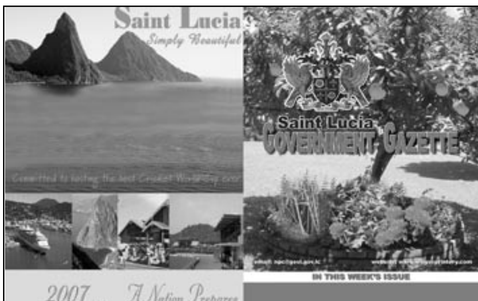
Back Cover of the new-look Saint Lucia Gazette