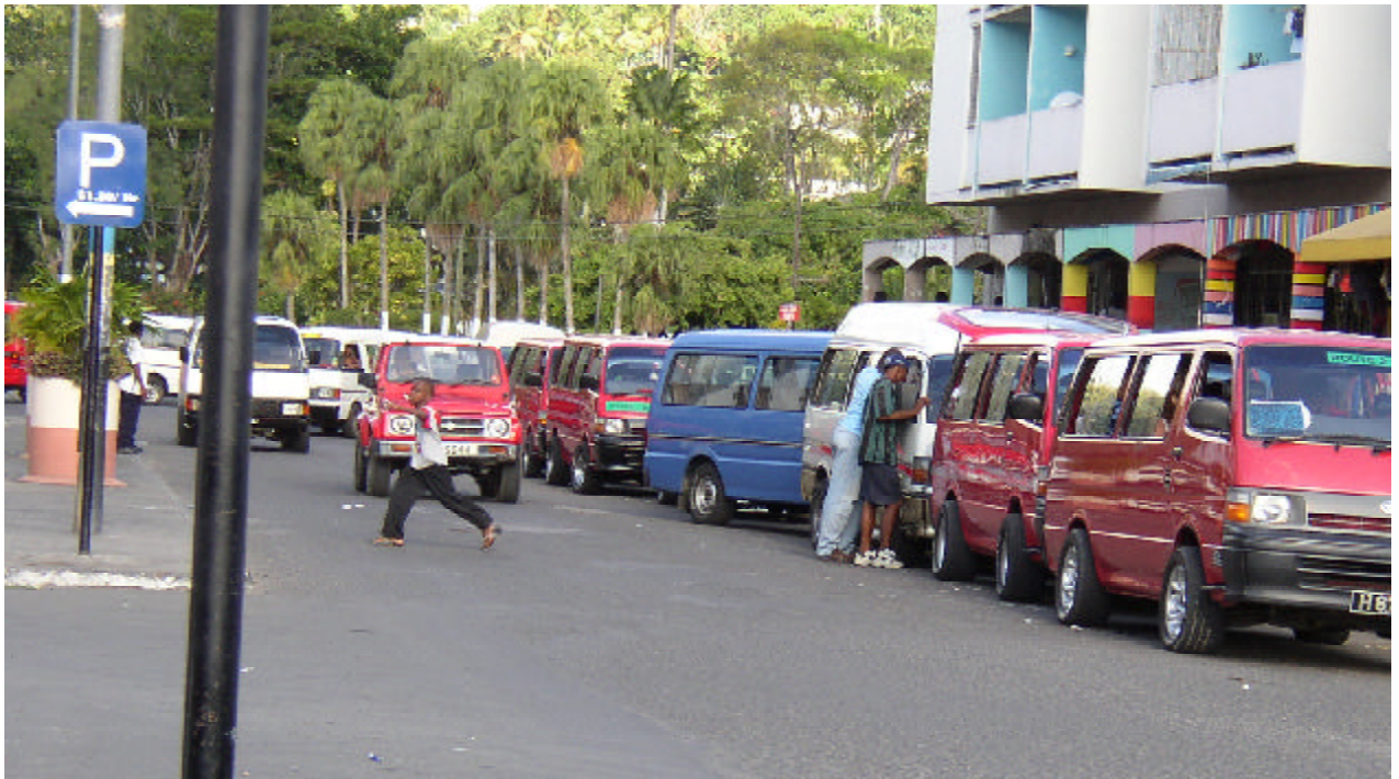
Minibuses awaiting passengers: two minibus terminals are to be built

s to an end,” he adds. e Ministry shall be e-month amnesty he end of September. t is not paid, we shall bands and the law shall be free to do one under the law.”