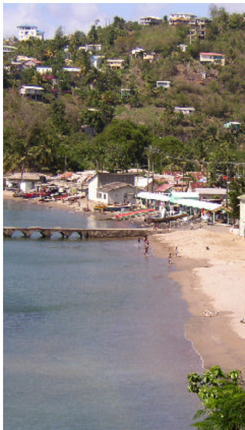
The Anse-La-Raye waterfront

I arcade has gone up replacing crudely built i used to dot the area. nue for the bustling t activity. Most other arket where tourists ally-made souvenirs e back home.