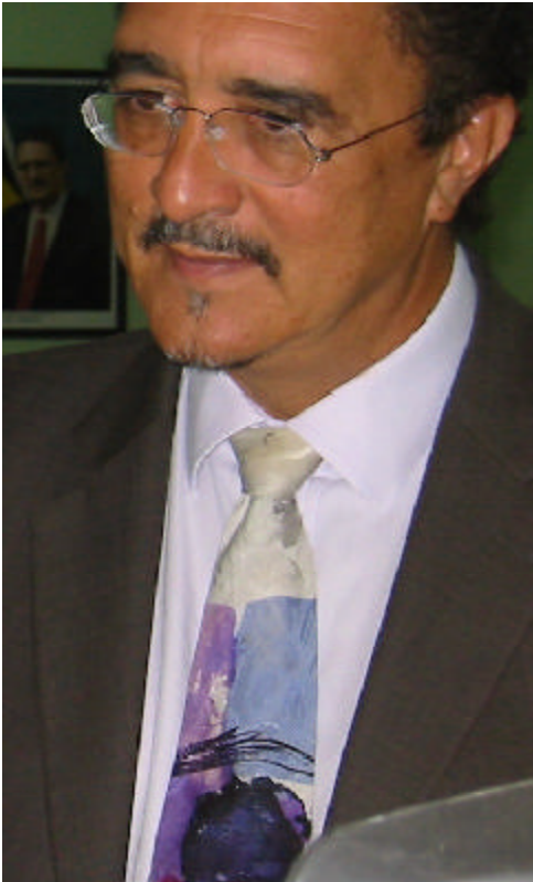
Prime Minister Dr. Kenny Anthony announced that Government will reduce the excise duty on new vehicles.

"I ask you to determine whether any government has given as much as we have by way of tax relief in this country over the