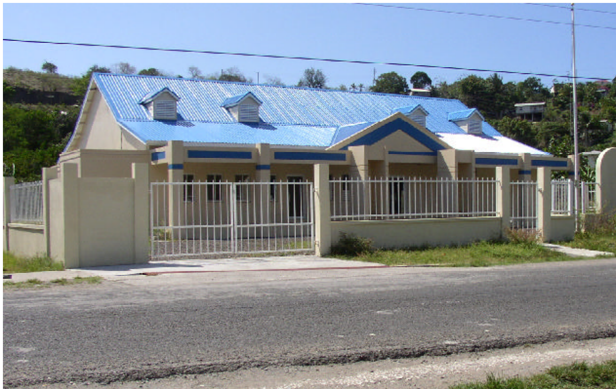
The new police station: part of the changing face of Anse-la-Raye.

The price tag on the new jetty is $3.5 million. Construction is scheduled to get going towards the end of the current financial year.