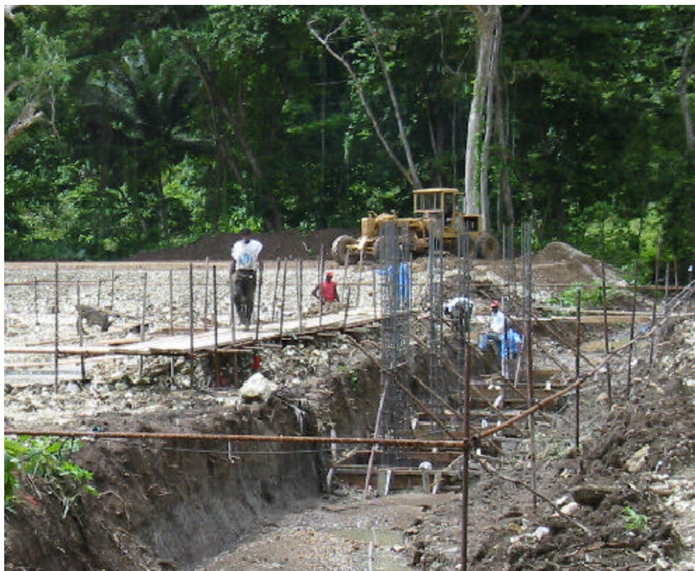
Workers in all sectors and industries will benefit from the implementation of the Code.

Government was hoping to have the Labour Code on the statute books much earlier in fulfillment of a key election promise. But employers raised objections to some aspects of the draft after the task force had completed its work, prompting a delay to consider their concerns.