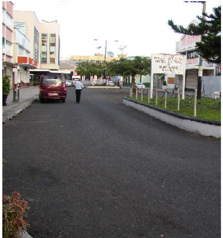
William Peter Boulevard: to be converted into a pedestrian mall

"As you put in your parking meters, your new parking wardens and so on, as you get the fines being paid, the two parking terminals will be an investment by the