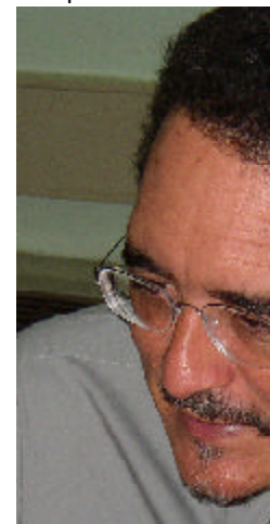
Prime Minister Dr. Ke efficiency is a key obj assistance to ensure market liberalization

In preparation for Government's supp amounting to more th 1997, has focused on i of local farms so th confidently stand up competition when it fir