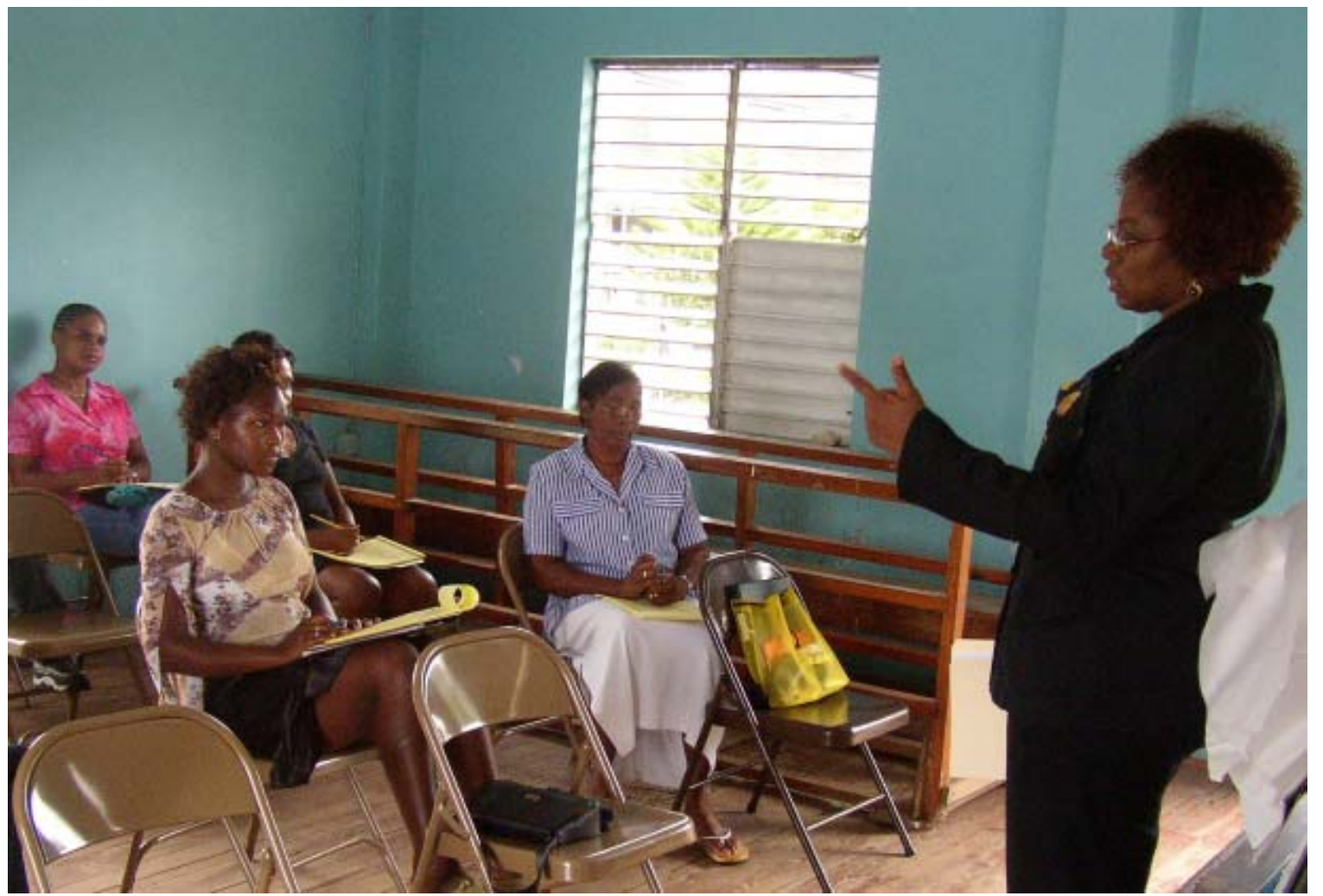
SHARPENING SKILLS: Participants in the training workshop last month.

"After testing the market by distributing samples from booths at Balenbouche and Pigeon Island during St Lucia Jazz earlier this year, the soap-making enterprise appears to be on the verge of clinching its first major contract."