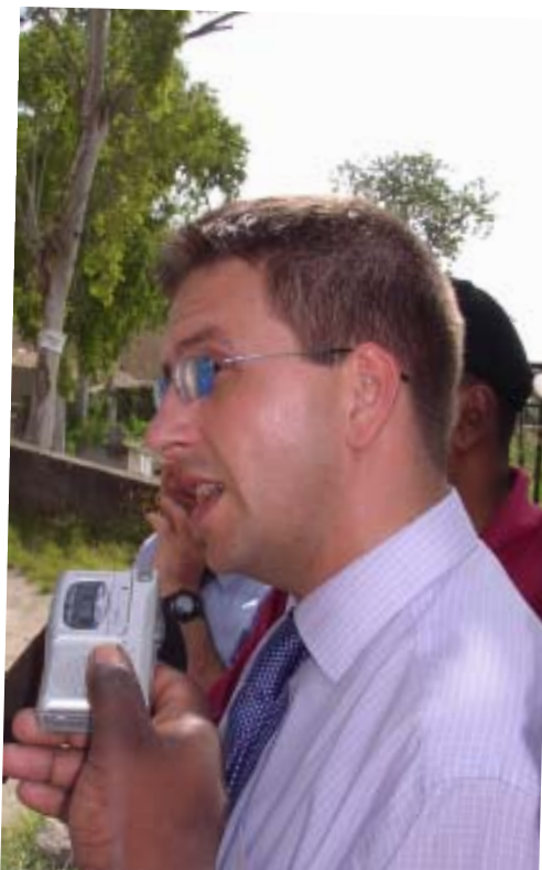
chat with reporters.

Lagan plans to construct the highway in two stages. The first stage will see work being done from Black Bay to the Wilrock Quarry in Laborie, which is supplying stones for the project. The next stage involves construction from Soufriere to Wilrock.