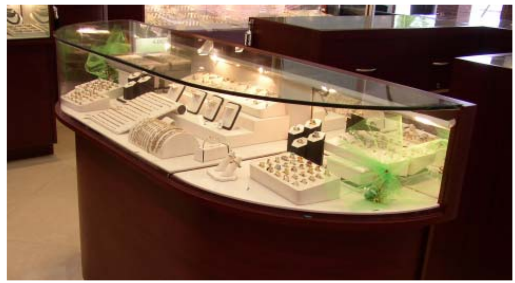
FINISHED PRODUCT: A display case at Diamonds International's Pointe Seraphine outlet.

"We have finally concluded a deal with them for the lease of one of our factory shells at Union for them to put that business into operation," says NDC General Manager, Wayne Vitalis. "It is envisaged that 120 people will be employed initially and within the next 12 to 24 months of operation, the number will peak at 280-290."