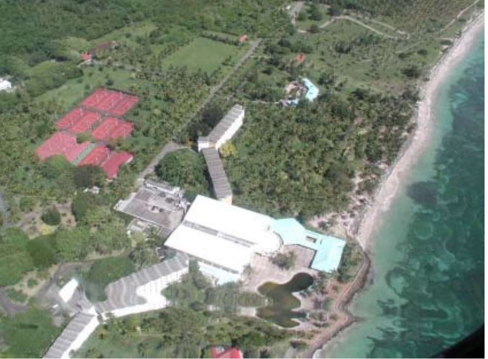
AERIAL VIEW: The old Club Med property as seen from the air.

Local suppliers, especially of agricultural produce, are expected to benefit in a