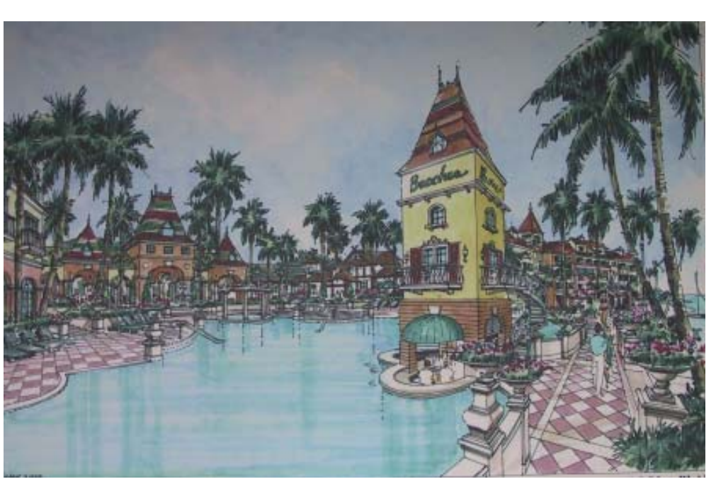
ARTIST'S IMPRESSION: A section of the proposed Beaches Resort.