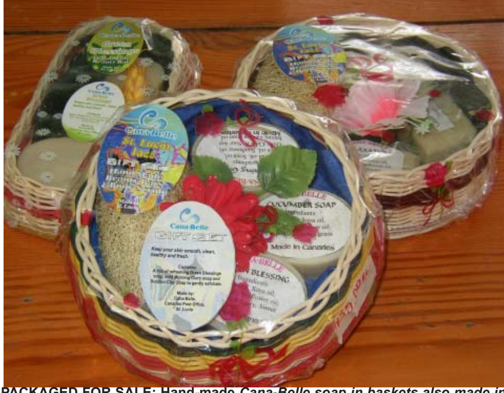
PACKAGED FOR SALE: Hand-made Cana-Belle soap in baskets also made in Canaries

The Canaries UK Association has already made a contribution to the building project. An approach has also been made to the Poverty Reduction Fund (PRF) for assistance.