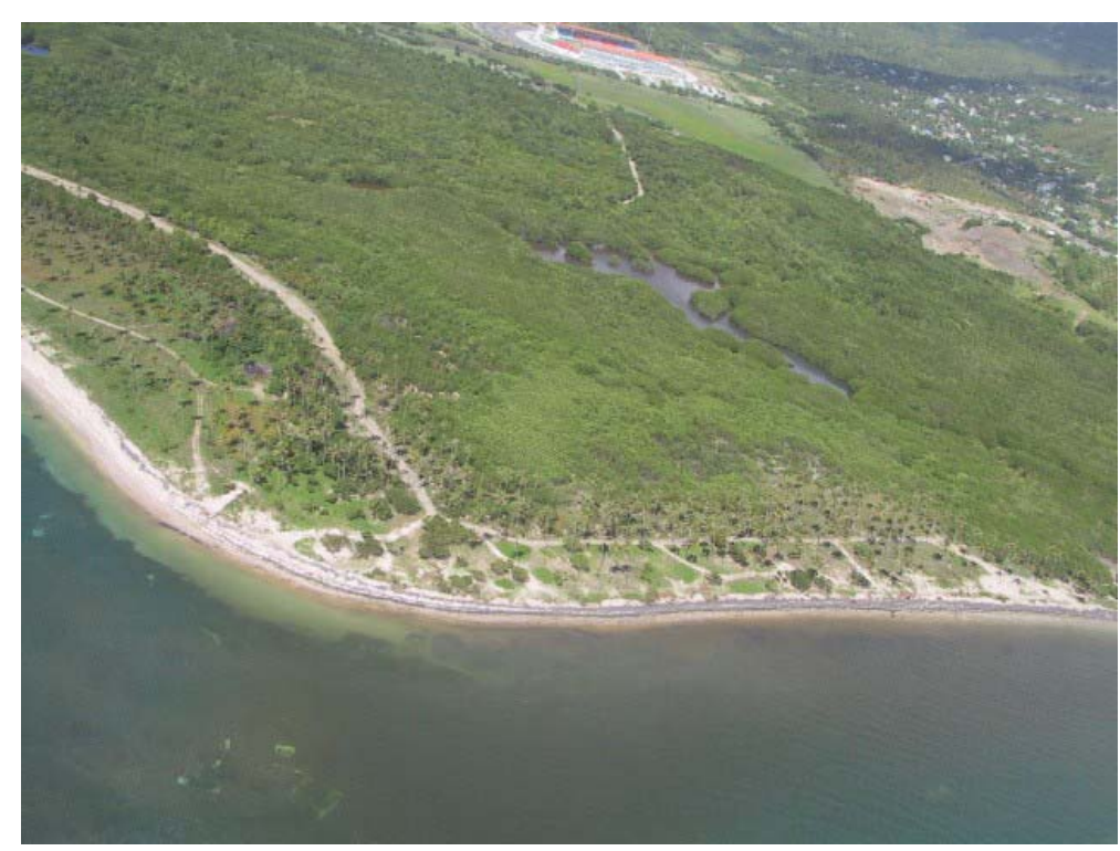
BOIS CHADON: Site of proposed Beaches Resort

"St Lucians and especially Vieux Fortians have a lot to thank the Prime Minister for in this project," he adds.