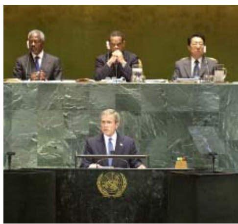
US President, George W. Bush, has Senator Hunte's (centre) full attention as he puts America's case to the General Assembly.

Five countries are permanent members of the Security Council: China, France, the Russian Federation, United Kingdom and United States. They wield what is known as 'veto power' which can effectively block any move any permanent member finds