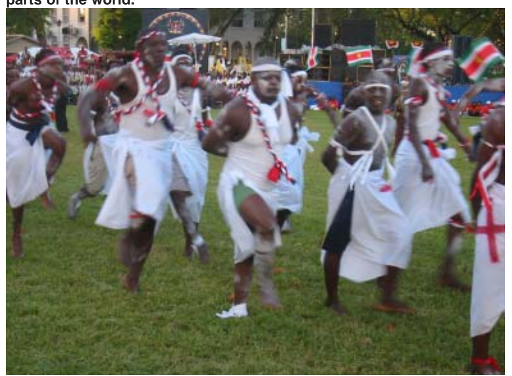
The gala opening of CARIFESTA was a great expression of Suriname's heritage

Saint Lucia received many requests for encores of the musical production but was unable to respond due to the tightness of the schedule.