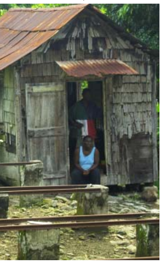
found all over the island.