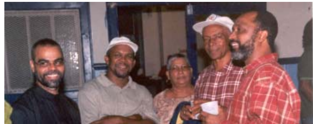
A section of the gathering at the meeting of St. Lucian residents from New York.