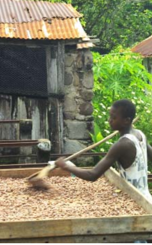
Heritage Tourism location

By bringing benefits to ordinary people throug their involvement in various enterprises, Ministe for Tourism, Hon. Philip J. Pierre, says heritag tourism serves to promote popular acceptance of tourism which is necessary for the industry success.