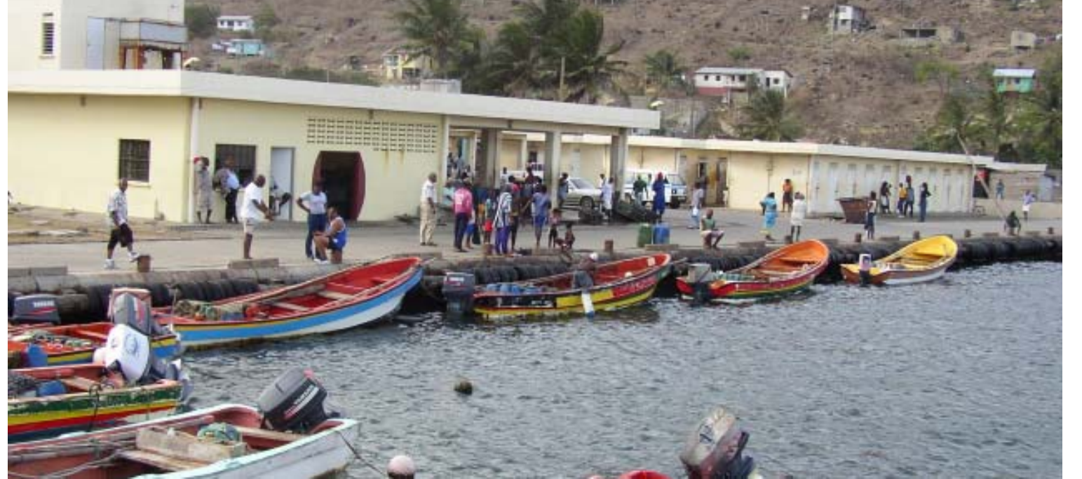
THE DENNERY FISHERIES COMPLEX: fishing is the leading economic activity in the village

"They are also going to assist us to vision forward," he adds. "This year, they will be assuming observer status so that they could help us with the future plans..."