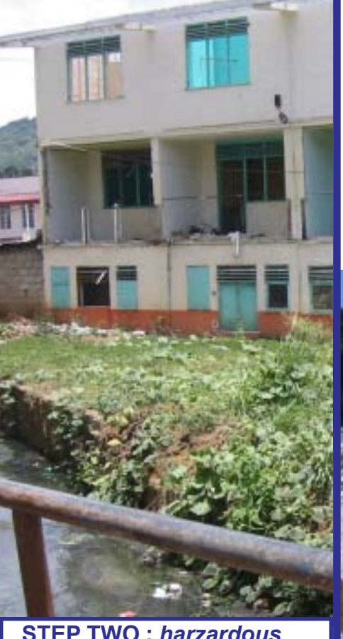
STEP TWO: harzardous materials removed.

In recent times the block CS and also block GS on its opposite side on Jeremie street began to lean. In fact when the music trucks for the carnival bands passed this route, once upon a time, the building shook. They were deemed unfit for use and demolition was recommended. It happened in April 2003. Block GS was demolished early May 2003.