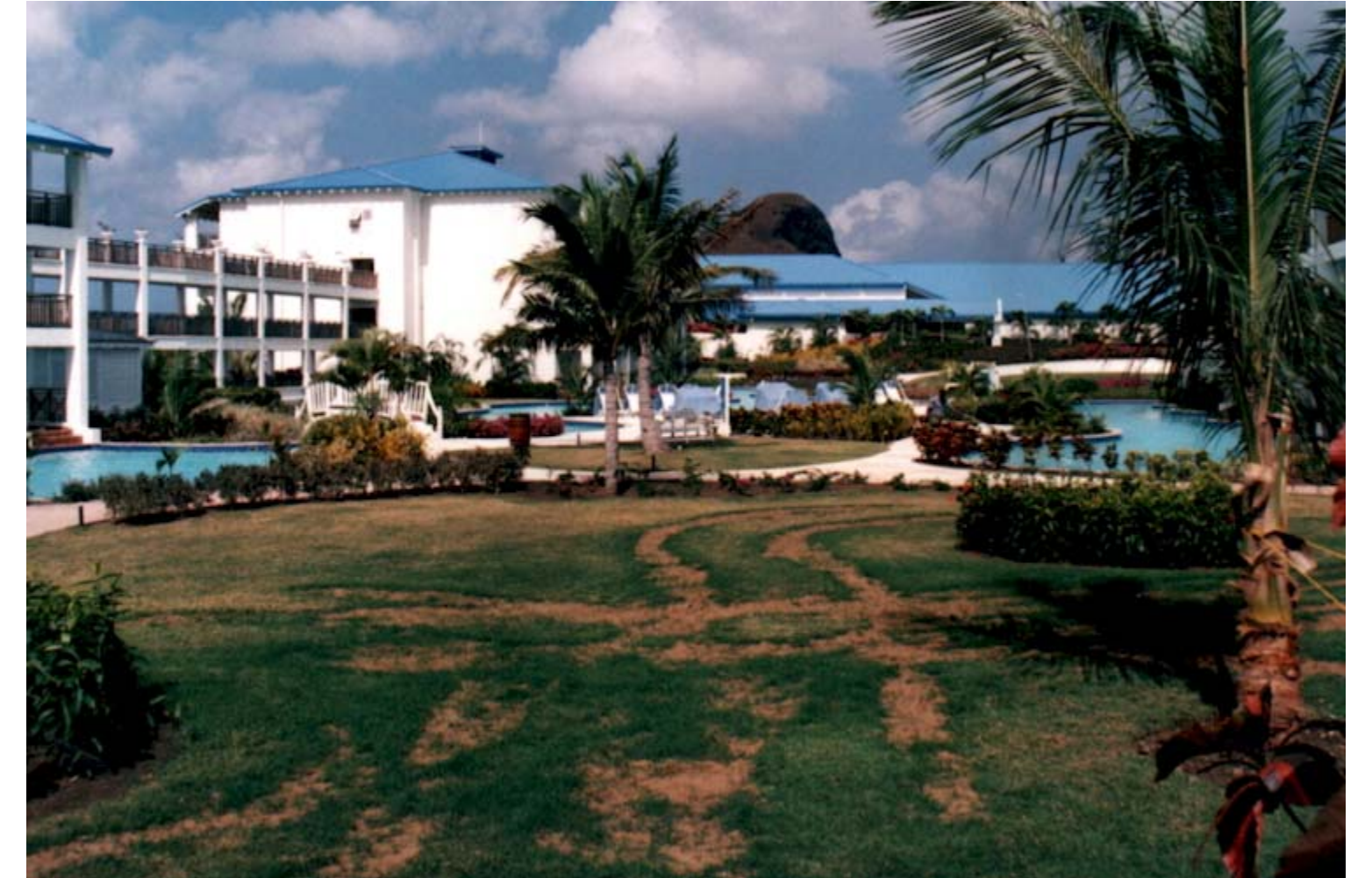
The former Hyatt, now Sandals Grande hotel: at the centre of the Rochamel issue.