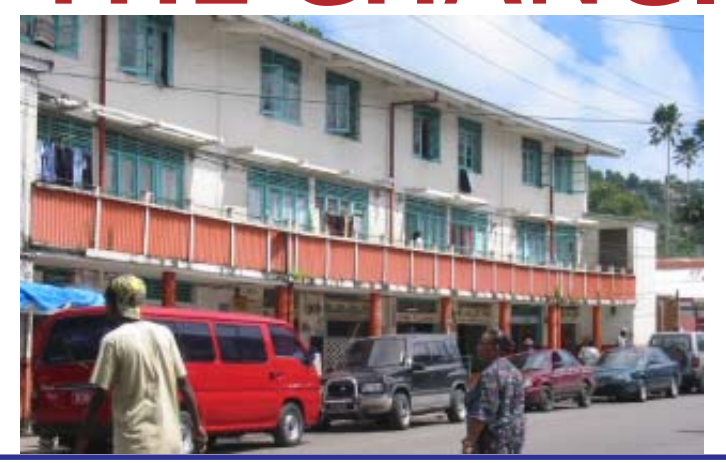
STEP ONE : Occupants notified of dangers and demolition plans.

Up to end of March 2003, Block CS on Jeremie street in Castries was home to many families some of whom had occupied apartments on the top floor of the building for over thirty years. Apartments on the ground floor were leased by small entrepreneurs who operated wholesale and retail liquor stores, dry goods and variety shops. Popularly known as the CDC buildings, the residential and commercial block was among many built, by the Colonial Development Corporation (CDC) to house persons who were displaced after a huge fire razed the port town of Castries in