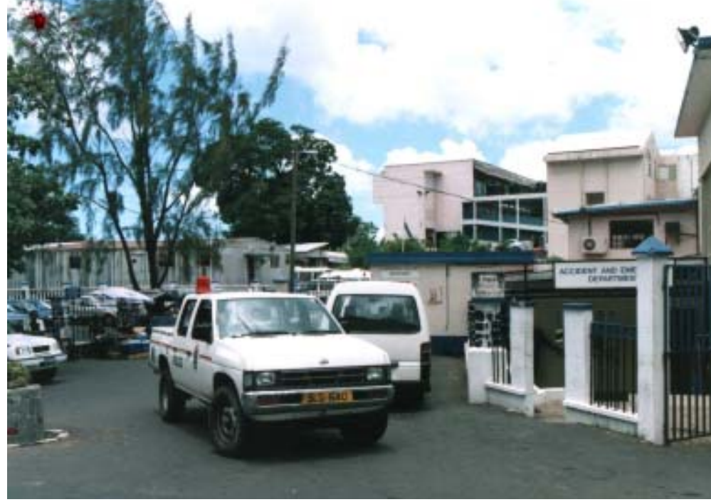
VICTORIA HOSPITAL: The surroundings are cleaner and patient care has shown a significant improvement, as Government prepares to construct a new state-of-the-art general hospital.

The shift from a custodial to a more community-based rehabilitative approach to