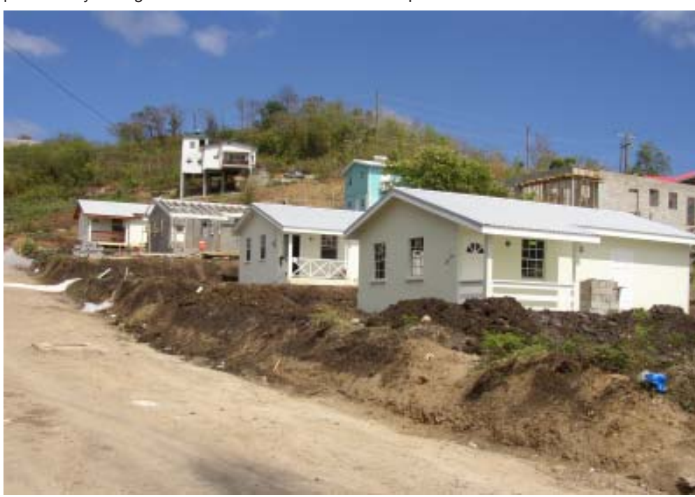
HOUSING THE NATION: homes under construction at Beausejour.