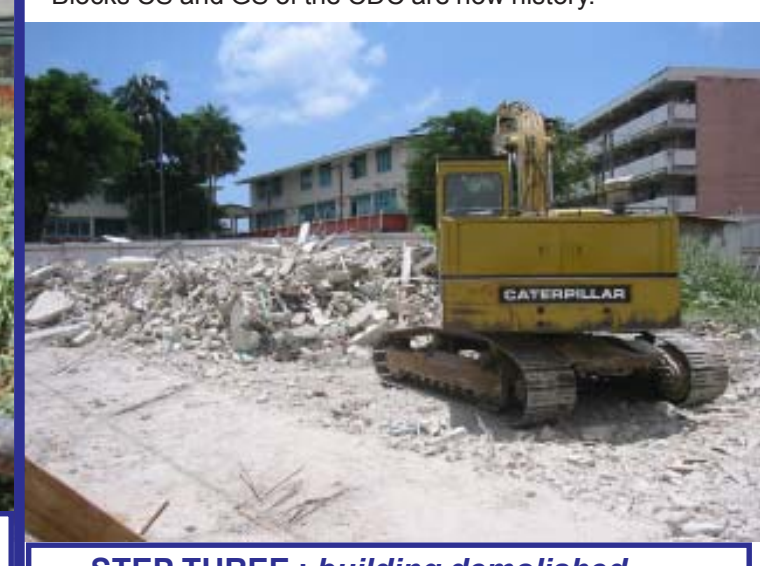
STEP THREE : building demolished

Blocks CS and GS of the CDC are now history.