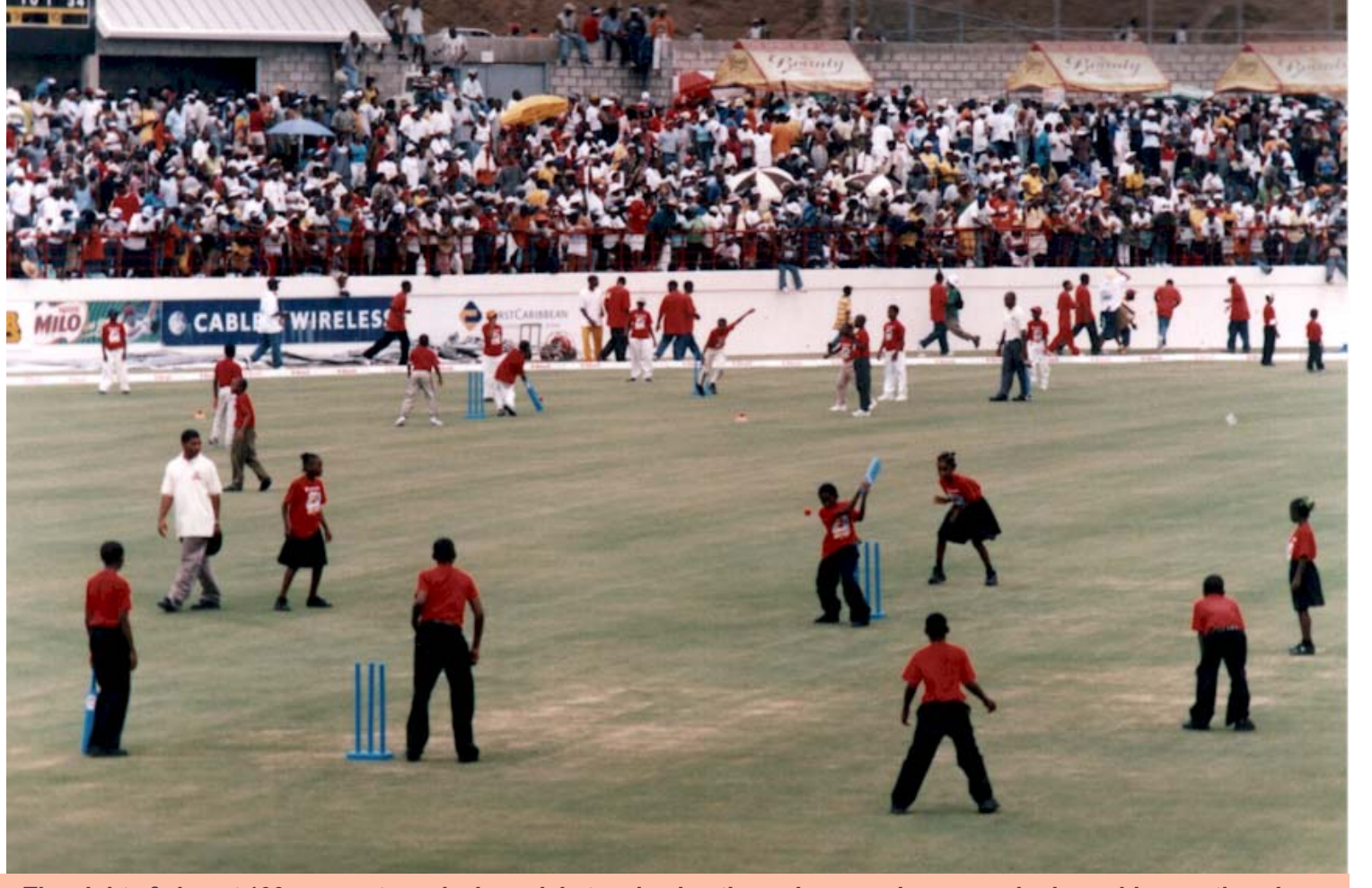
The sight of almost 100 youngsters playing cricket and going through some choreographed coaching routines have become commonplace during the lunch breaks of games between the West Indies and visiting cricket teams. They adorned the immaculate greens of the Beausejour Cricket Ground during the third One Day International between the West Indies and Australia on May 21, 2003.

The recent One Day International cricket match between Australia and the West Indies, once gain put the new cricket ground at Beausejour to the test. It passed.