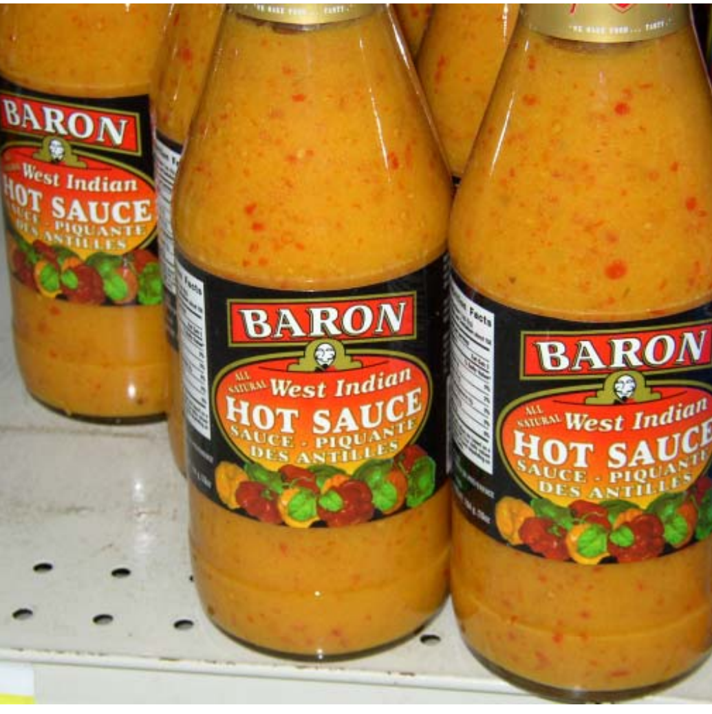
St Lucian pepper sauce: a success story in penetrating export markets as far away as Africa.

espite the challenges, Pierre does acknowledge here are opportunities which participation in the TAA can open up for St Lucia.