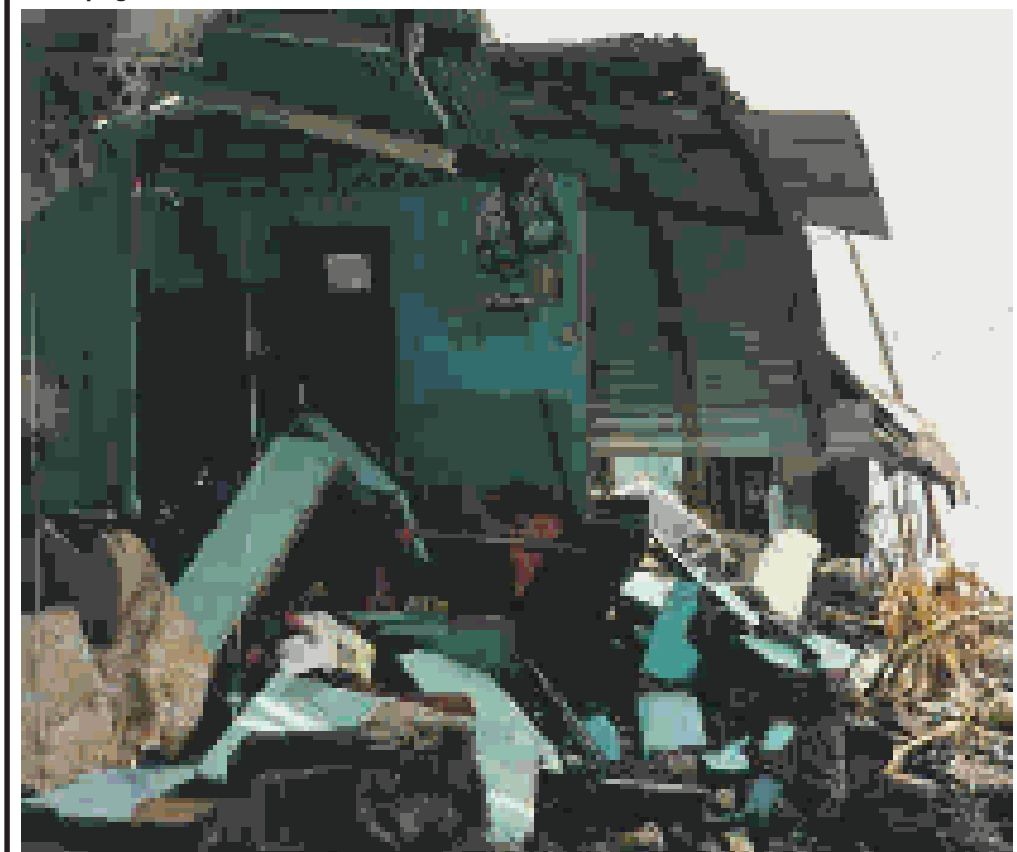
Destruction from a tropical storm.

Beginning in 1994 Saint Lucia faced a barrage of hazards. These included, Tropical Storm Debby in 1994; the Oil Spill in the Cul de Sac Bay in 1995; the fires at Victoria Hospital and Patterson's Gap and the Tropical Wave of Jounen Creole in 1996; the Boguis Landslide of 1997; the rains of Independence in February and the Tropical Wave in October in which a child died in 1998; Hurricane Lenny and the Black Mallet/Maynard Hill Landslide in 1999; the attack at the Minor Basilica of the Cathedral of the Immaculate Conception in 2000; Tropical Storm Lily in 2002.