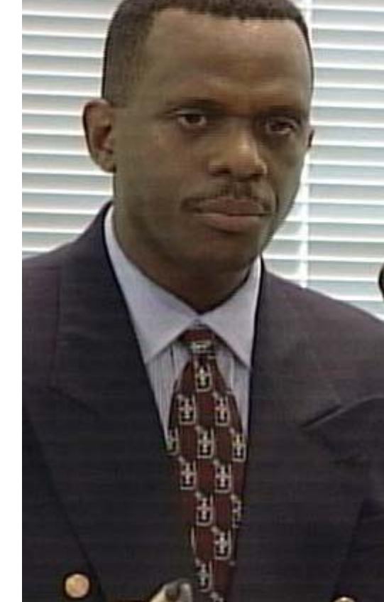
Hon. Philip J. Pierre, Minister for Commerce Tourism, Investment and Consumer Affairs

Recognizing the challenges as well as the opportunities which globalization and trade liberalization present to St Lucia, government has adopted an industrial policy as a sort of roadmap to chart a future for business on the island. Getting them export-ready was a key objective.