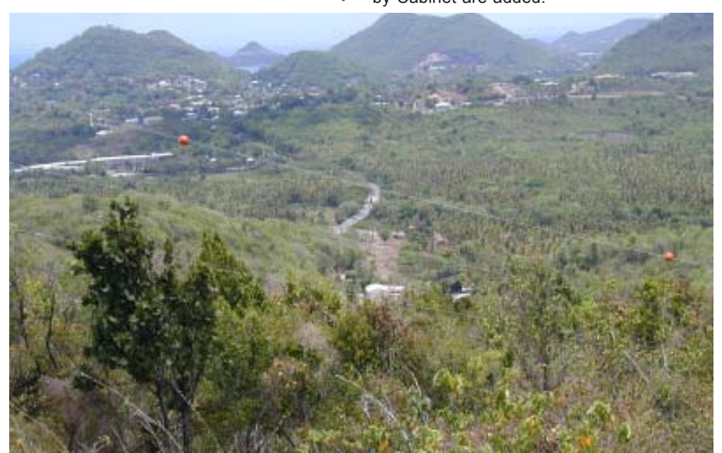
{\tt CHOC\ GARDENS:}\ A\ panoramic\ view\ of\ the\ site\ of\ St\ Lucia's\ biggest-ever\ housing\ project.

Land prices under the programme range from $1.50 to $2.50 per square foot depending on the location. Before the lots are offered for sale, Government is putting in all the necessary infrastructure – roads, water, electricity, drainage, etc. The land prices are even lower when special discounts approved by Cabinet are added.