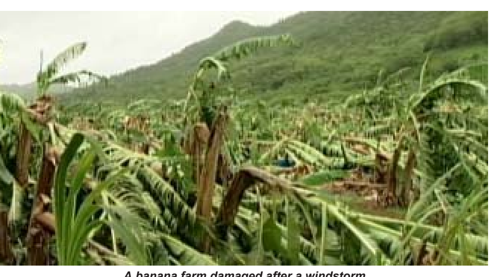
A banana farm damaged after a windstorm.

On the issue of Mangroves, which are s important for our coastal fishery and for the