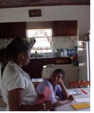
Discussions are held with all persons in the household.