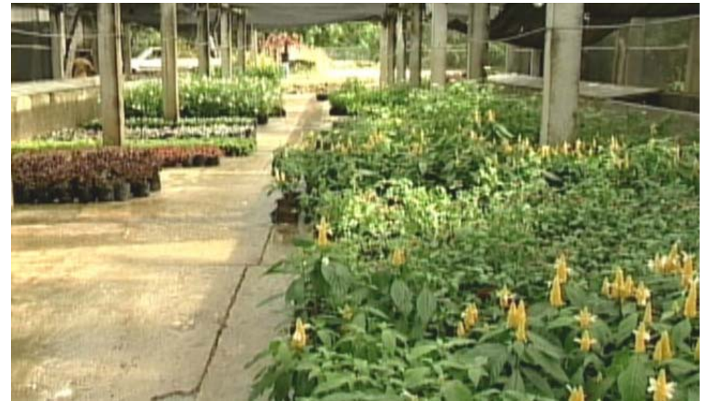
Plant propagation can become a source of income and a response to deforestation

The ultimate solution will involve getting the commitment of all concerned, from the policy maker down to the producer and consumer, in taking decisive action. In 1987, the World Commission on Environment and Development formulated 'a global agenda for change' and articulated that agenda in a publication entitled "Our Common Future". To quote from that publication, it was meant to serve "notice that the time has come for a marriage of economy and ecology, so that governments and their people can take responsibility not just for the environmental damage, but for the policies that cause the damage. Some of these policies threaten the survival of the human race. They can be changed. But we must act now." That was 15 years ago. We are still grappling with getting these policies changed, so Mr. Moore's options for dealing with Global Environmental Change may not be as ludicrous and facetious as they sound.