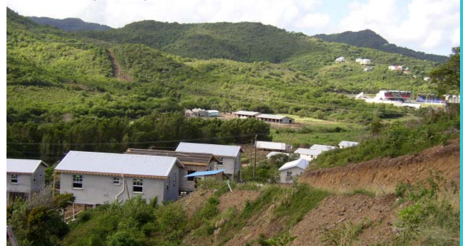
New houses under construction at the Beausejour development, for low income earners. The cricket ground in the background.

The hard hard-working teams at the the Attorney-General's Chambers and the Ministry responsible for Justice, have rendered yeoman service to St Lucia. For this they deserve the nation's highest commendations and also for making St Lucia a model law-making country that's highly respected in the Caribbean and beyond.