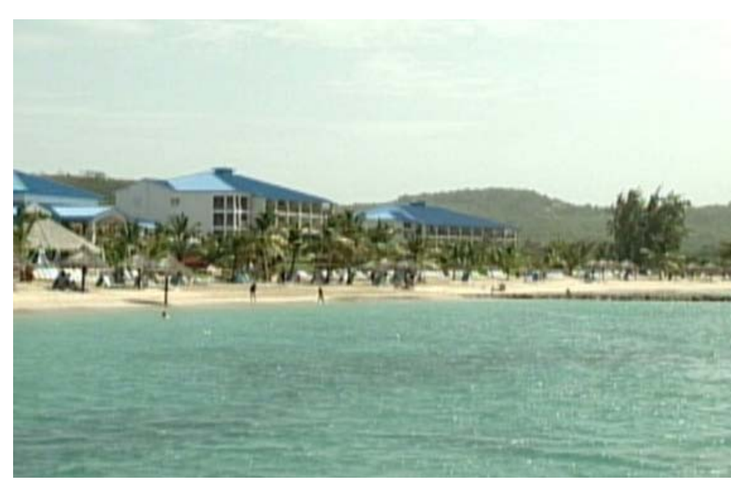
Hotels and resorts built near the shore can be easily affected by rising sea levels.

If we are to accept, then, that GEC is indeed reality, what can we expect to happen in th Caribbean as a result of these changes?