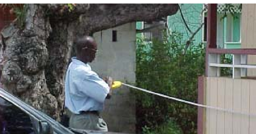
Gathering up-to-date reliable information to value residential properties

Combination Property: means property used both as residential and commercial property. (Persons with properties have both commercial and residential uses should contact the Inland Revenue Department)