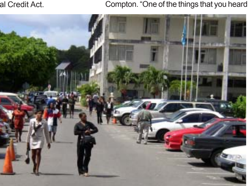
Workers in the public and private sector will find additional protection under new laws.

"We have also been seeking to protect (St. Lucians) from the professions," says Compton "One of the things that you heard