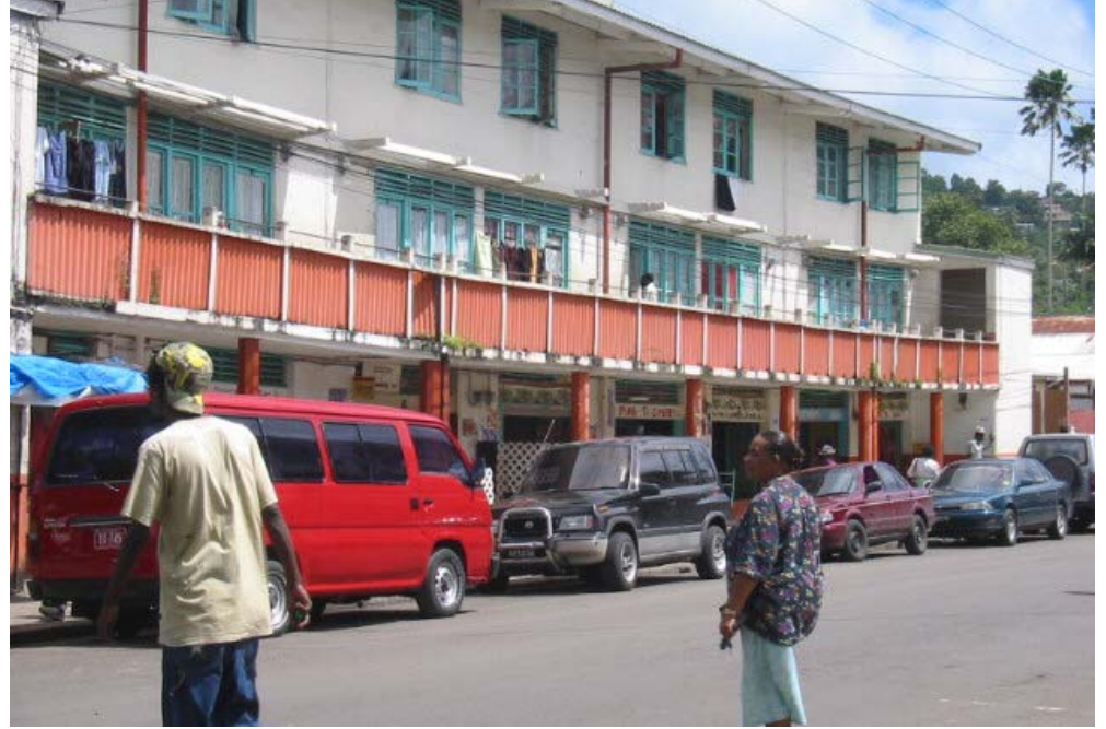
One of the CDC apartment blocks earmarked for replacement. Engineers have advised that these buildings are no longer safe.

Meanwhile, the NHC is moving tenants out of Blocks CS and GS in the old CDC because these 50-year-old buildings have been deemed structurally unsound. The NHC is using vacant units elsewhere in the old CDC and on Darling Road to provide