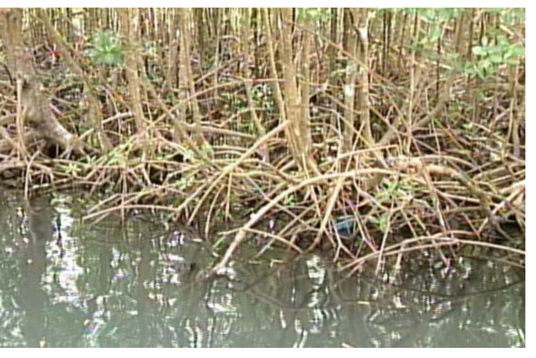
Mangroves are essential for food security but rapidly disappearing

ediment trapping and erosion protecting haracteristics, it is noted that they can be dversely affected if the sedimentation rate exceeds the rate of sea level rise. If this occurs, sequence of events may be unleashed, including hangrove zone migration inland and seaward hargin erosion. Additionally, sea level rise will have also result in death of the mangroves. Sea evels are not the only factor that can impact on hangroves. Elevated water temperatures, excessive precipitation, decreased rainfall or increased evaporation can all affect the integrity of mangroves.