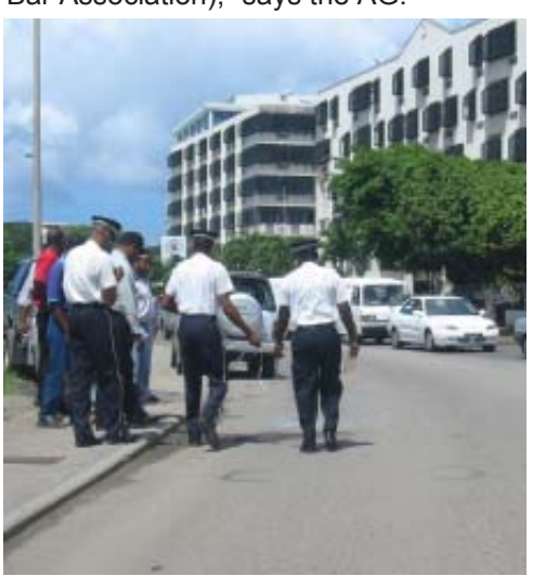
Police on the scene of a traffic accident in Castries. New laws will also influence traffic management.

"We say no. The Legal Profession Act was passed to allow the disciplining of lawyers who abuse people. It is working because there have been a number of matters heard before the Disciplinary Committee (of the Bar Association)," says the AG.